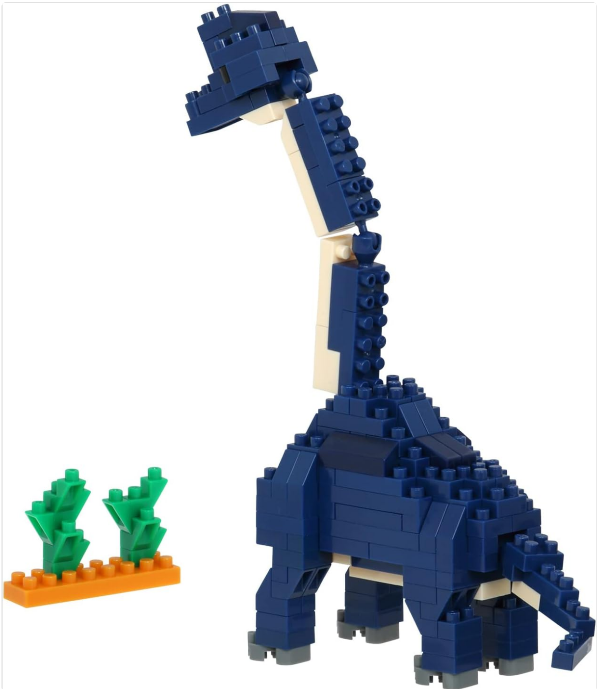
Image 4.2: An angled view of the nanoblock Brachiosaurus model, highlighting its textured block construction and the accompanying miniature foliage.