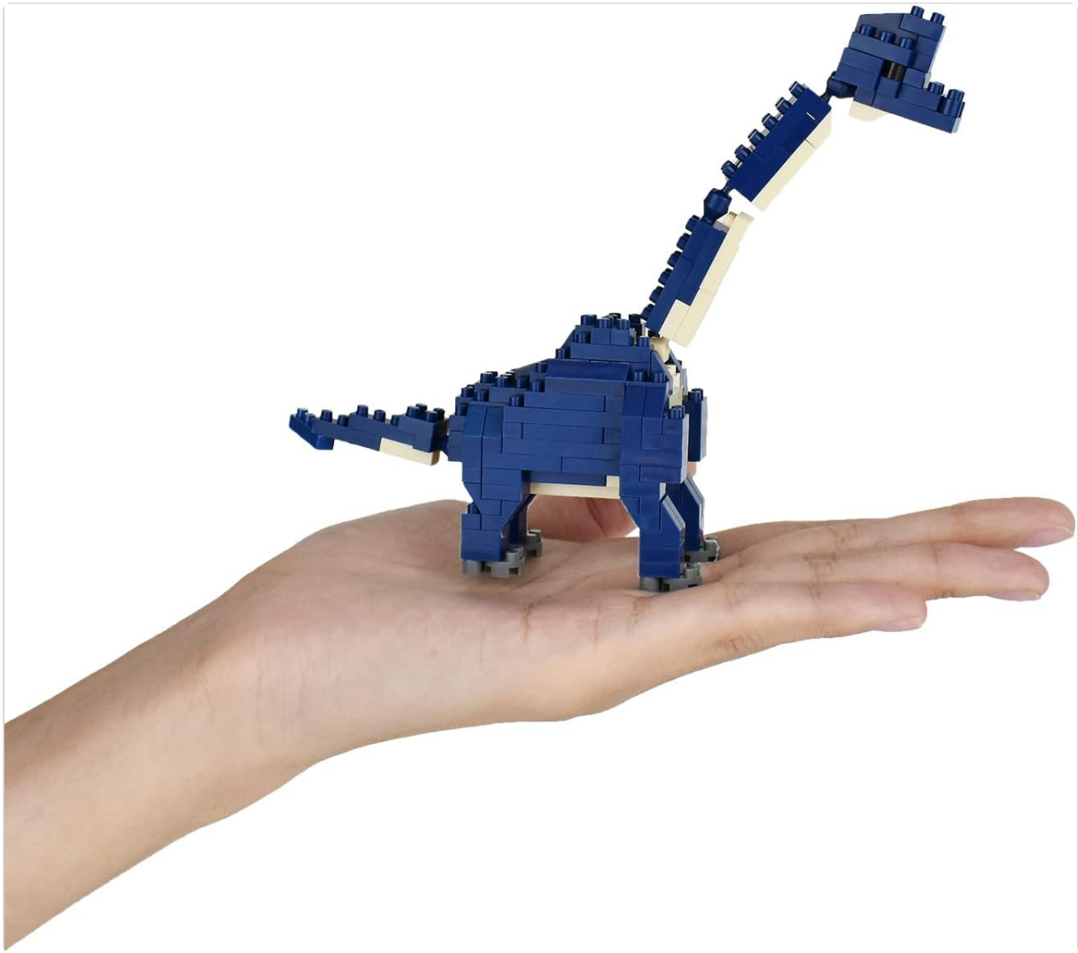
Image 3.2: The nanoblock Brachiosaurus model shown in a hand, illustrating its compact, micro-sized scale.