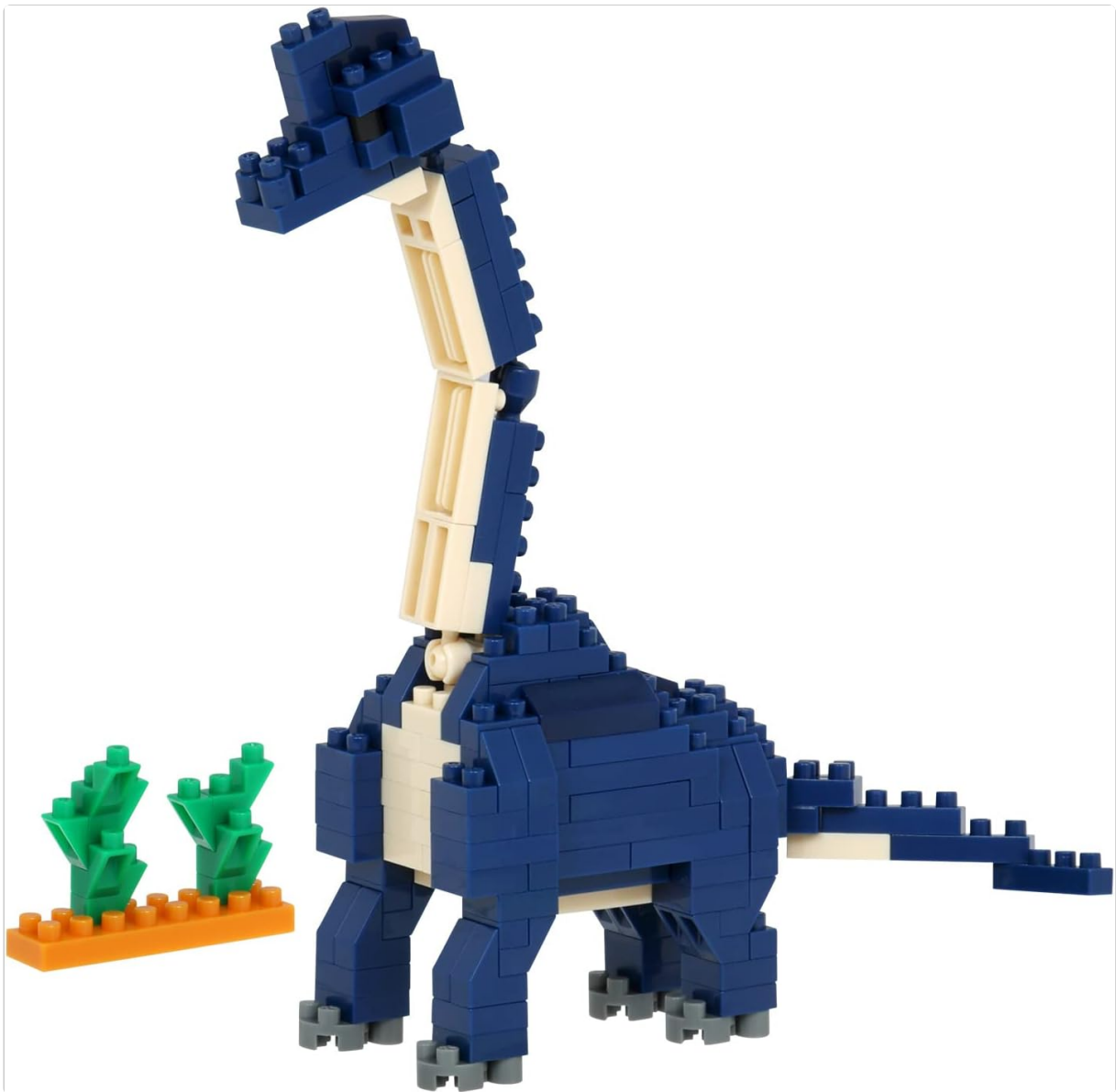
Image 3.1: The fully assembled nanoblock Brachiosaurus model, standing approximately 4.79 inches tall.