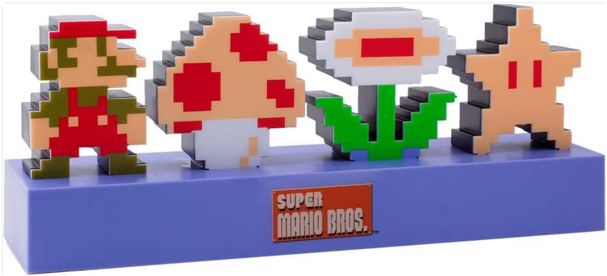
Image: The Super Mario Bros Icons Light illuminated, showcasing the vibrant glow of the pixelated Mario, Mushroom, Fire Flower, and Star icons.