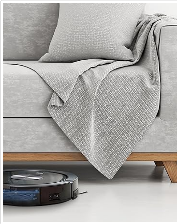
Image: The ZACO V6 robot vacuum cleaner actively cleaning a floor, demonstrating its high suction power.

The direct suction feature is particularly effective for pet hair, preventing tangles often associated with roller brushes.