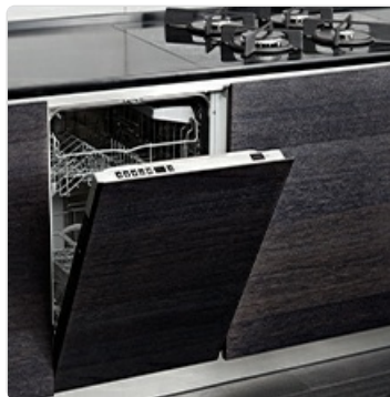
Image: The pan is suitable for cleaning in a dishwasher.