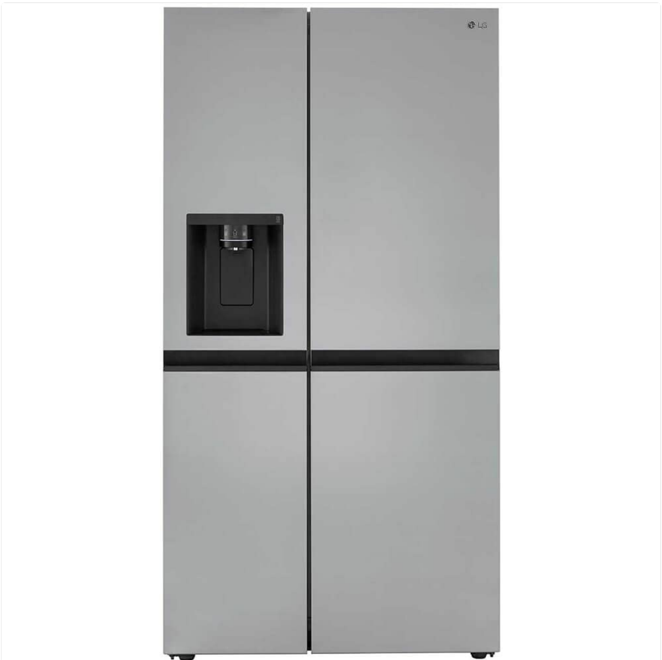
Front view of the LG 27 cu. ft. Side-by-Side Refrigerator (Model LRSXS2706S) with overall dimensions. The refrigerator features a stainless steel finish and an external ice and water dispenser.