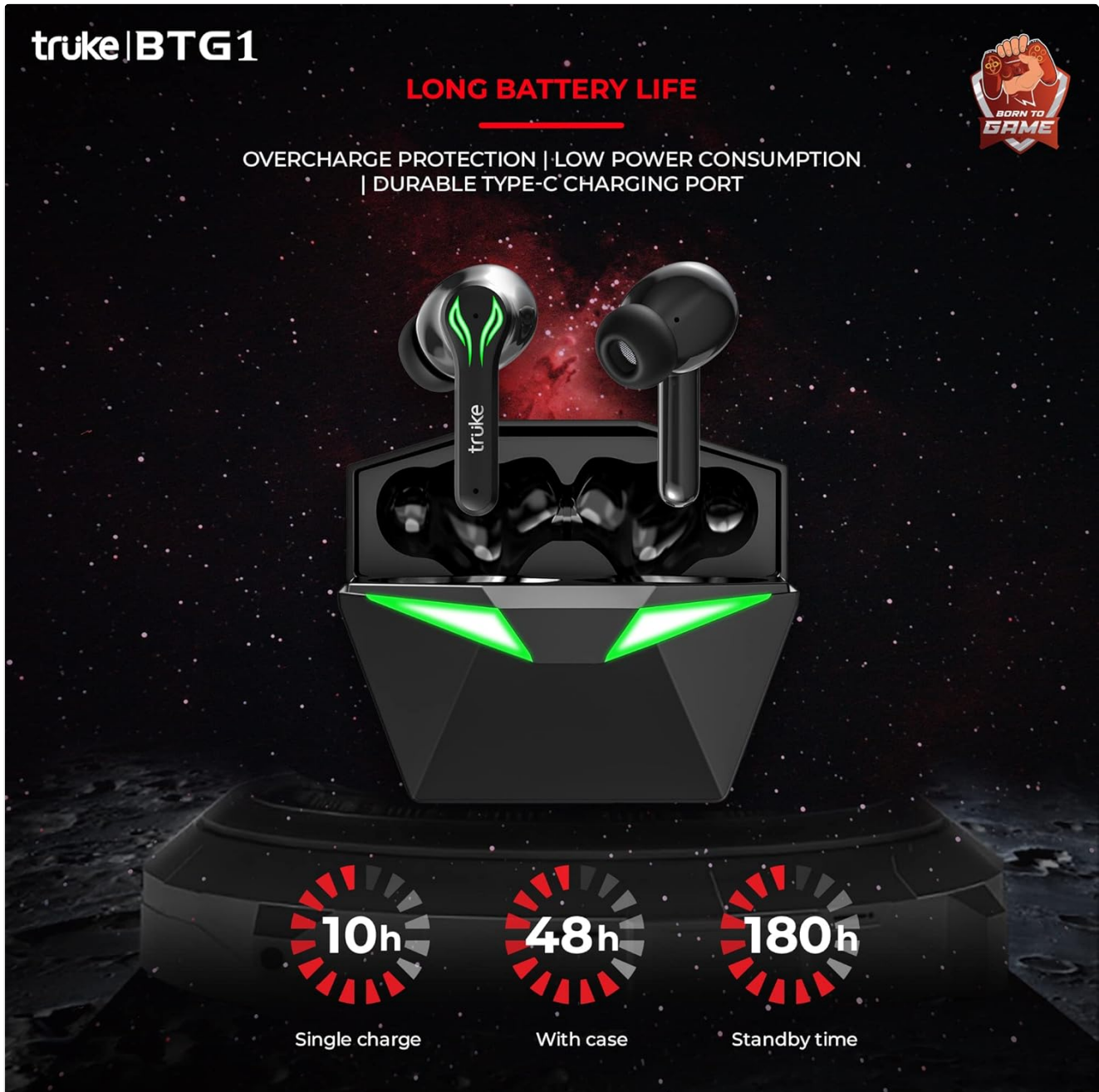
Image: Visual representation of the truke Buds BTG 1 earbuds and charging case, highlighting the battery life: 10 hours single charge, 48 hours with case, and 180 hours standby time.