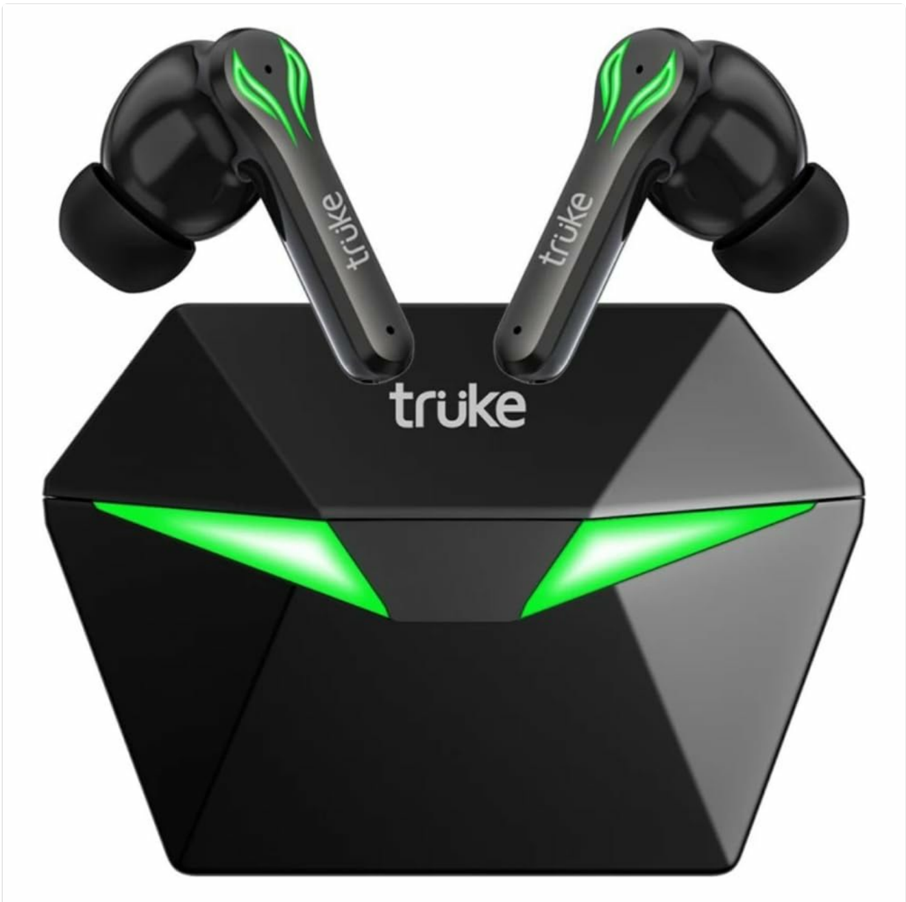
Image: trüke Buds BTG 1 True Gaming Earbuds in their charging case, showcasing their black design with green LED accents.