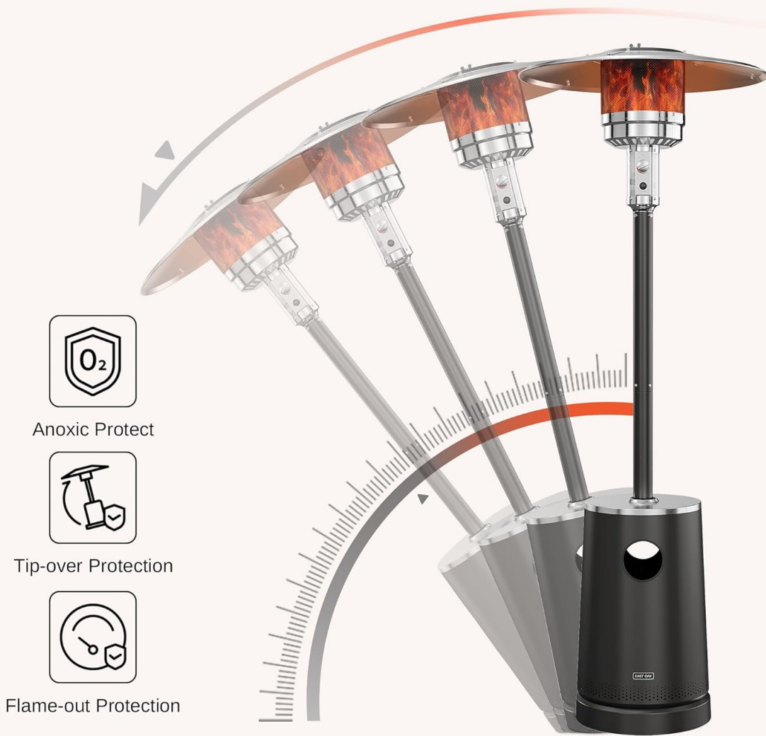
Figure 4: Triple Protection System Features