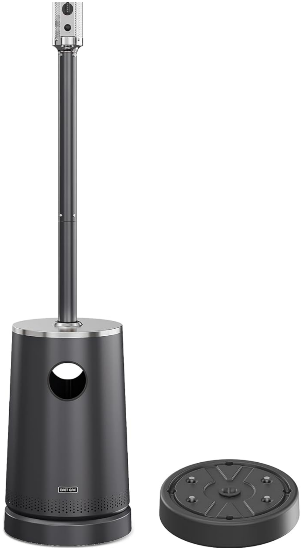
Figure 1: EAST OAK 50,000 BTU Patio Heater (Model UR50BK2)