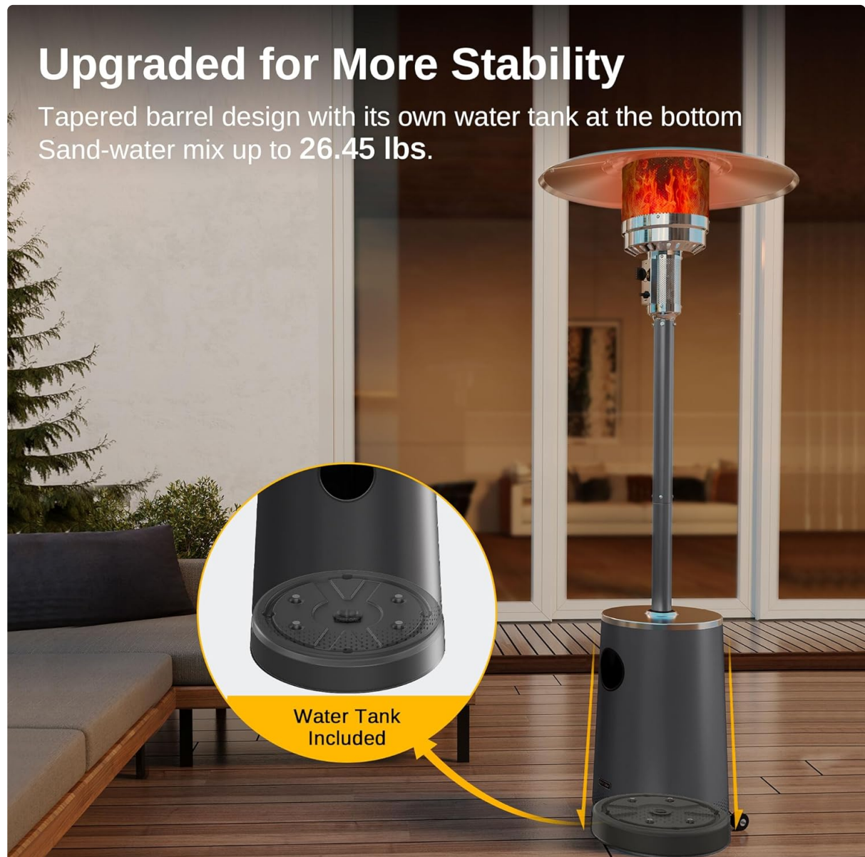
Figure 3: Upgraded Base Design for Enhanced Stability

The conical barrel design and included water tank (up to 26.45 lbs) enhance the product's wind-resistant performance. For additional stability, especially on cement or wood ground unsuitable for nails, expansion screws (not included) can be used to secure the unit to the ground.