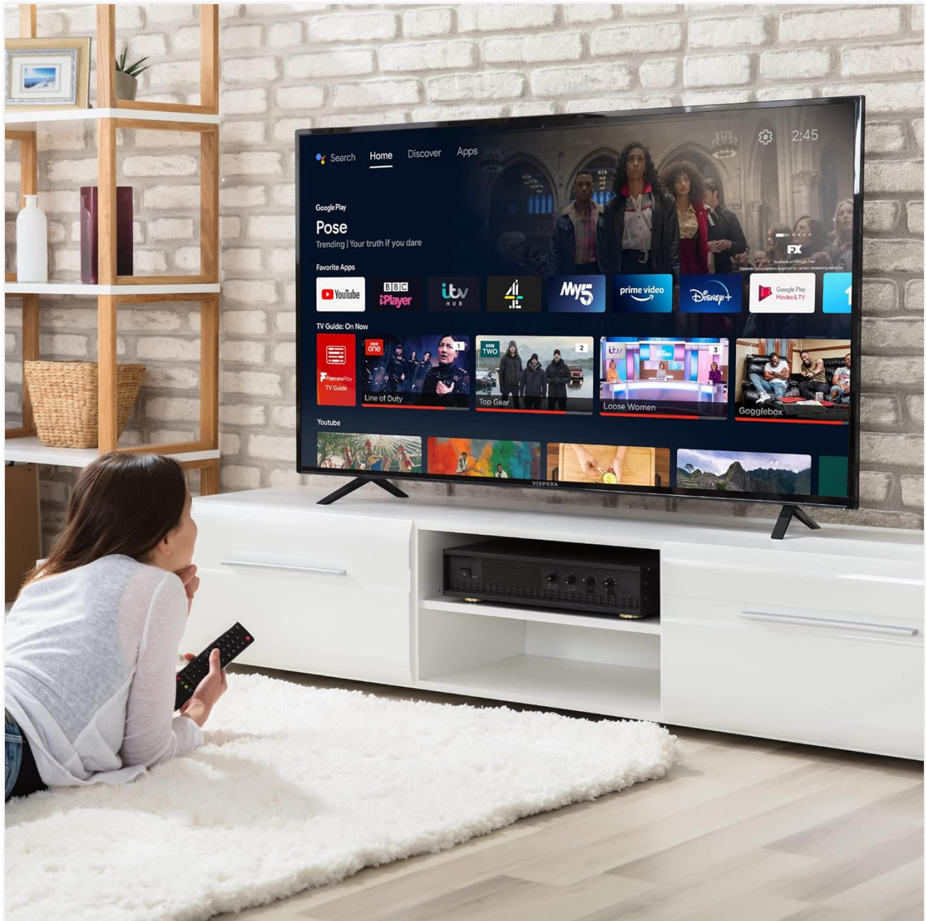
Figure 4: The Google Android TV interface on the Vispera Ai43T1, showing various streaming applications.

Your Vispera Ai43T1 TV runs on Google Android TV, providing access to a wide range of entertainment and smart features.