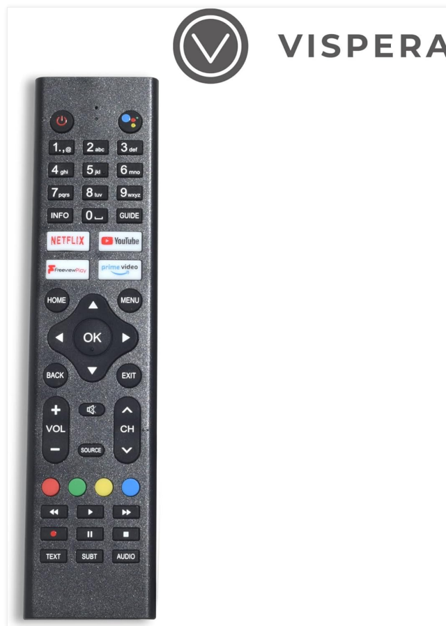
Figure 3: Vispera Ai43T1 Remote Control.

The included remote control allows you to navigate your TV's features. Ensure batteries are correctly inserted.