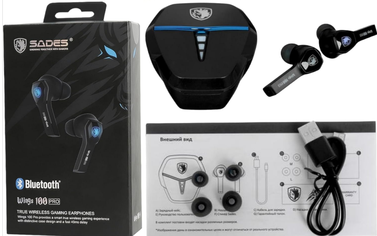
Image 2.1: Package contents including the SADES Wings 100 Pro earbuds, charging case, USB-C cable, and various ear tip sizes. The image also highlights the immersive 3D sound experience with dynamic bass and crystal-clear highs.

VC OUVIRÁ TODOS OS DETALHES, DE FORMA CLARA. OS EFEITOS DE TIROS E PASSOS SÃO AMPLIADOS TRAZENDO MUITO MAIS PRECISÃO. VC TERÁ UMA EXPERIÊNCIA SONORA 3D IMERSIVA, COM GRAVES DINÂMICOS E AGUDOS CRISTALINOS!