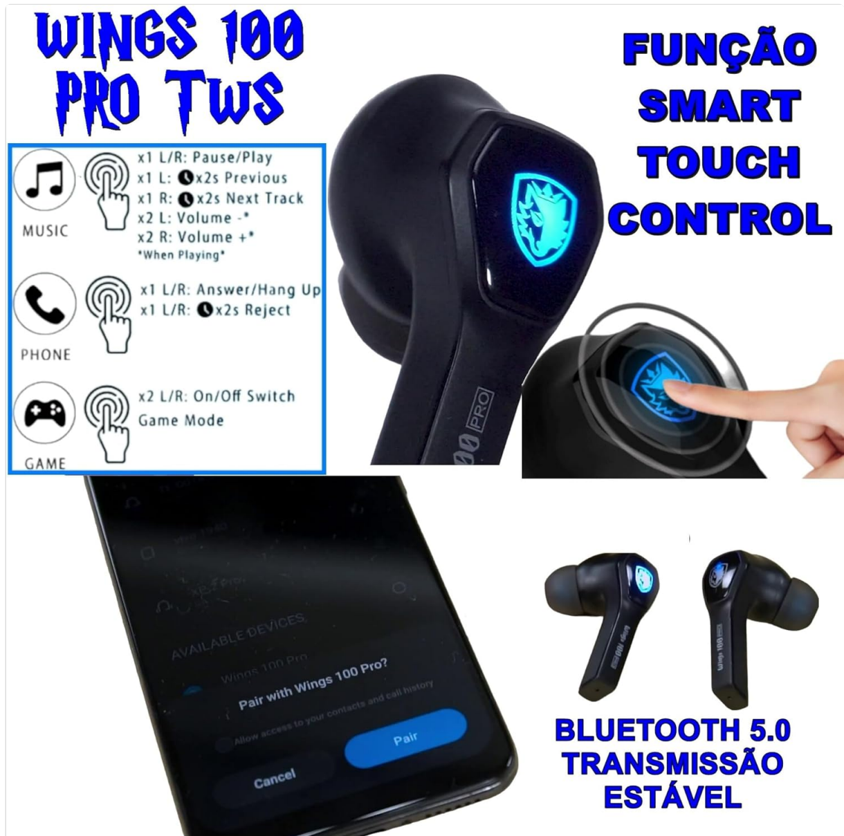
Image 4.1: Diagram illustrating the smart touch control functions for music, phone calls, and game mode on the SADES Wings 100 Pro earbuds.