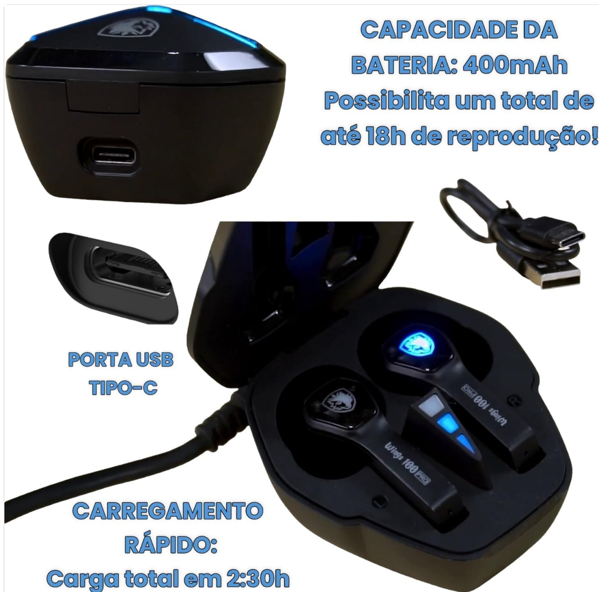
Image 3.1: The charging case with earbuds inside, highlighting the USB Type-C charging port. The image indicates a 400mAh battery capacity for the case and fast charging capabilities.

The charging case features futuristic blue LED indicators that show the battery level. Observe the flash intervals to determine the charging status of both the earbuds and the case.