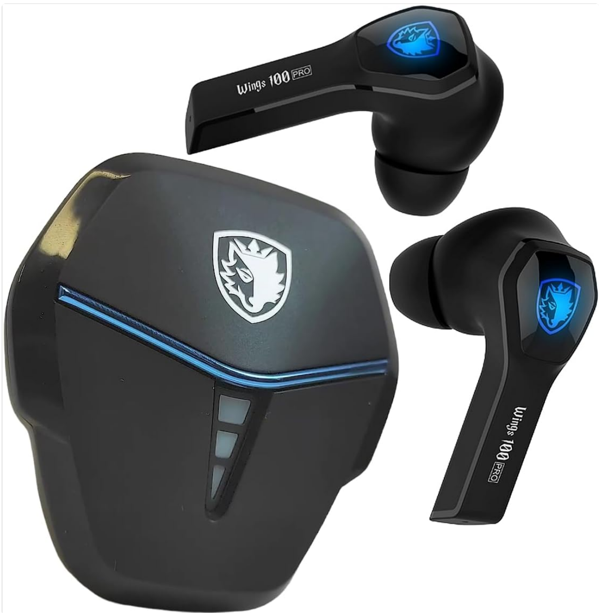
Image 1.1: SADES Wings 100 Pro Wireless Gaming Earbuds and Charging Case. The image displays the black earbuds with blue LED accents and their matching black charging case, also featuring blue LED lighting.