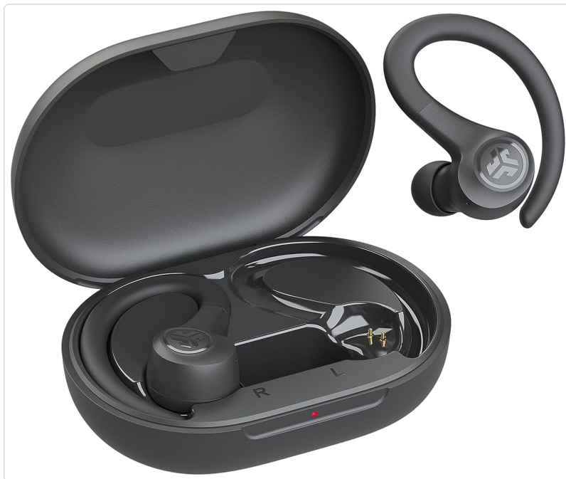
Image: The JLab Go Air Sport earbuds, with one earbud positioned outside the open charging case, illustrating their design and how they fit into the case.

For optimal sound and comfort, select the correct size of gel tips. The ergonomic earhook design ensures the earbuds stay securely in place during physical activity. Experiment with the included small, medium, and large gel tips to find the best fit for your ears.