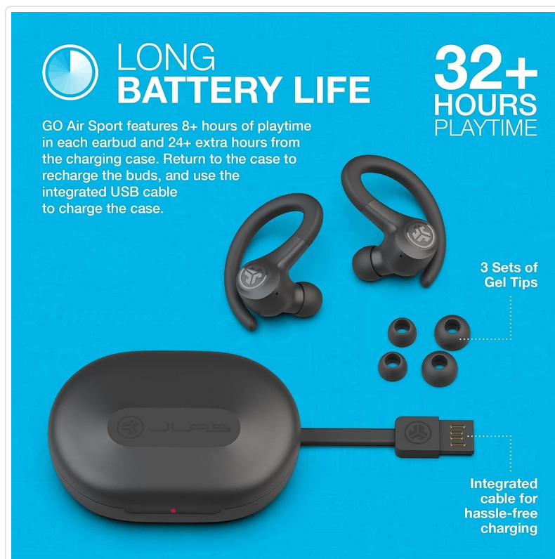
Image: Contents of the JLab Go Air Sport package, including the earbuds, charging case with integrated USB cable, and three different sizes of