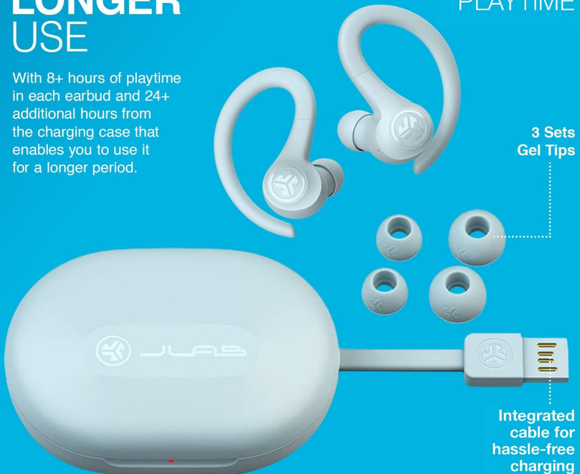
Image: JLab Go Air Sport Earbuds, their charging case with an integrated USB cable, and three sets of gel tips in different sizes.