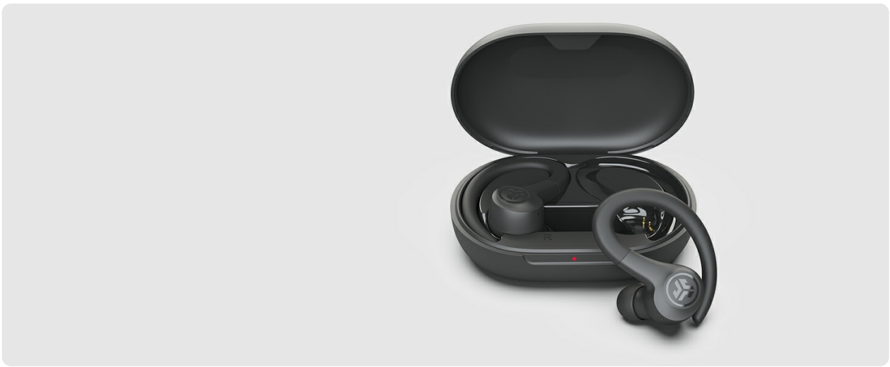
Image: The JLab Go Air Sport charging case with its integrated USB charging cable extended, alongside the two earbuds and additional ear tips.