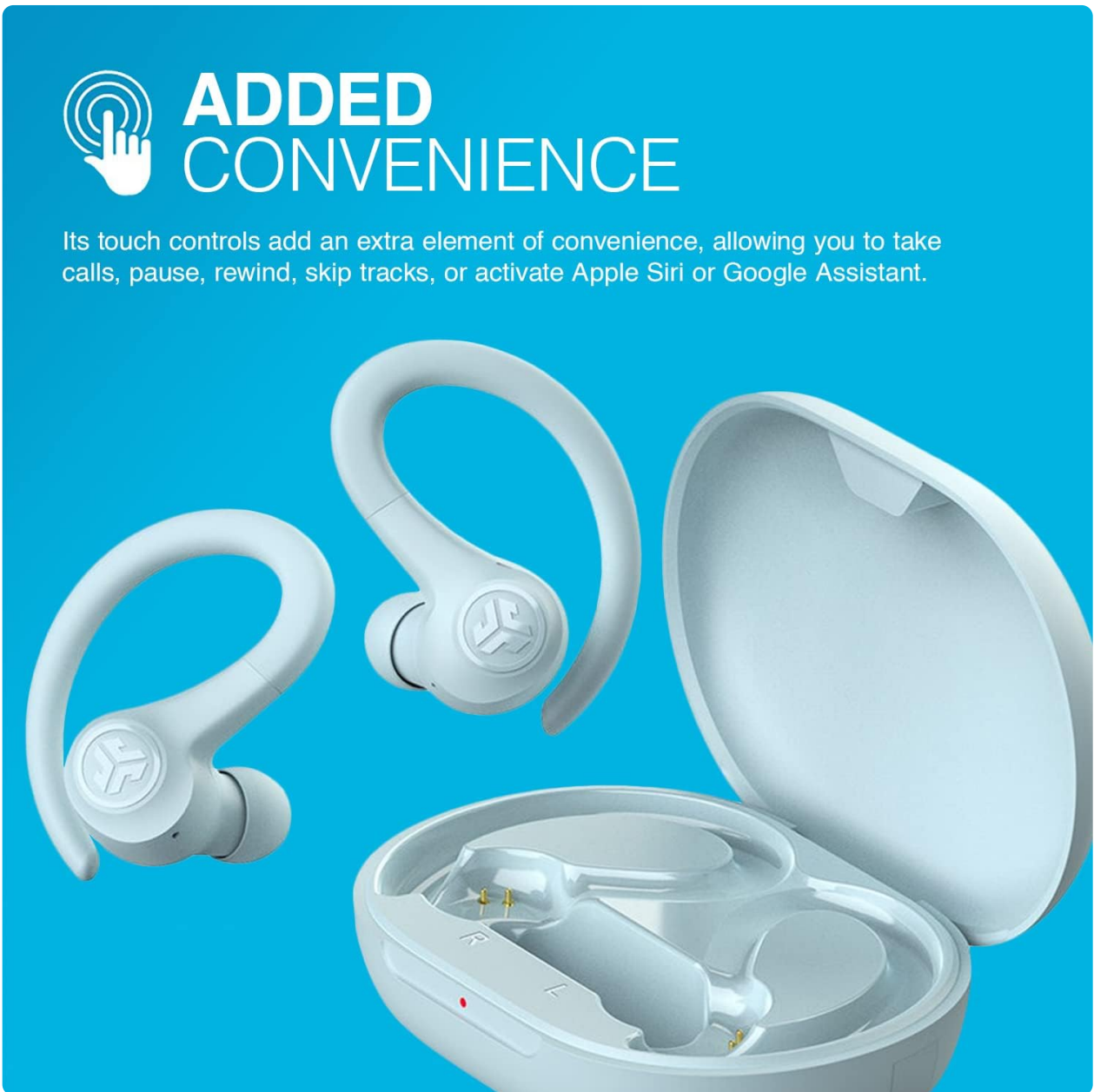
Image: The JLab Go Air Sport earbuds and their open charging case, illustrating the touch control functionality for convenience.

Its touch controls add an extra element of convenience, allowing you to take calls, pause, rewind, skip tracks, or activate Apple Siri or Google Assistant.