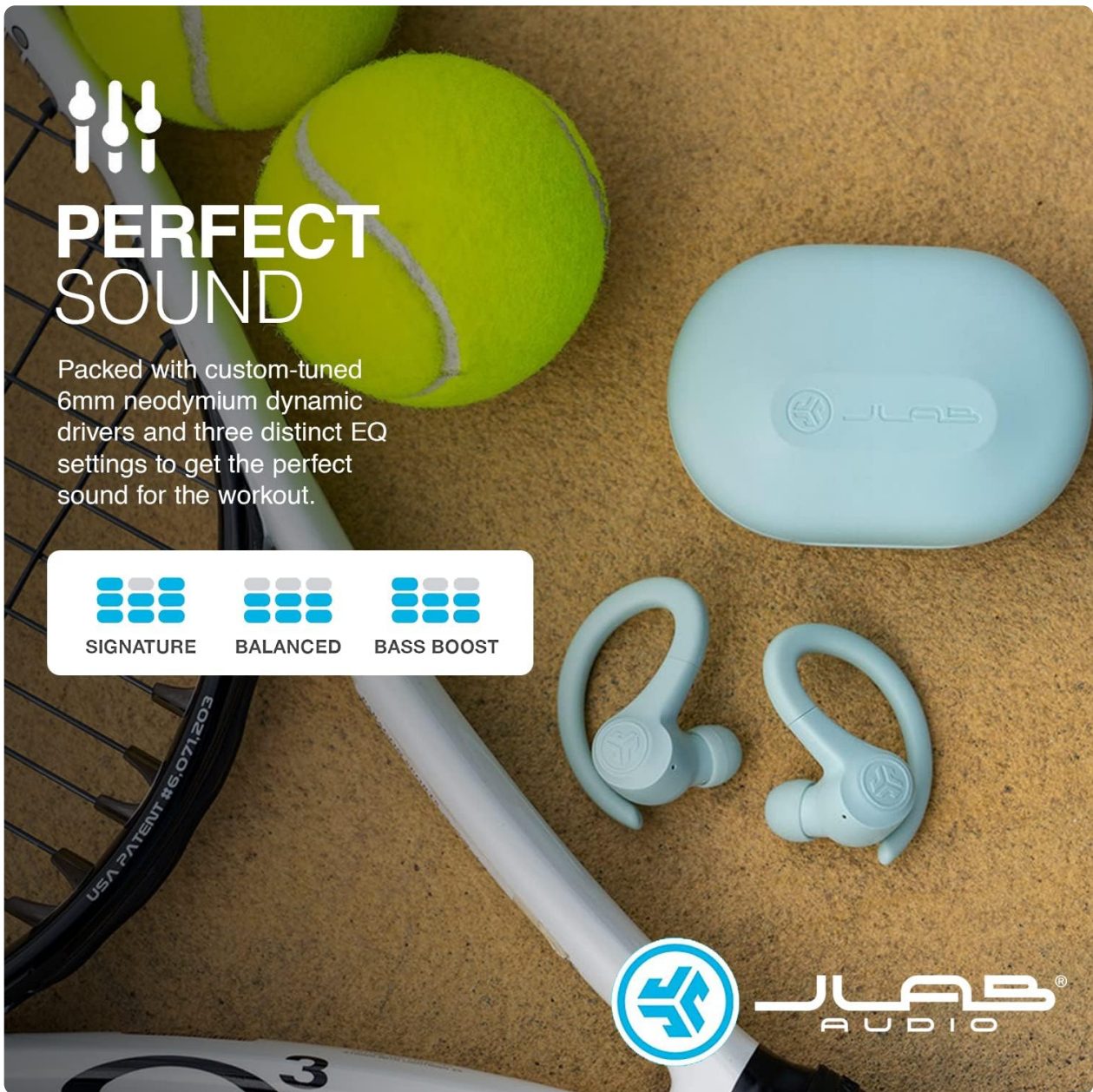
Image: JLab Go Air Sport earbuds and charging case on a tennis court, with icons illustrating the three EQ sound settings: Signature, Balanced, and Bass Boost.