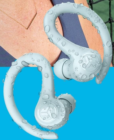
Image: A woman smiling while wearing the JLab Go Air Sport earbuds, demonstrating their secure fit during physical activity. The image also highlights the sweatproof feature.

IP55 sweat and water resistance hold up against sweat and dirt.