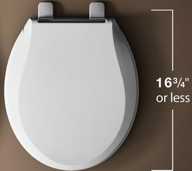
Elongated Toilet Seat