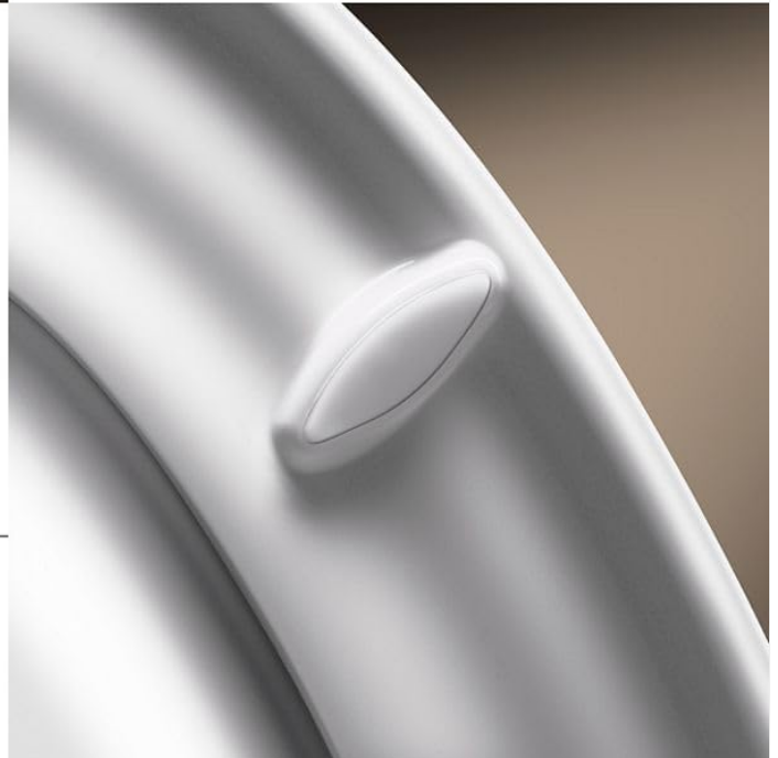
Image: Quiet-Close technology ensures that both the lid and seat close gently and silently, preventing any slamming.