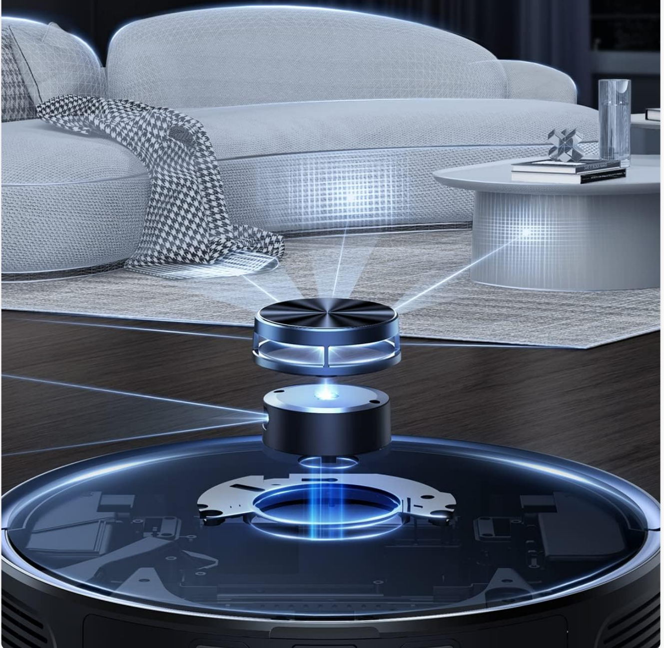
Figure 5.3: LiDAR Navigation System

SLAM Technology-Accurate scanning and mapping