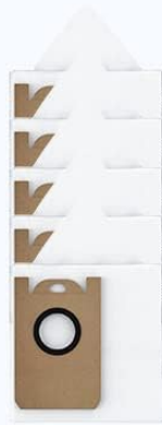
Dust Bag *5