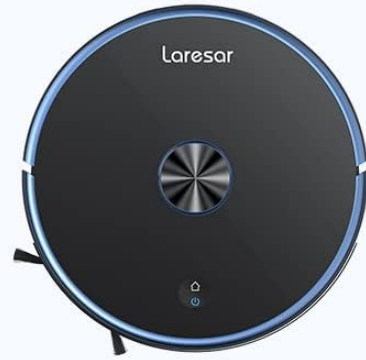
L6 Pro Robot Vacuum Cleaner *1