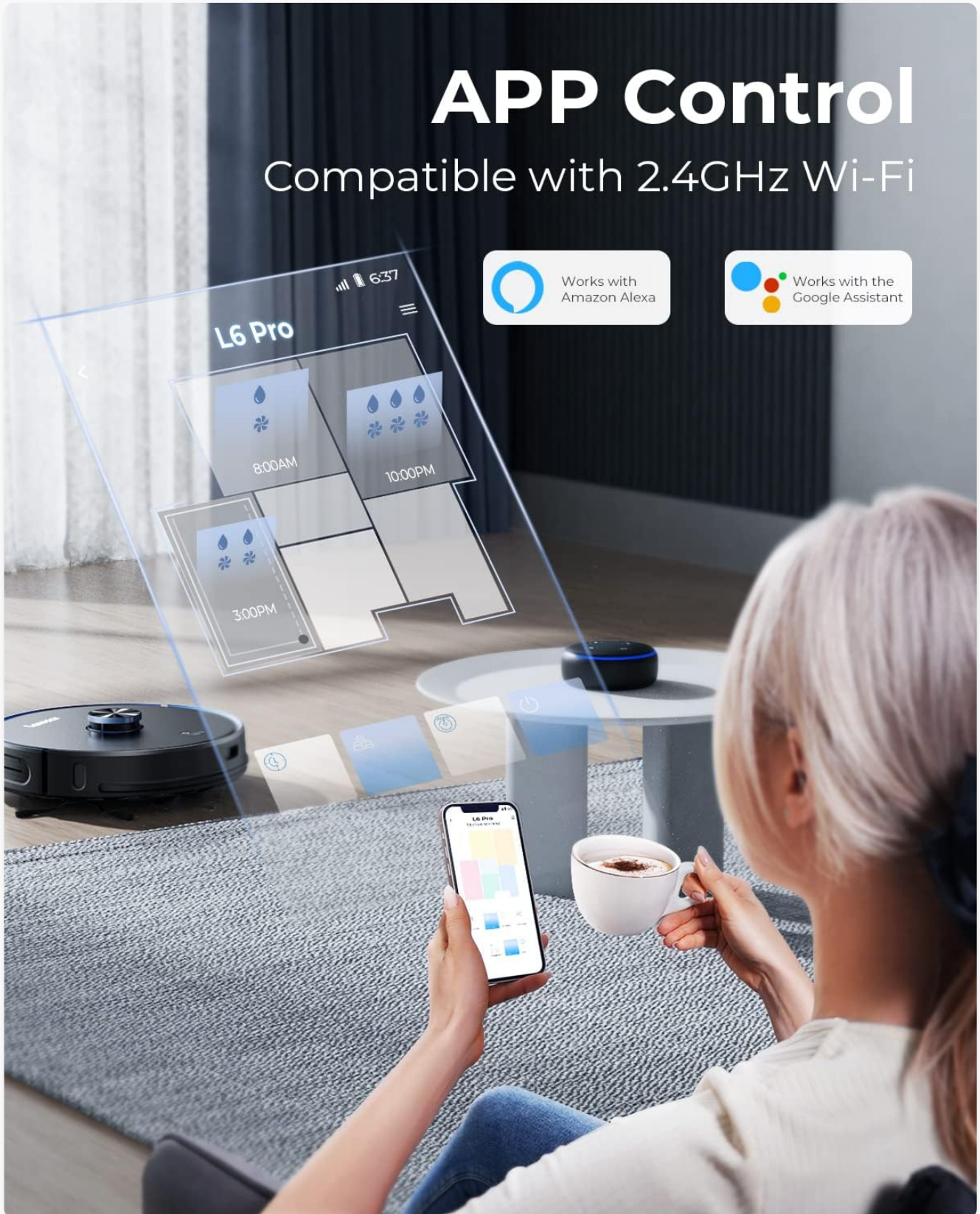
Figure 5.1: App Control Interface

3. Add Device: Follow the in-app instructions to add your L6 Pro. Ensure your phone is connected to a 2.4GHz Wi-Fi network.