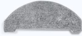
Mop Cloth *2