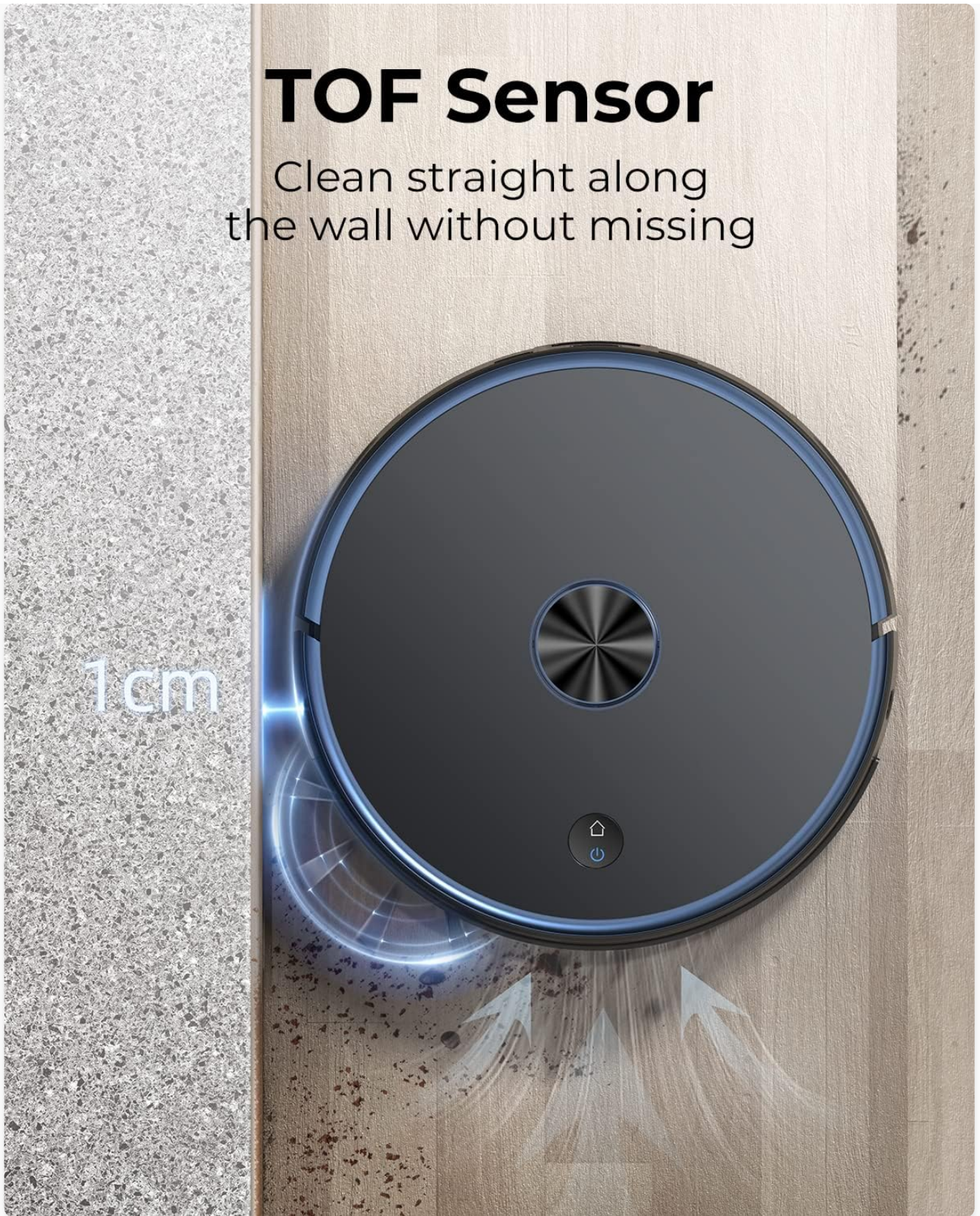
Figure 5.4: TOF Sensor for Edge Cleaning

Clean straight along the wall without missing