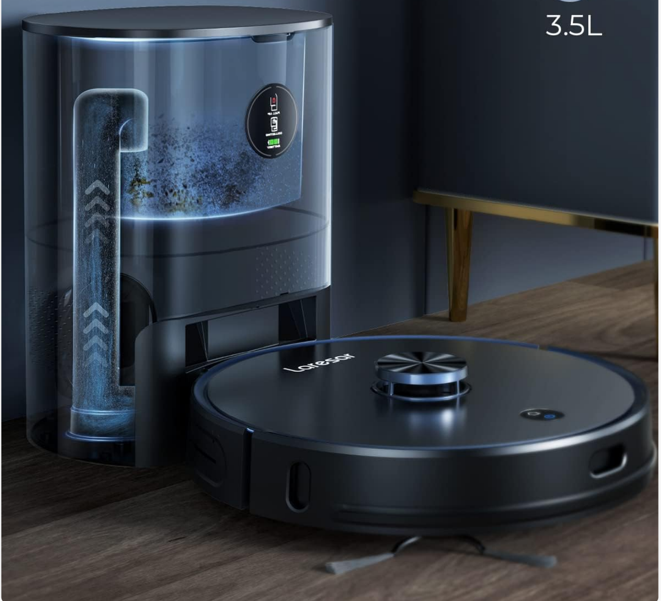
Figure 1.3: 60-Day Dust Collection Capacity