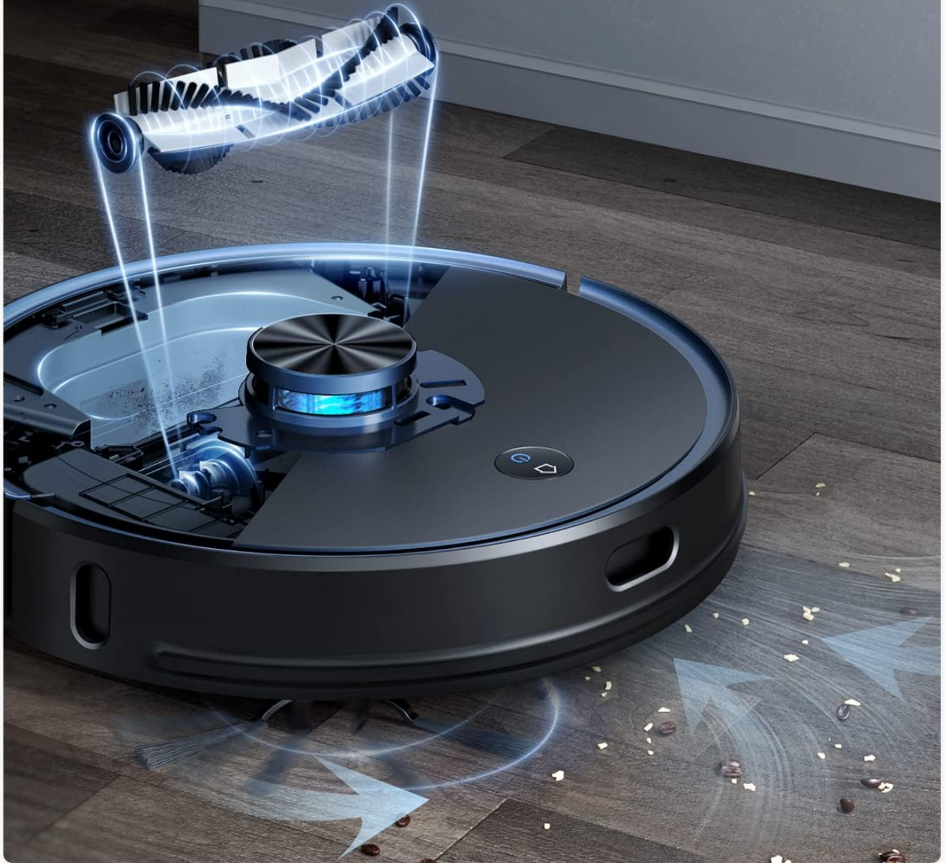
Figure 1.2: Powerful Suction Capability