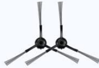
Side Brush *2