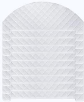
Disposable Mop Cloth *10