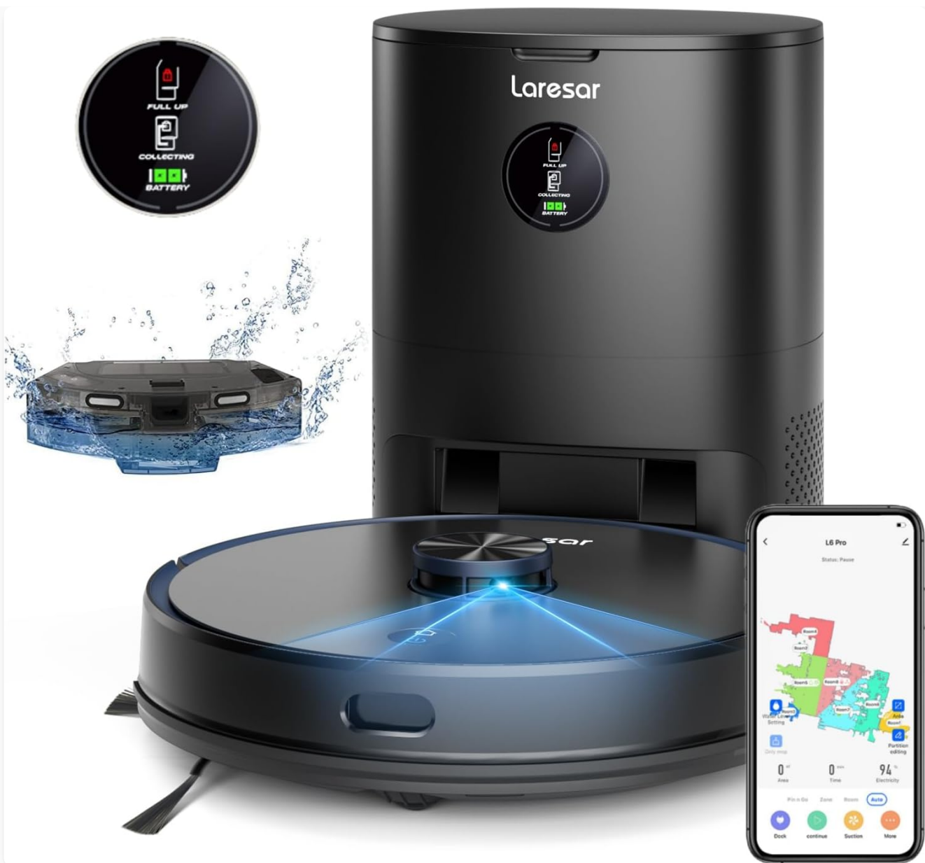
Figure 1.1: Laresar L6 Pro Robot Vacuum Cleaner and Auto-Empty Station