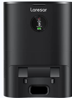
Dust Collection Charging Base *1