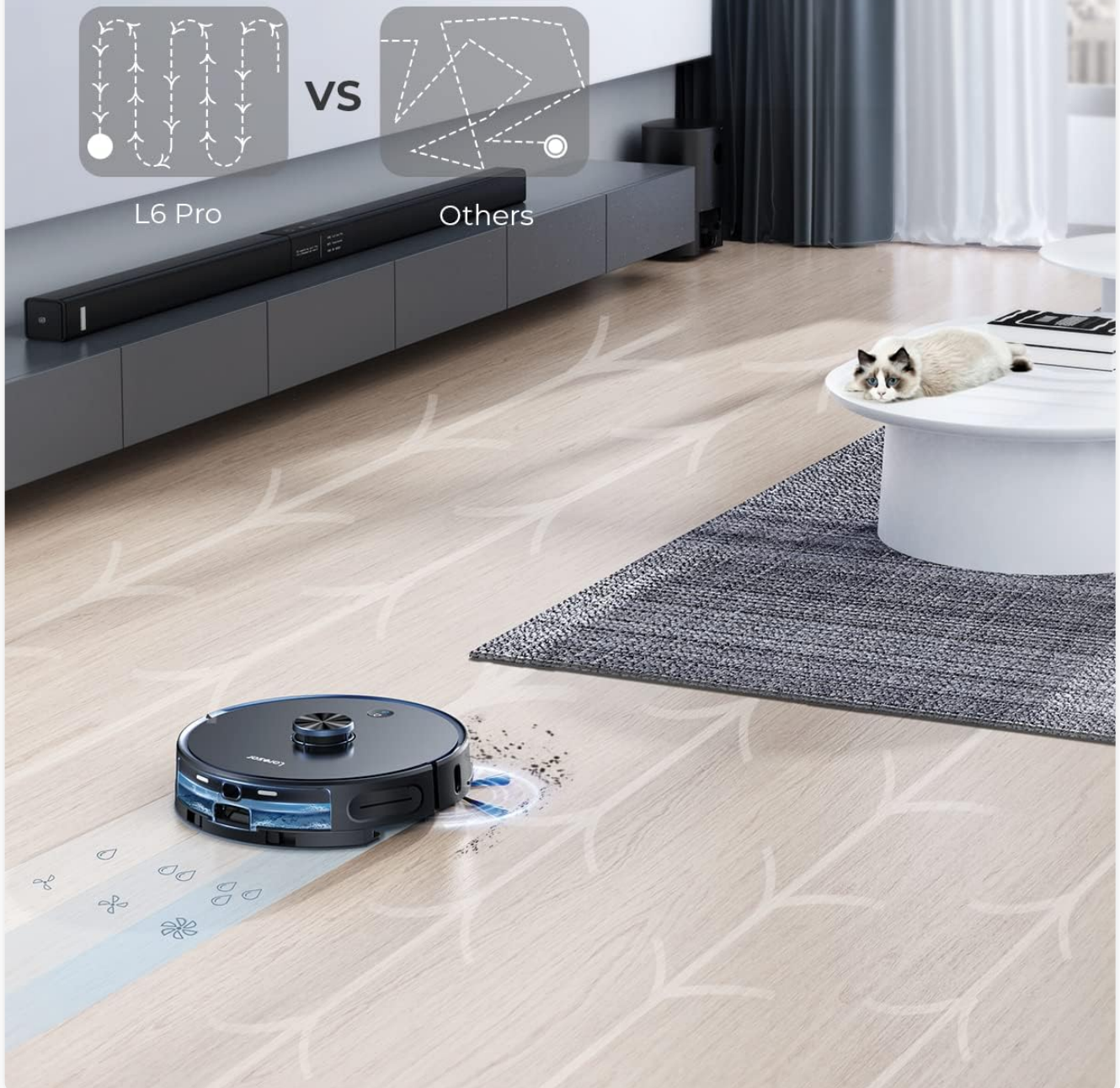
Figure 5.2: Y-shaped Mopping Pattern