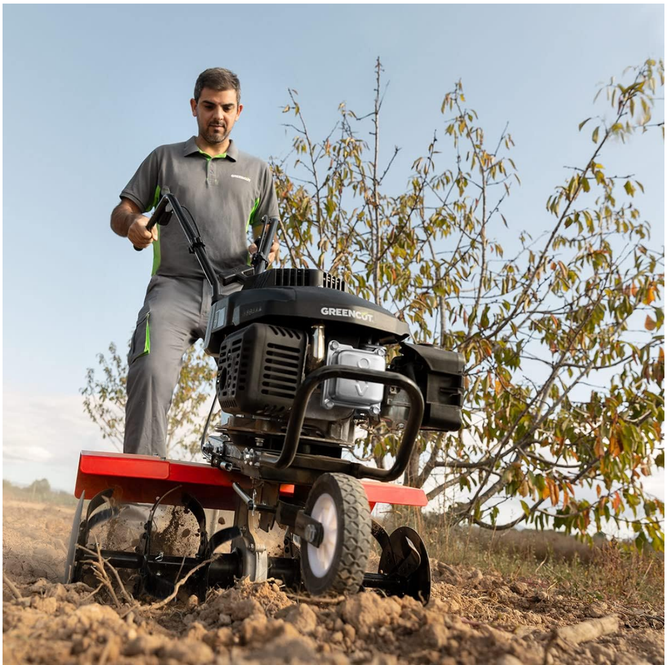
Figure 5.2: Front view of the tiller in operation, showing the tilling action.