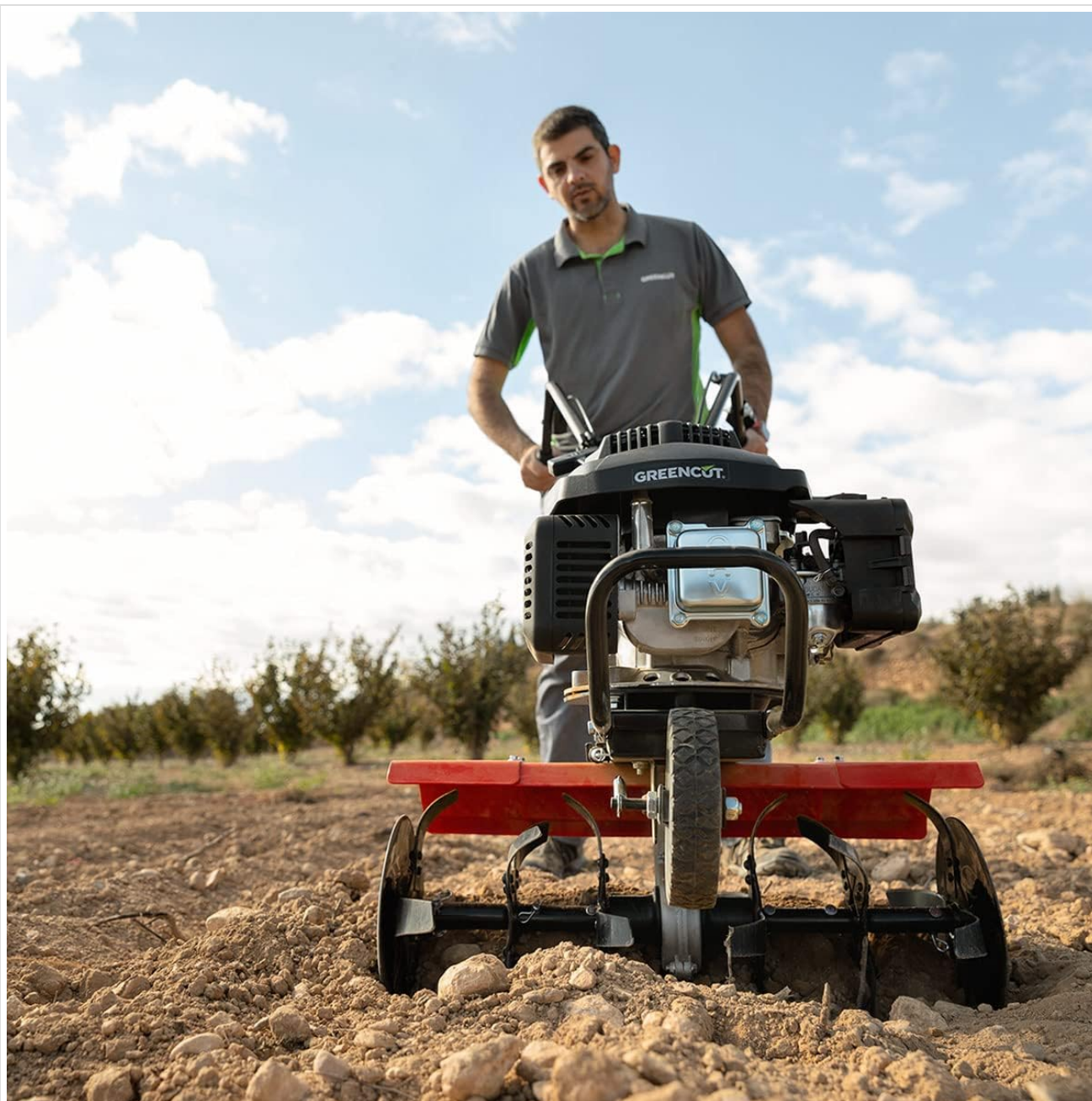
Figure 4.2: Detail of the transport wheel and tilling tines.