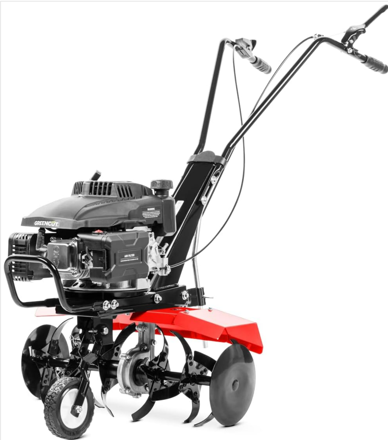
Figure 3.1: Overall view of the GREENCUT GTC190X Petrol Tiller.