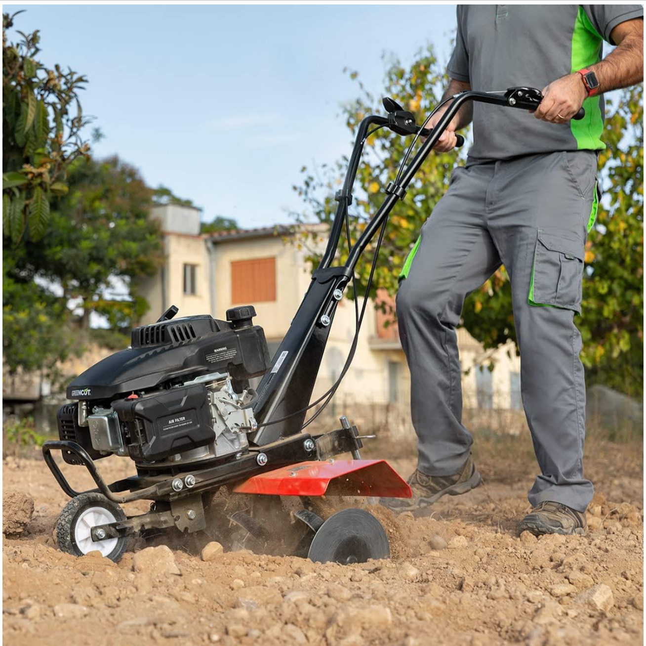
Figure 5.1: Operator using the GREENCUT GTC190X tiller to cultivate soil.

When tilling, hold the handlebars firmly with both hands. Allow the tiller to pull itself forward, guiding it gently. For deeper tilling, make multiple passes, gradually increasing the depth with each pass by adjusting the depth stake.