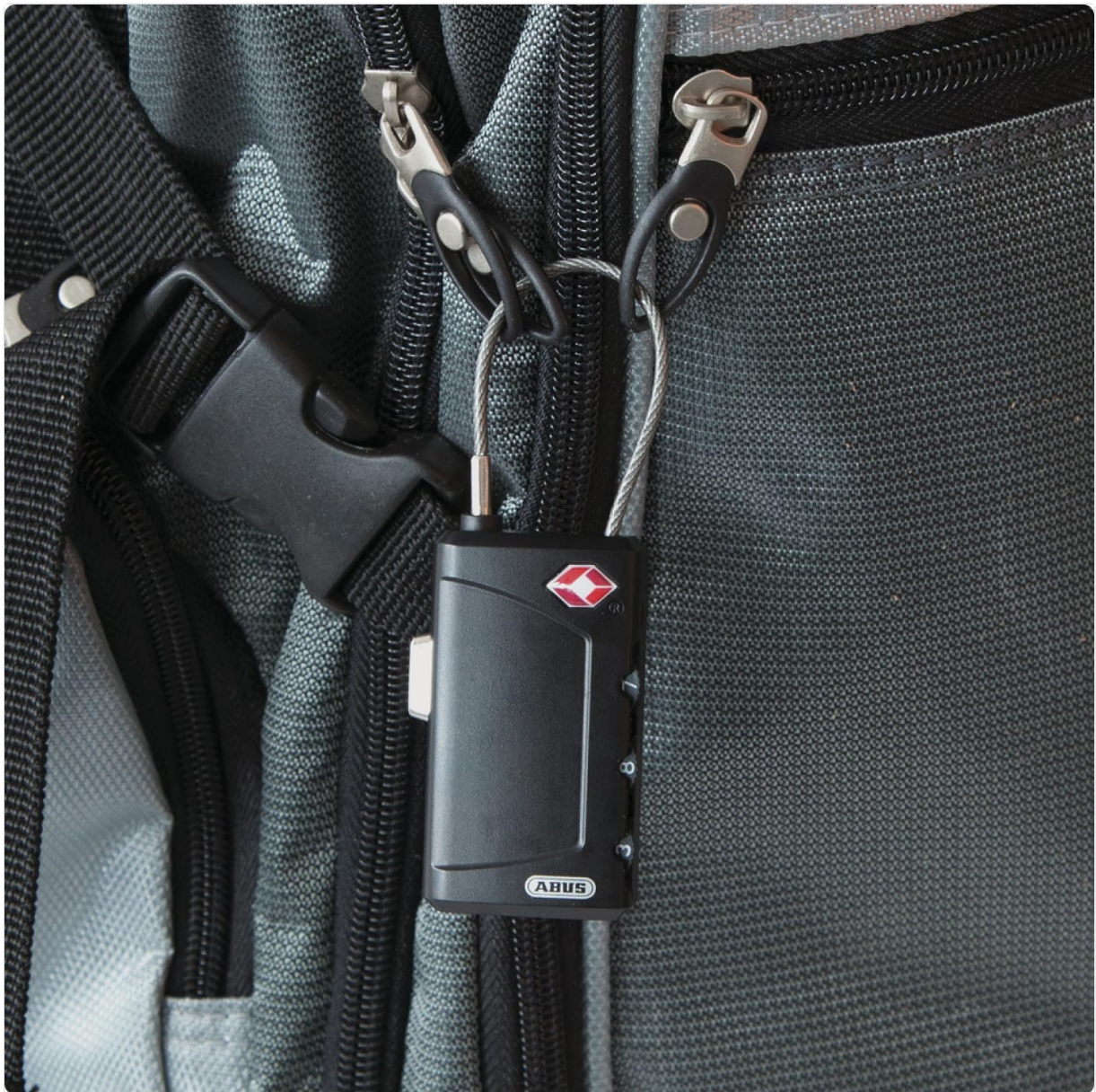
Image 3: ABUS 148TSA/30 lock securing a backpack zipper, demonstrating a typical application.