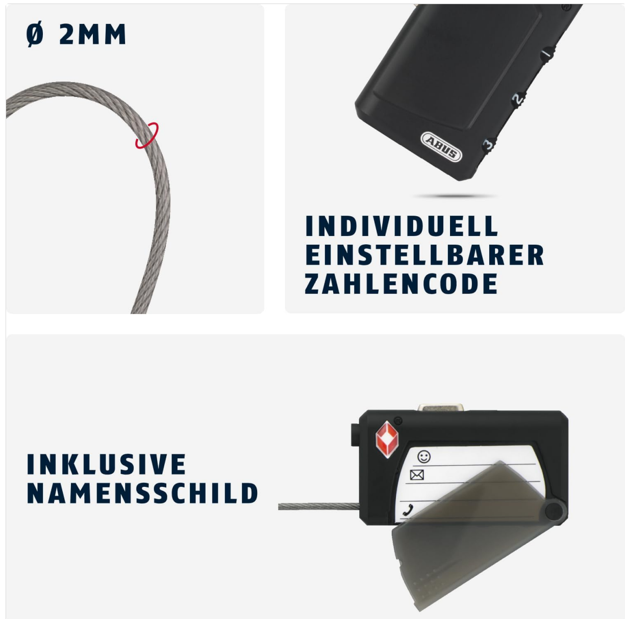
Image 2: ABUS 148TSA/30 lock showing combination dials and side release lever, used for setting the combination.