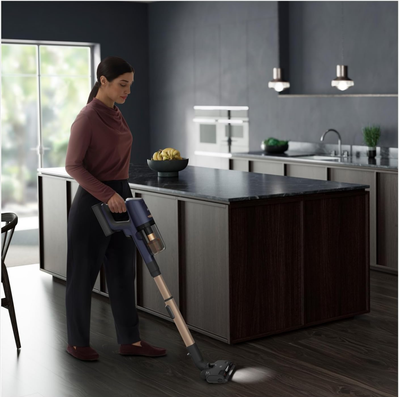
A user is shown operating the AEG Hygienic 8000 cordless vacuum cleaner on a hard floor in a kitchen setting, demonstrating its ease of use for general cleaning.