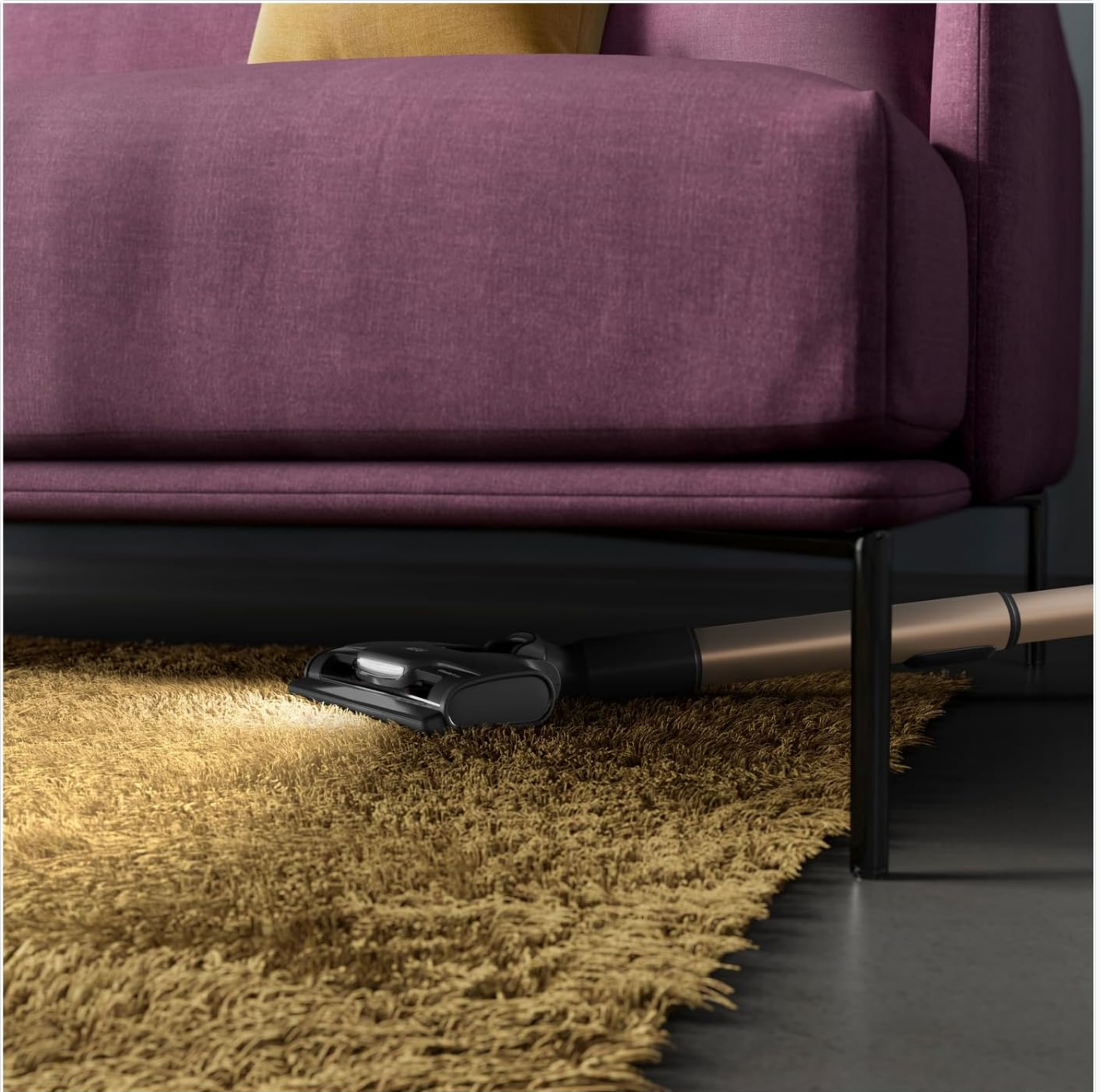
The vacuum cleaner's low-profile head is depicted cleaning underneath a sofa, highlighting its ability to reach difficult areas.