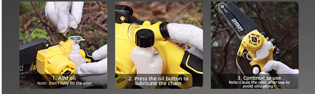
Image: Steps for adding oil to the auto-lubrication system.