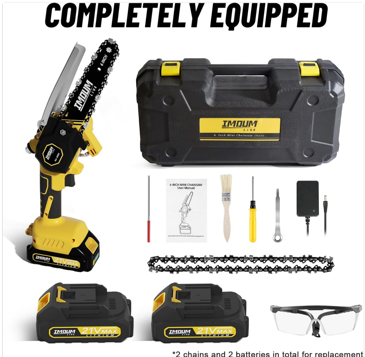
Image: Complete package contents of the IMOUM LIVE 6-inch Mini Chainsaw.