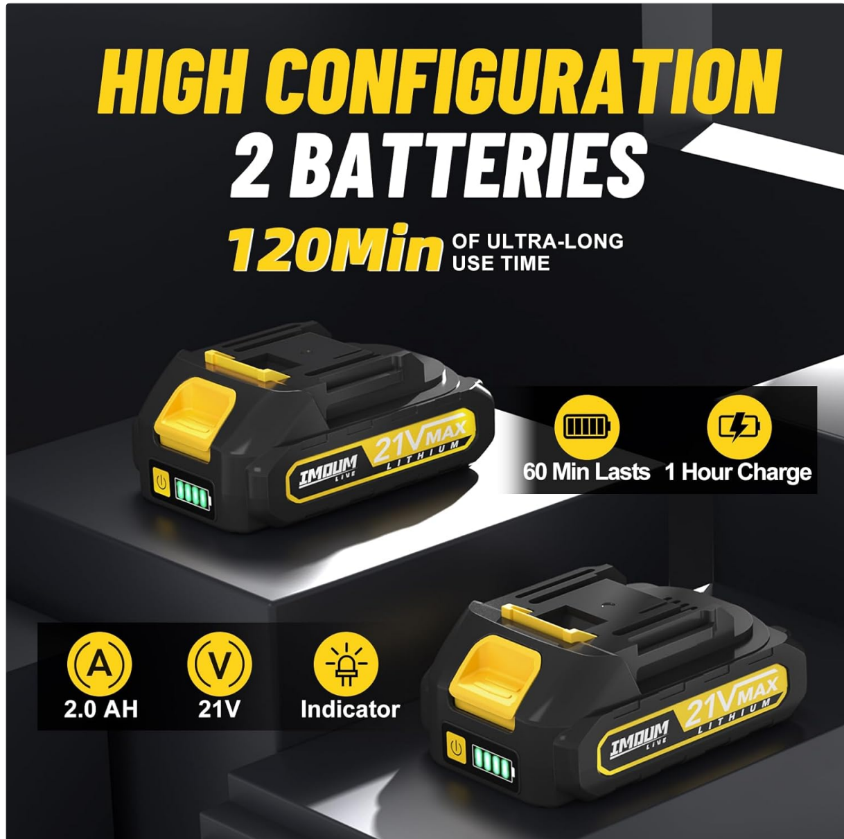
Image: Two 21V Lithium batteries with charge level indicators.

Before first use, fully charge both 21V lithium batteries. Connect the charger to a power outlet and insert the battery. The indicator lights on the battery will show the charging status. A full charge typically takes 60-75 minutes.