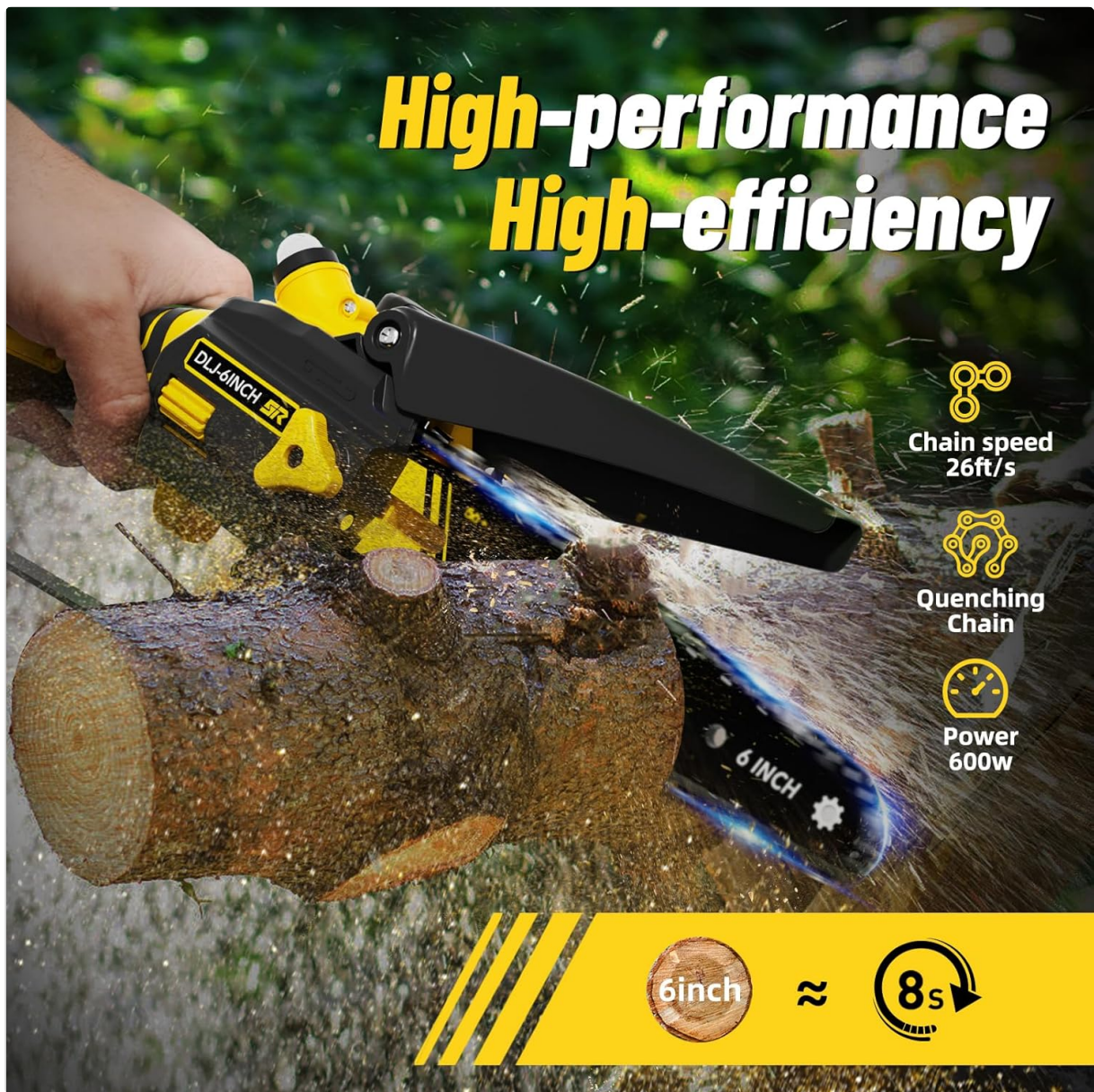
Image: The mini chainsaw in action, cutting through a log.