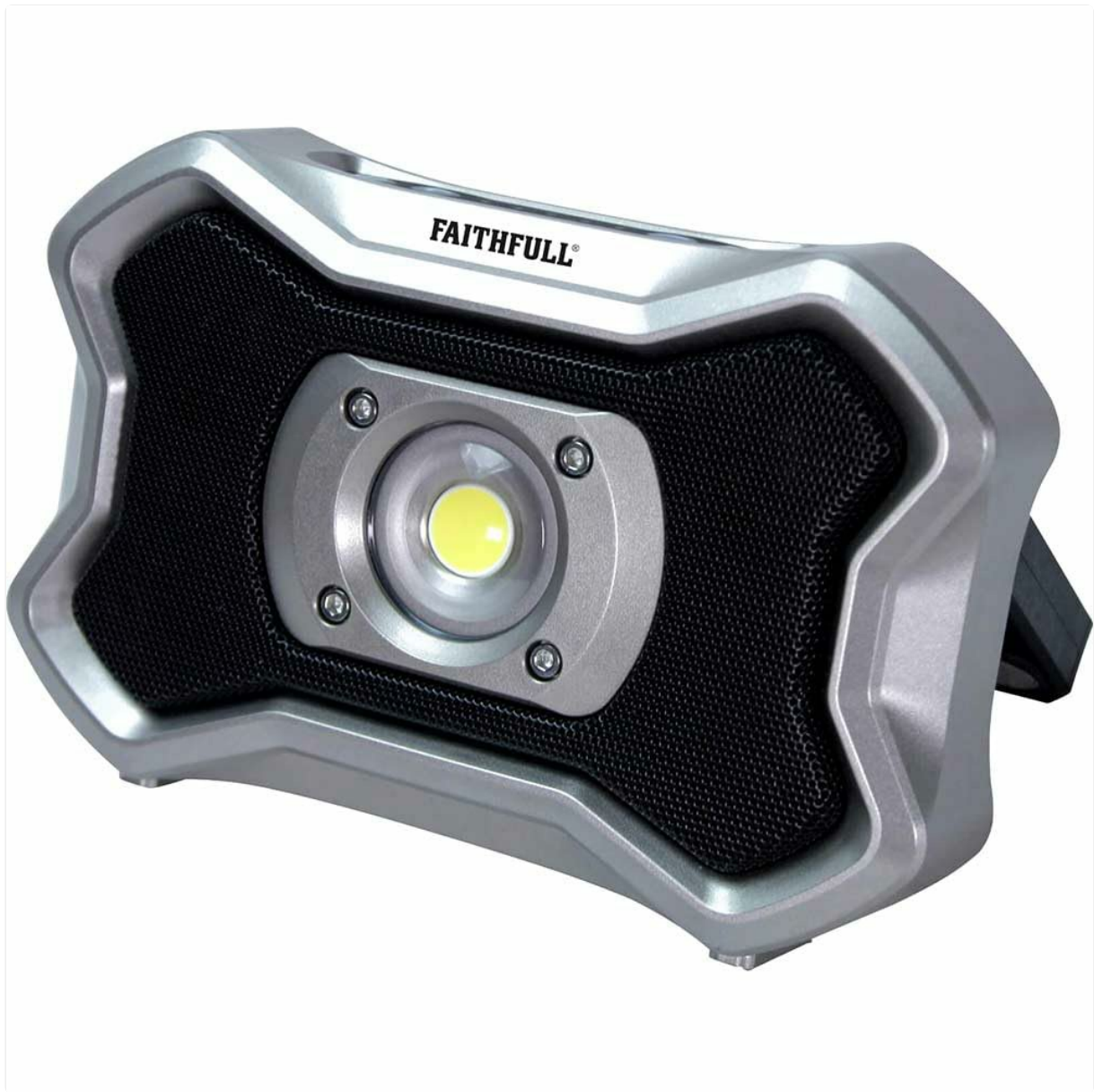
Figure 1: Front view of the Faithfull FPPSLFF20BS LED Work Light. This image shows the central LED light surrounded by a protective grille, with the 'FAITHFULL' brand name visible at the top.