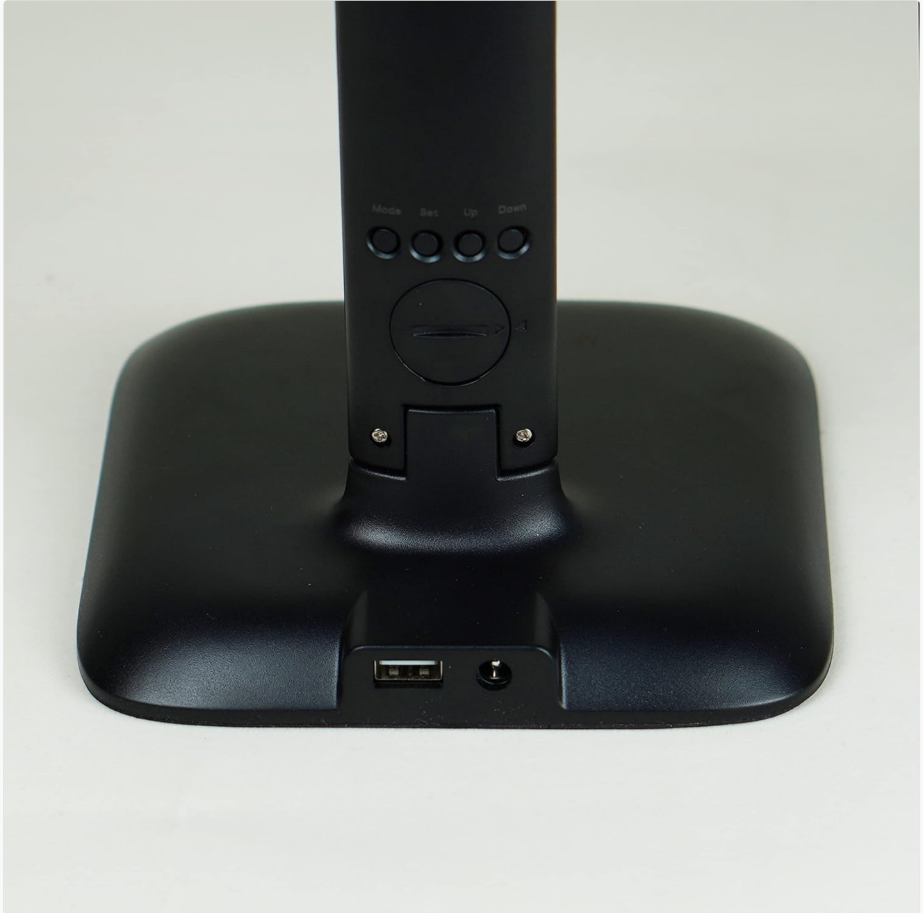
Figure 2: Power Input and USB Port on Lamp Base