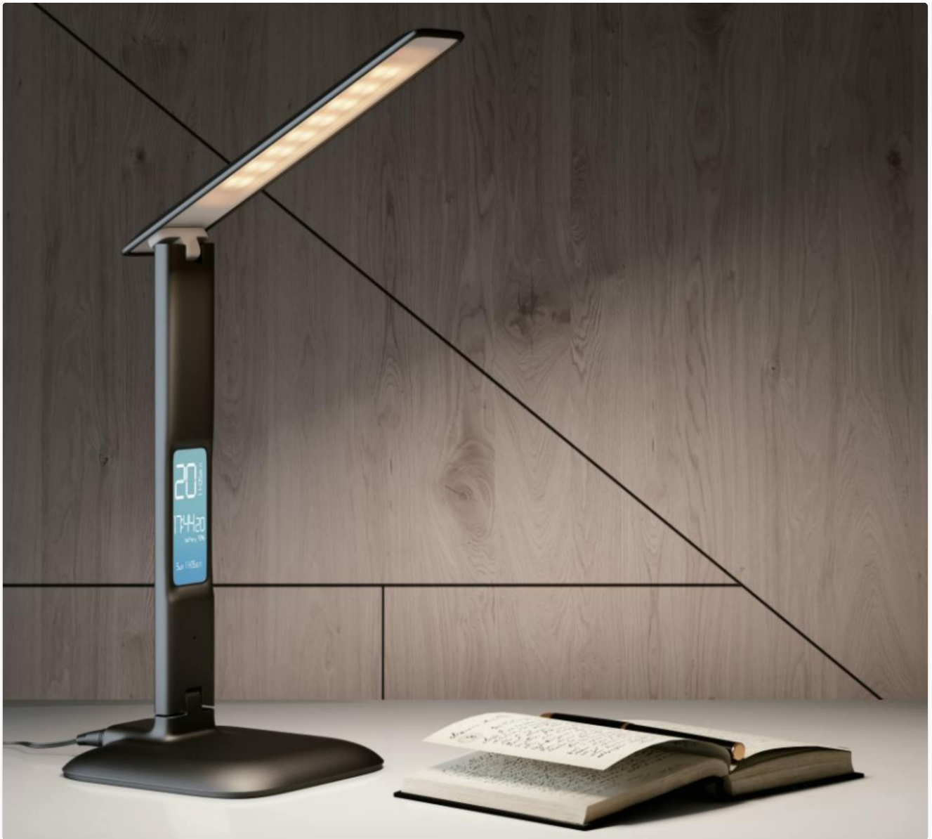
Figure 1: INSPIRE ALEX Desk Lamp Overview