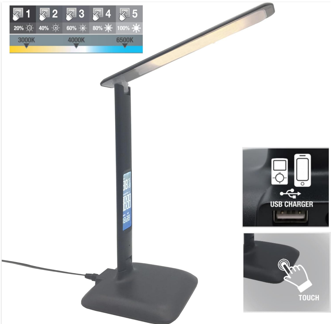
Figure 3: Lamp Features Overview