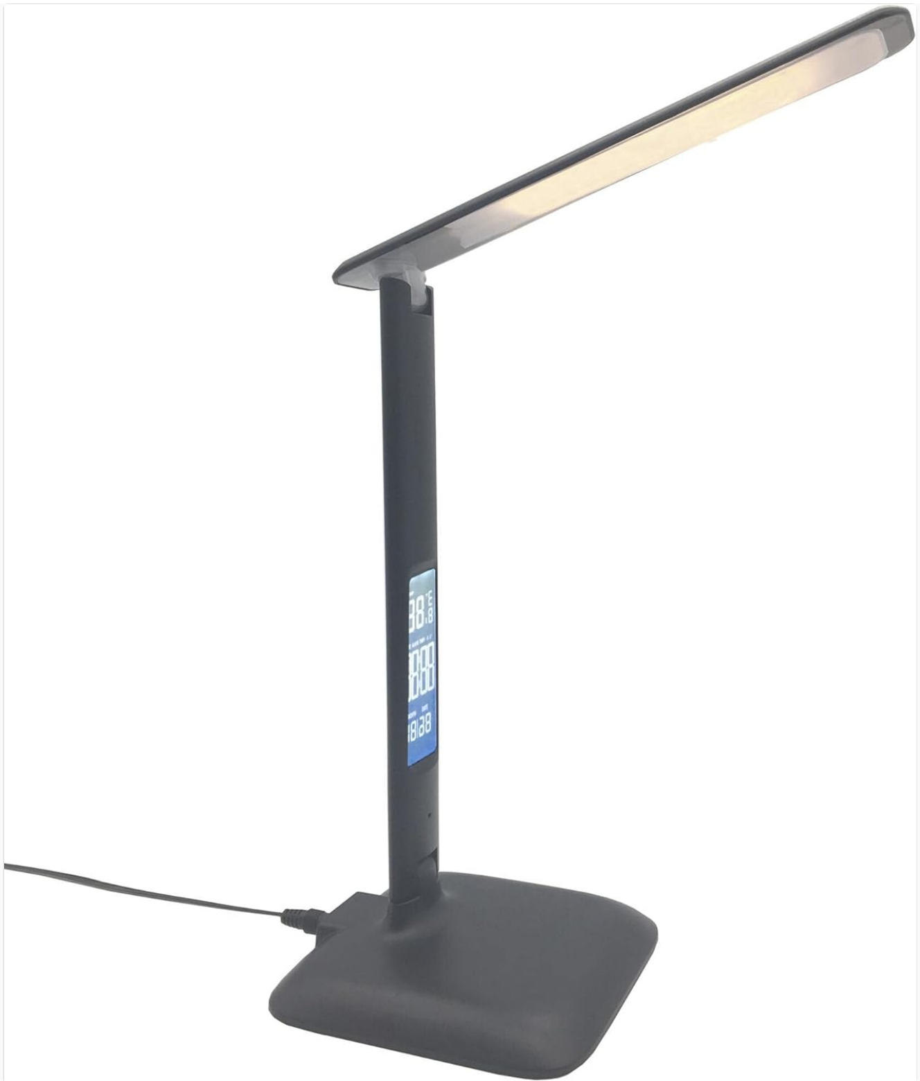
Figure 4: Digital Display