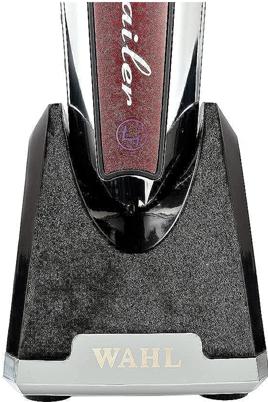
Image 1: Wahl Professional 8171 Cordless Detailer Li Hair Clipper.