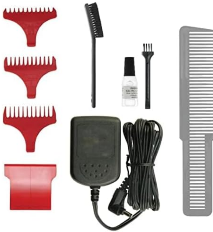
Image 2: Included accessories for the Wahl Professional 8171 Cordless Detailer Li.