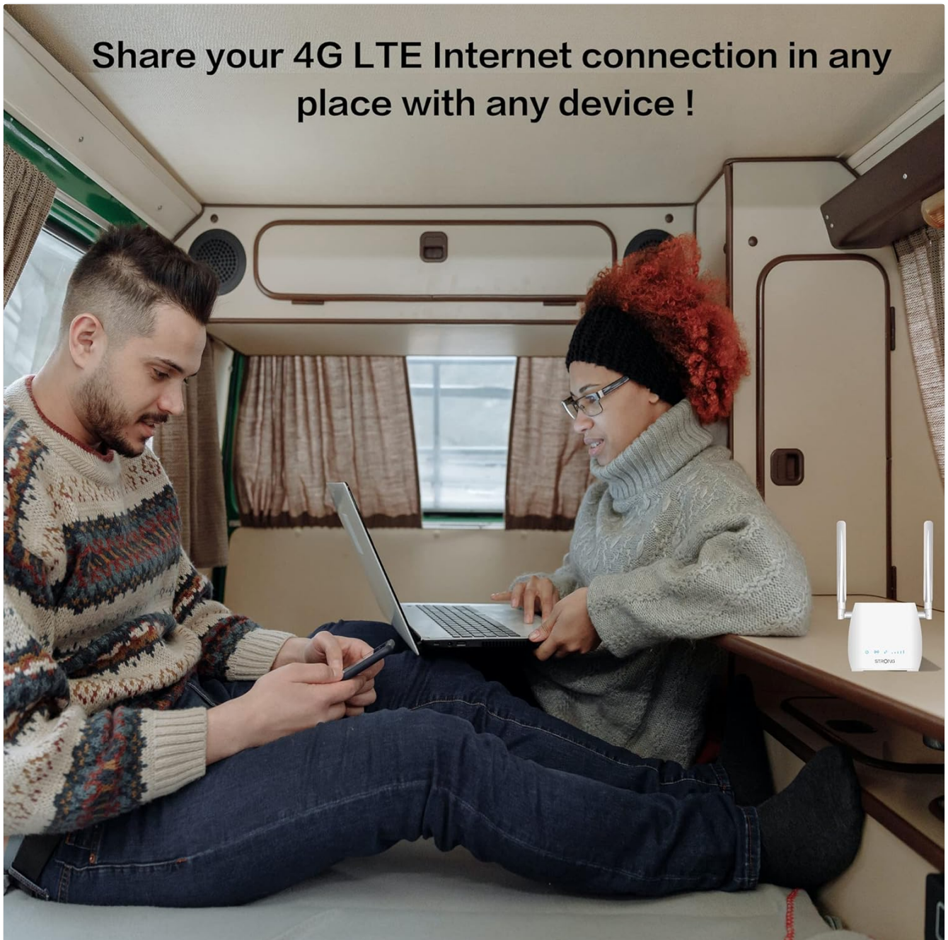
Image: Two individuals utilizing the router to share their 4G LTE internet connection with a laptop and smartphone in a mobile setting, such as a camper van.