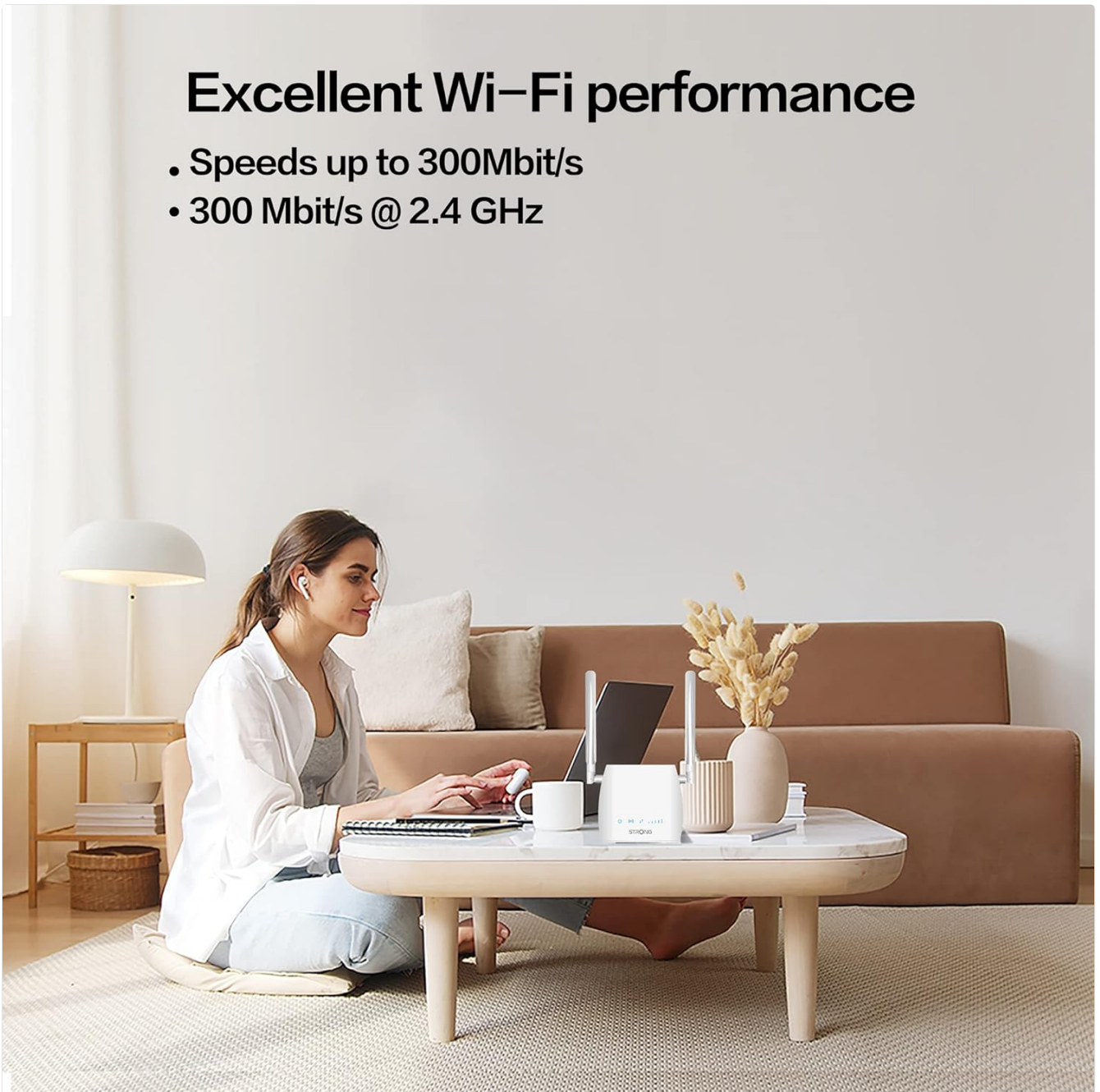
Image: A user working on a laptop, demonstrating the router's excellent Wi-Fi performance with speeds up to 300 Mbit/s at 2.4 GHz.