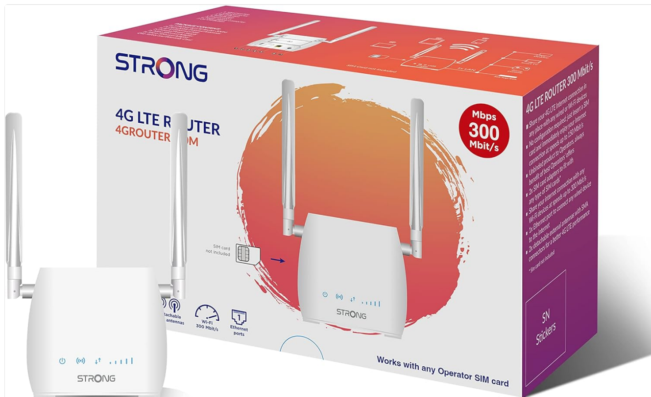
Image: The STRONG 4G LTE Mini Wi-Fi Router 300M shown alongside its product packaging, highlighting its compact design and key features.

The STRONG 4G LTE Mini Wi-Fi Router 300M is designed to provide fast and reliable internet connectivity using a 4G LTE SIM card from any provider. It functions as a mobile router, creating a Wi-Fi hotspot and offering an Ethernet LAN port for wired connections. This device is ideal for home, office, or travel use, offering zero configuration for ease of setup.