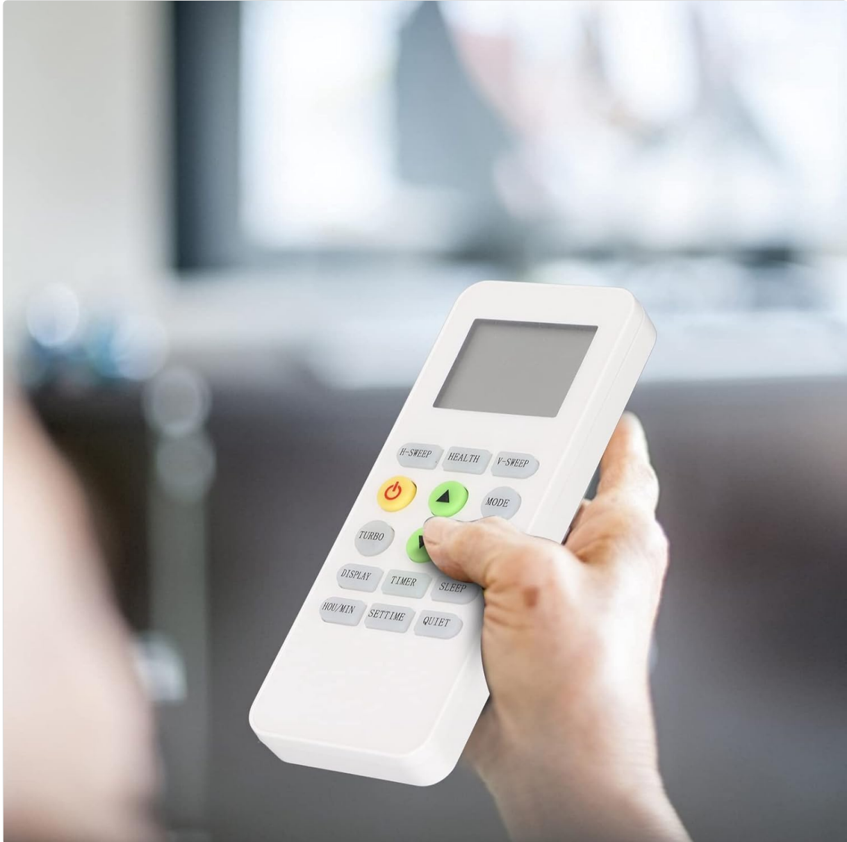
Figure 4.2.1: Remote control in active use with an air conditioner.