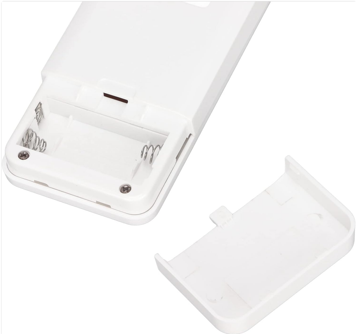
Figure 3.1.1: Open battery compartment for AAA battery installation.

Important Note: Ensure batteries are inserted with correct polarity. Do not mix old and new batteries, or different types of batteries. Remove batteries if the remote control will not be used for an extended period.