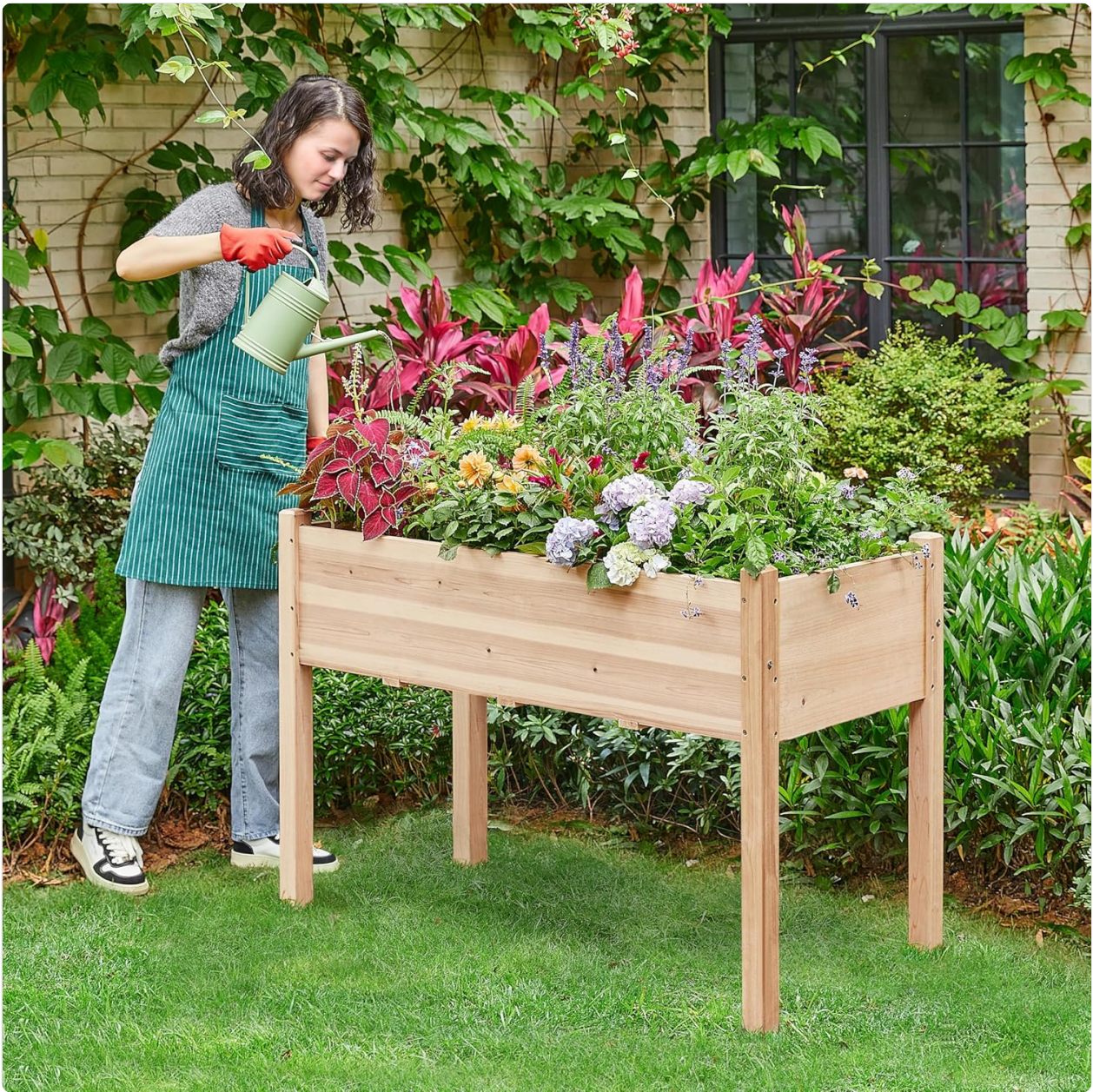
Image: Person watering plants in the raised garden bed.