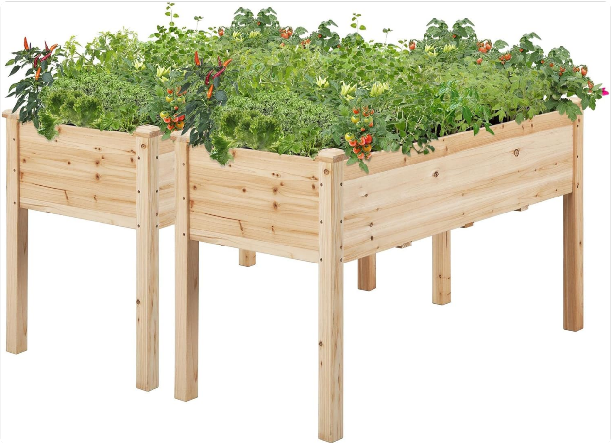
Image: Two Yaheetech Raised Garden Beds in a garden setting.