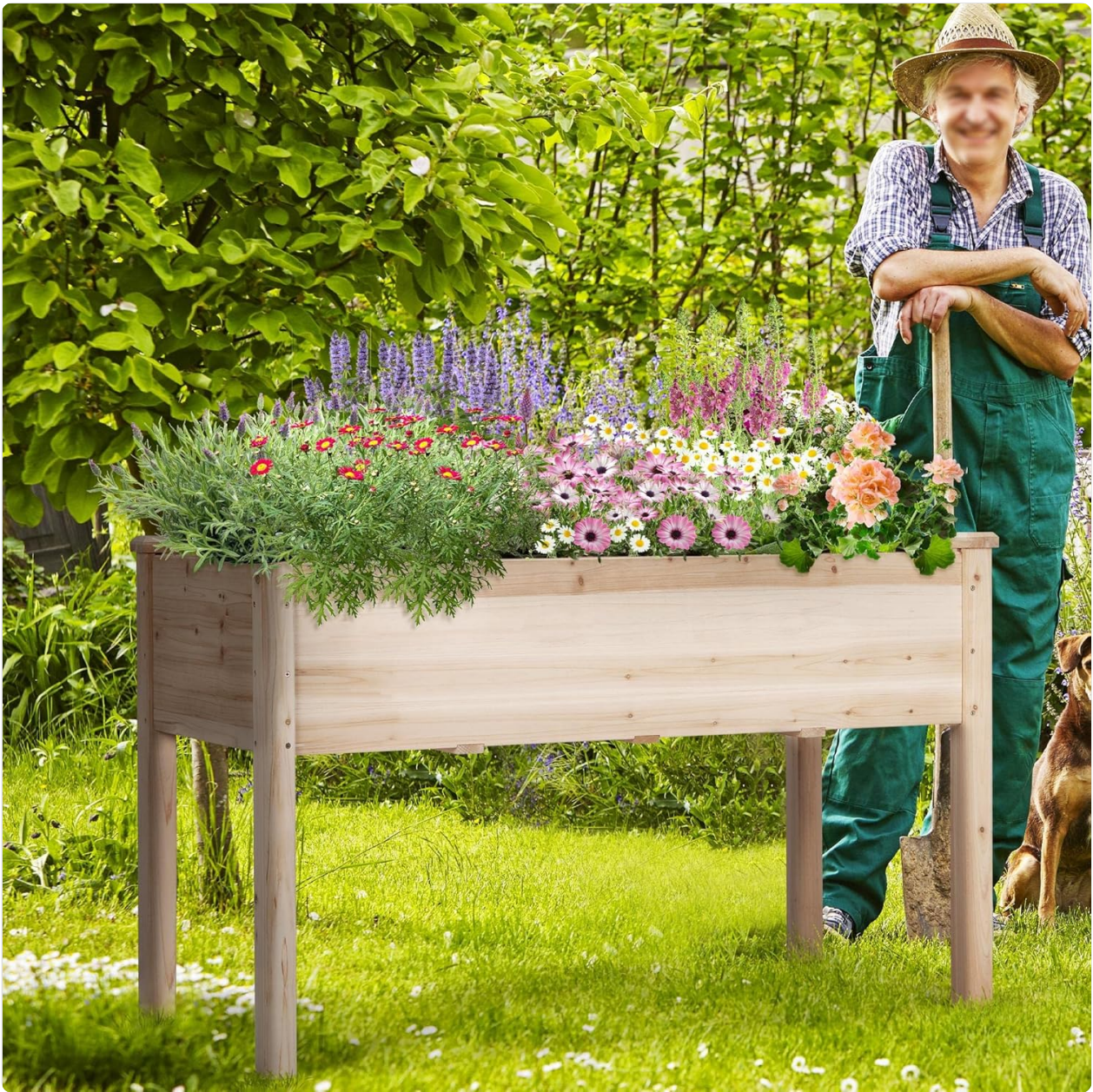
Image: Safe height protects plants from pests.