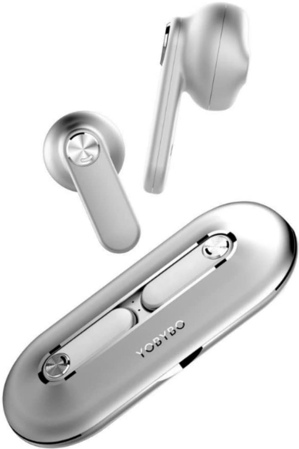
Image: YOBYBO CARD20 PRO Earphones and Charging Case. The image shows the two silver-white earbuds and their matching oval-shaped charging case, highlighting their compact and sleek design.