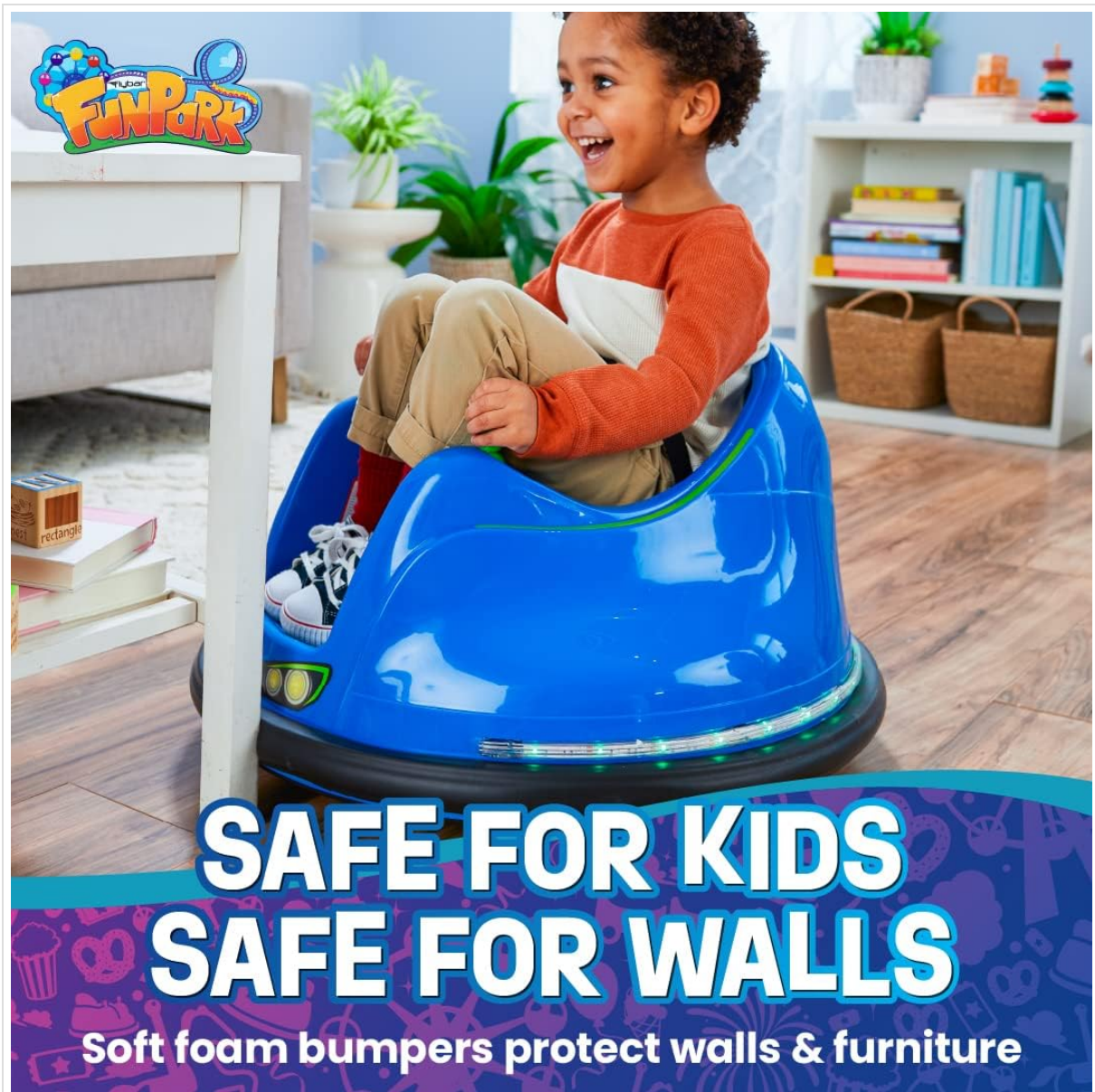
Image: A child enjoying the bumper car, highlighting its safety features for both the child and household surfaces.