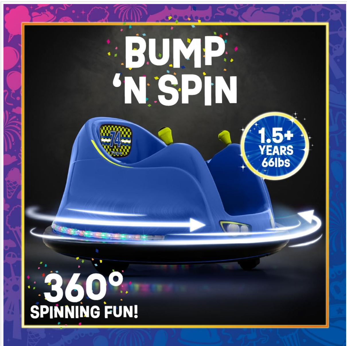
Image: The bumper car executing a 360-degree spin, highlighting its maneuverability and flashing LED lights.