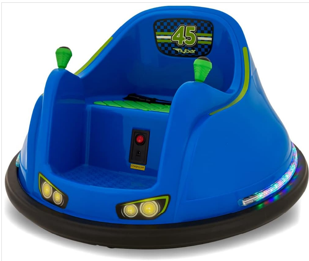
Image: The Flybar FunPark Electric Bumper Car 6V, showcasing its blue design and robust construction.

Thank you for choosing the Flybar FunPark Electric Bumper Car 6V. This manual provides essential information for the safe operation, assembly, maintenance, and troubleshooting of your new electric ride-on toy. Please read this manual thoroughly before use and retain it for future reference. This product is designed for toddlers aged 1.5 to 4 years and supports a maximum weight of 66 pounds.