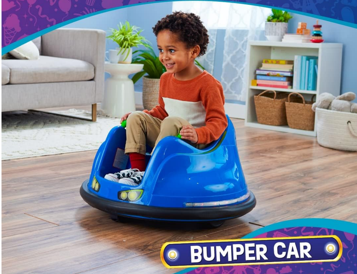
Image: A child operating the bumper car, demonstrating its ease of use.

Watch your child's face light up with joy