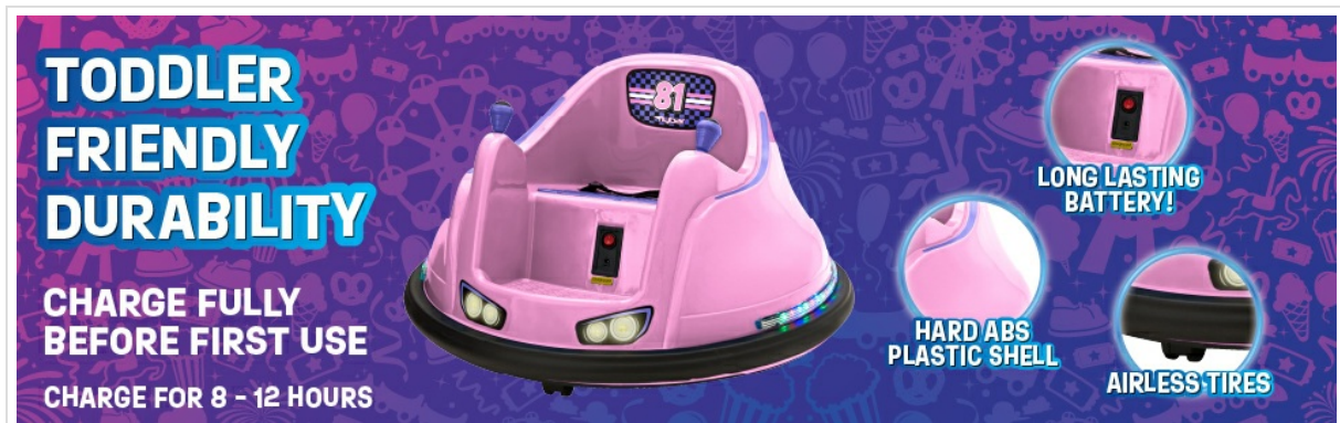
Image: Features of the bumper car emphasizing its durability, including a hard ABS plastic shell and airless tires.