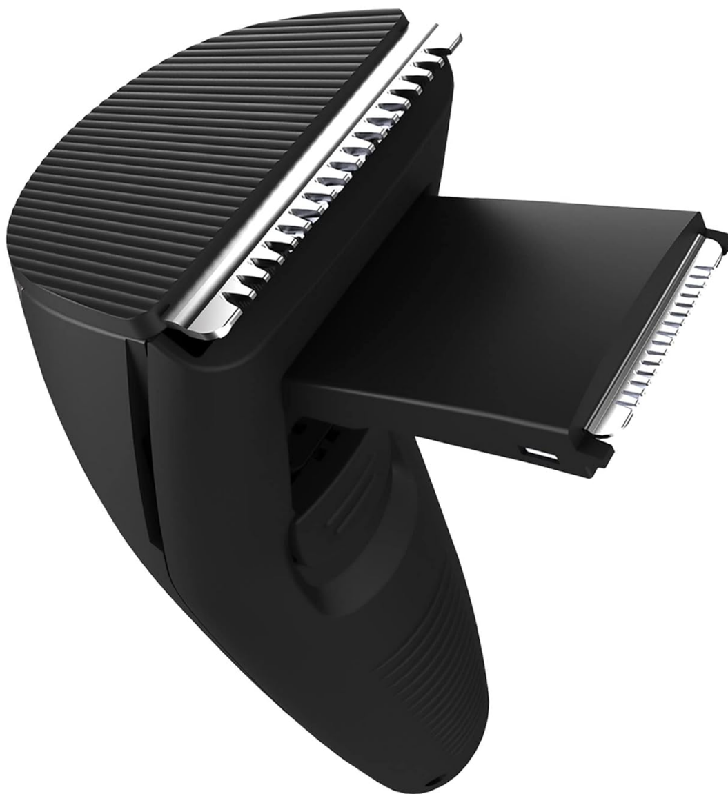
Figure 6: The trimmer with its integrated pop-up detail trimmer extended, ready for precise shaping.