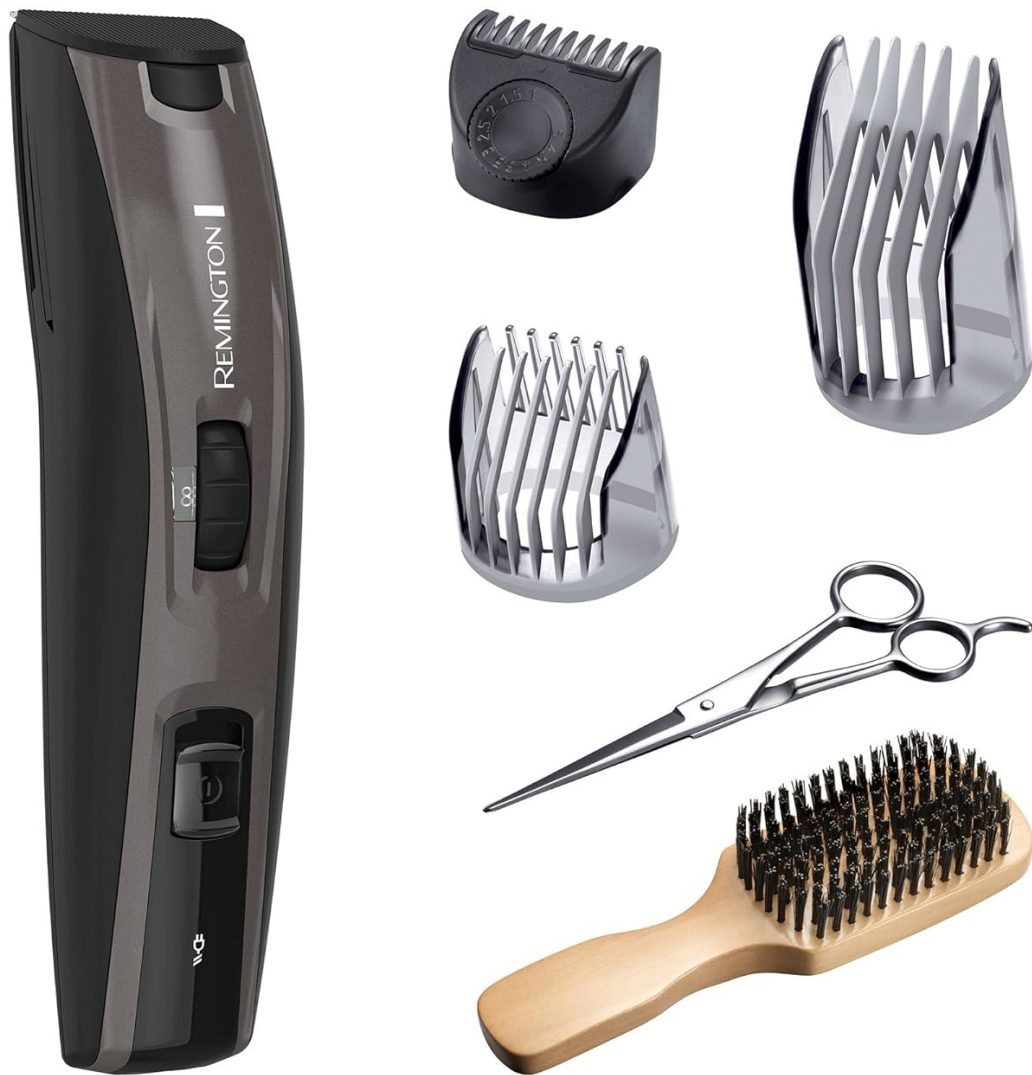
Figure 1: The Remington® 'The Beardsman' Beard Trimmer and its complete grooming kit, including the trimmer, three adjustable combs, scissors, and a beard brush.