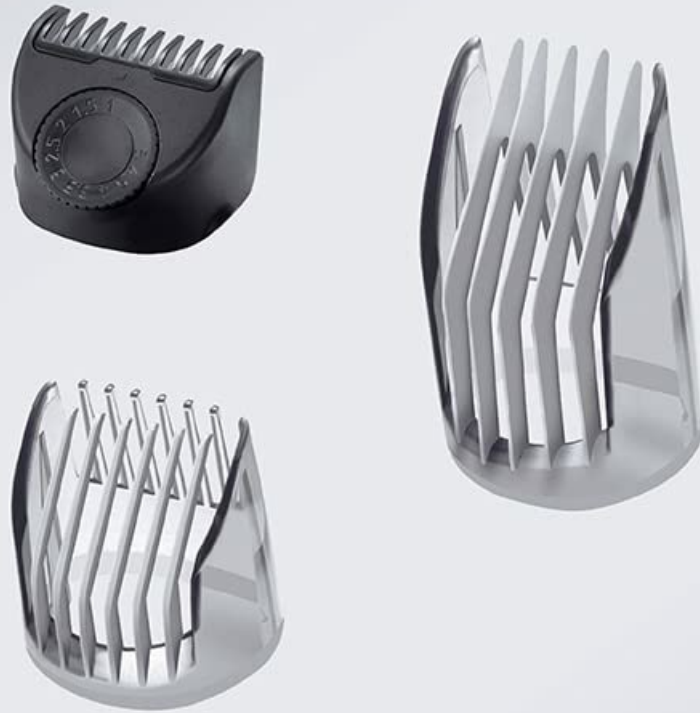
Figure 5: The three distinct adjustable combs provided for various beard lengths: XL, full beard, and stubble.

27 Length Options for Our Widest Trimming Range*