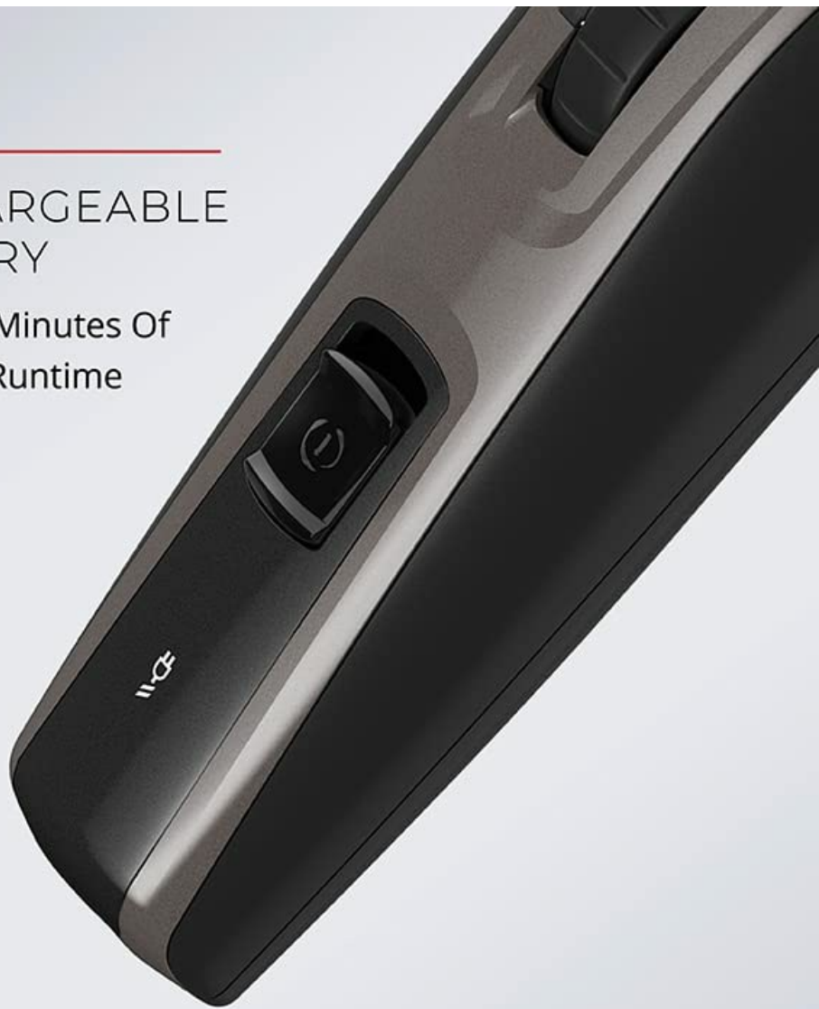
Figure 3: The power button and charging indicator light on the trimmer, indicating its rechargeable battery status.