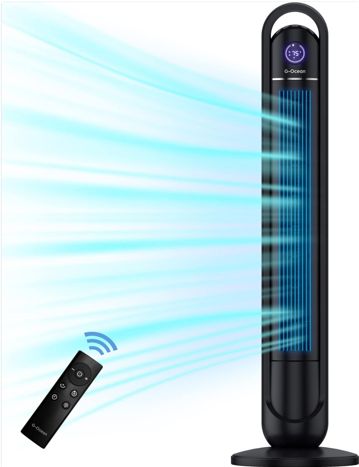
Figure 1: G-Ocean 45 Inch Tower Fan with Remote Control.