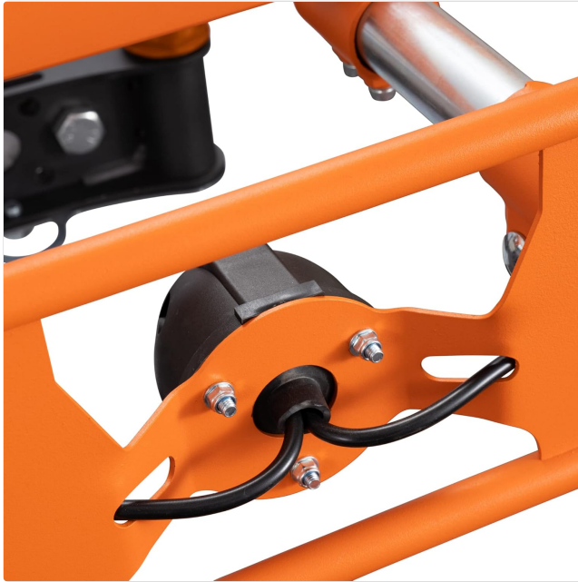
Figure 4.2: Wiring connection for the light unit. This image details the electrical connection point for the universal light unit, showing the cable entry and securing bolts.

shows how the main horizontal bar of the carrier connects to the central support structure, indicating a secure bolted assembly.