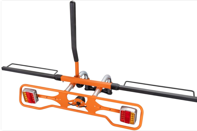
Figure 3.1: Complete Pendle W1 Cycle Carrier. This image displays the full assembly of the carrier, including the main frame, wheel trays, vertical support, and the attached universal light unit.