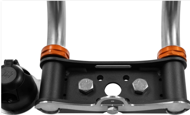
Figure 3.2: Close-up of the Universal Mounting Block. This image highlights the mechanism used to secure the carrier to the vehicle's towbar, showing the bolts and connection point.