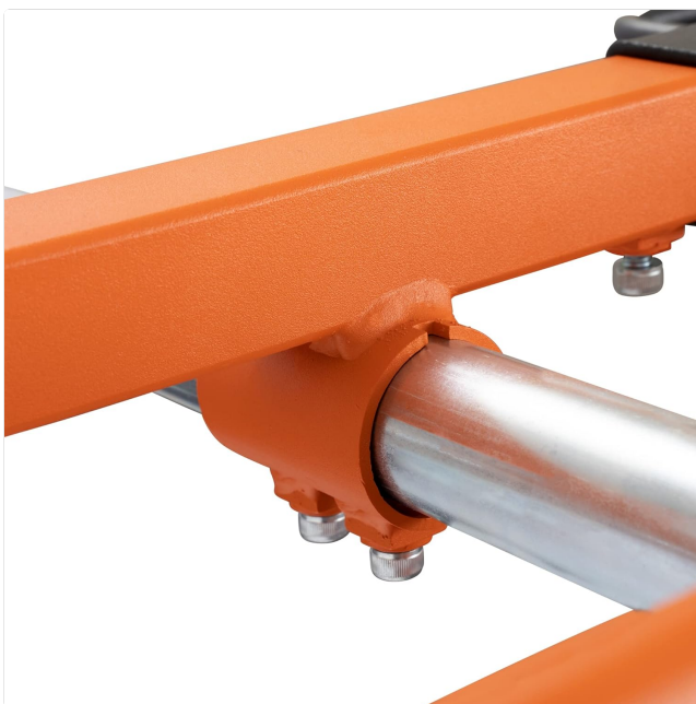
Figure 4.1: Connection point of the carrier frame. This image