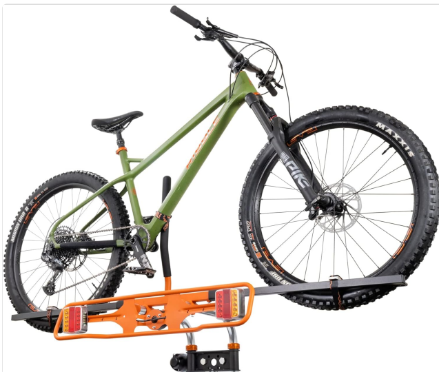
Figure 5.2: Close-up of a bike wheel secured with a strap. This image details how the strap kit is used to firmly hold the bicycle wheel in place within the carrier's tray.