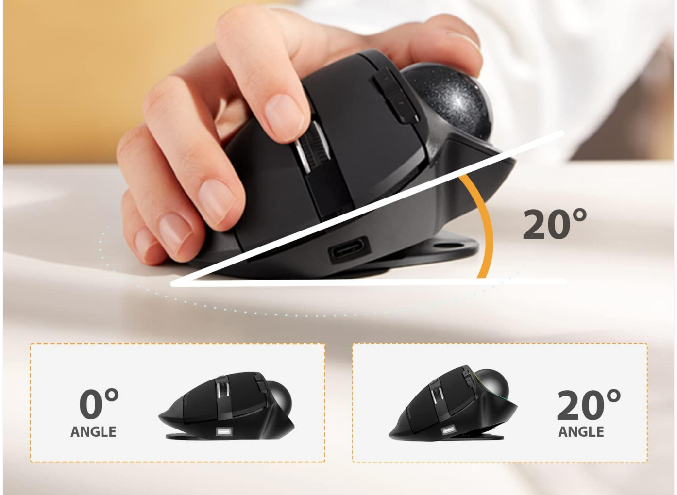
Image: Illustration demonstrating the adjustable angle feature of the ProtoArc EM01 mouse, showing 0-degree and 20-degree tilt options for improved ergonomics.