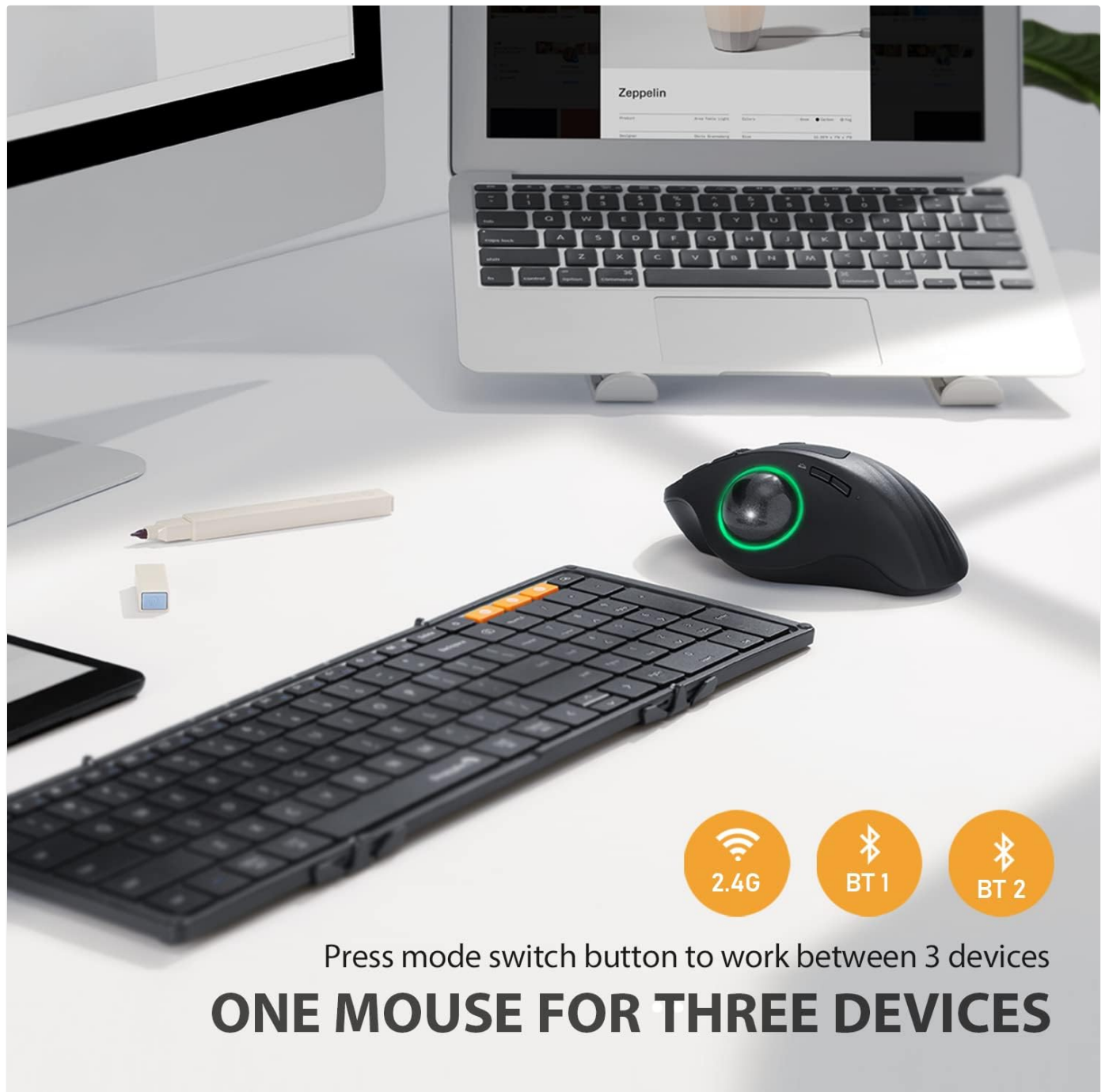
Image: The ProtoArc EM01 mouse shown connected to a laptop, a tablet, and a smartphone, illustrating its multi-device connectivity feature.

You can switch between connected devices by pressing the mode switch button briefly.