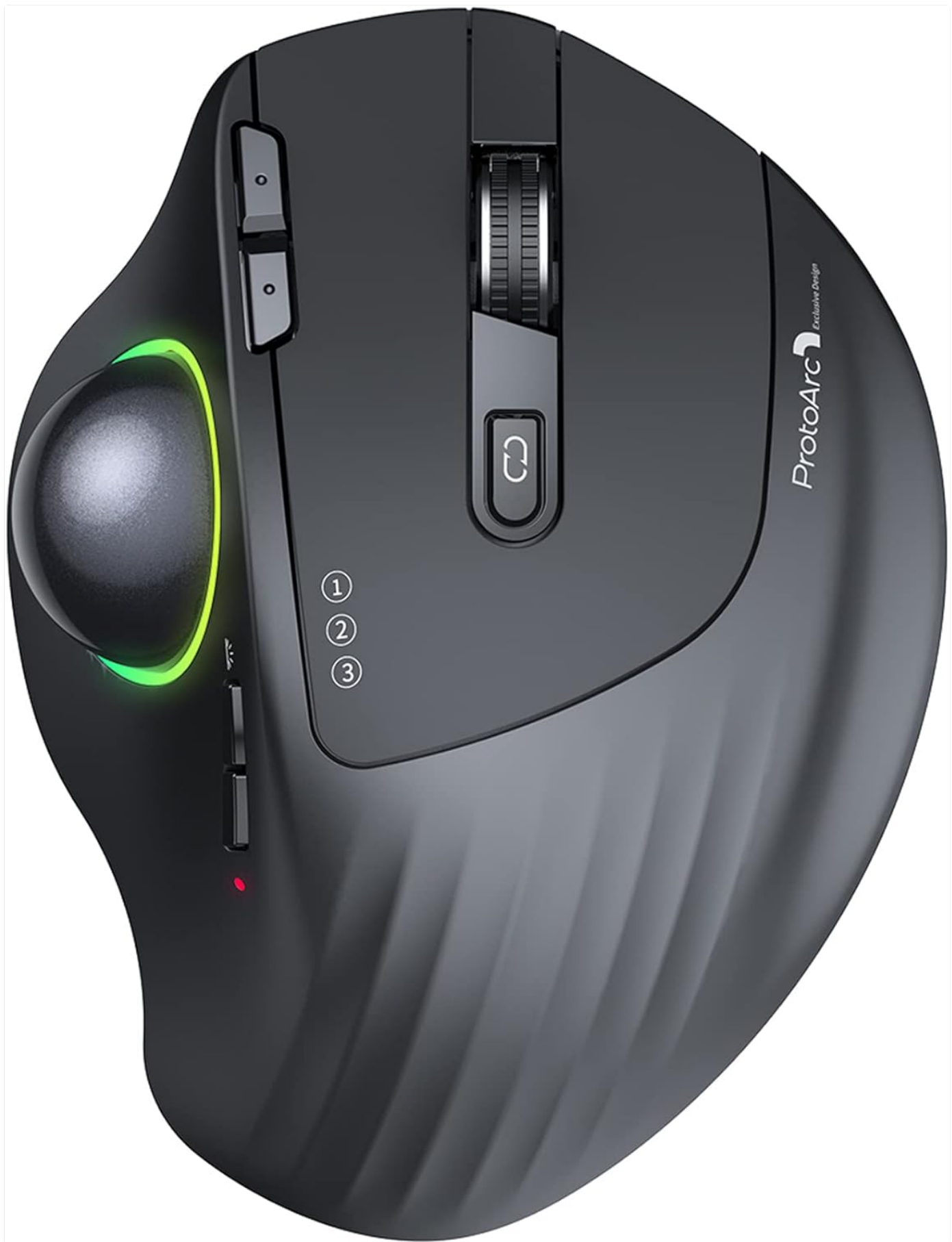
Image: Top-down view of the ProtoArc EM01 Wireless Bluetooth Trackball Mouse, highlighting its ergonomic design and trackball.