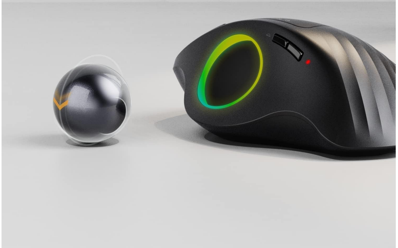
Image: A close-up of the ProtoArc EM01 mouse, emphasizing the thumb-operated trackball and the concept of not needing to move your hands.