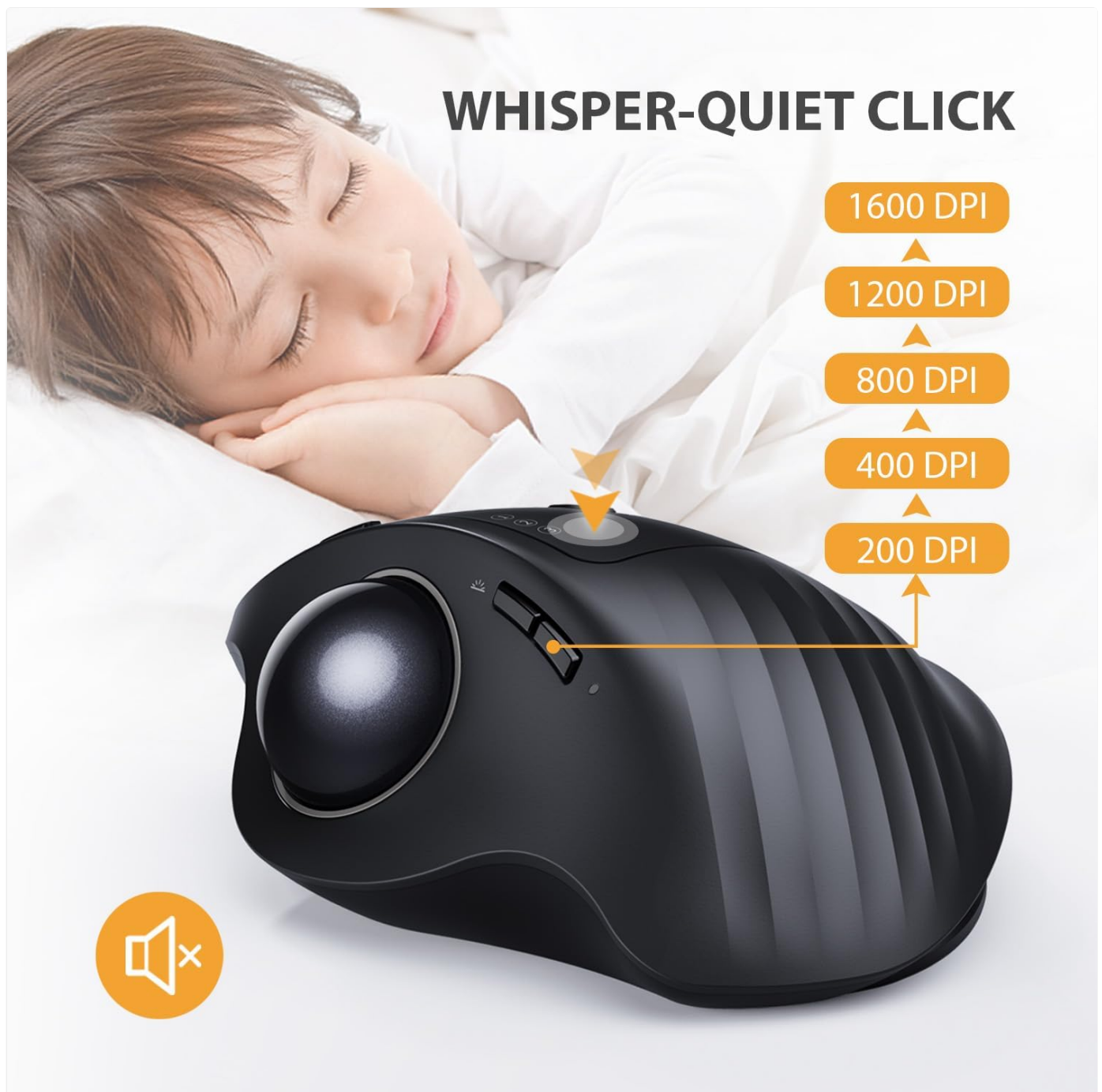
Image: A view of the ProtoArc EM01 mouse highlighting the forward and backward navigation buttons, useful for web browsing.