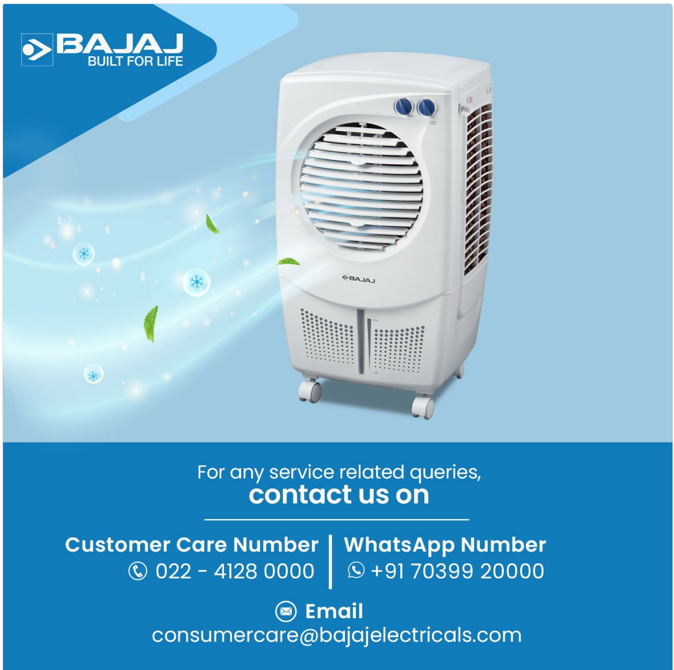
Image 10.1: Bajaj customer care contact details for service-related queries.

Email: consumercare@bajajelectricals.com