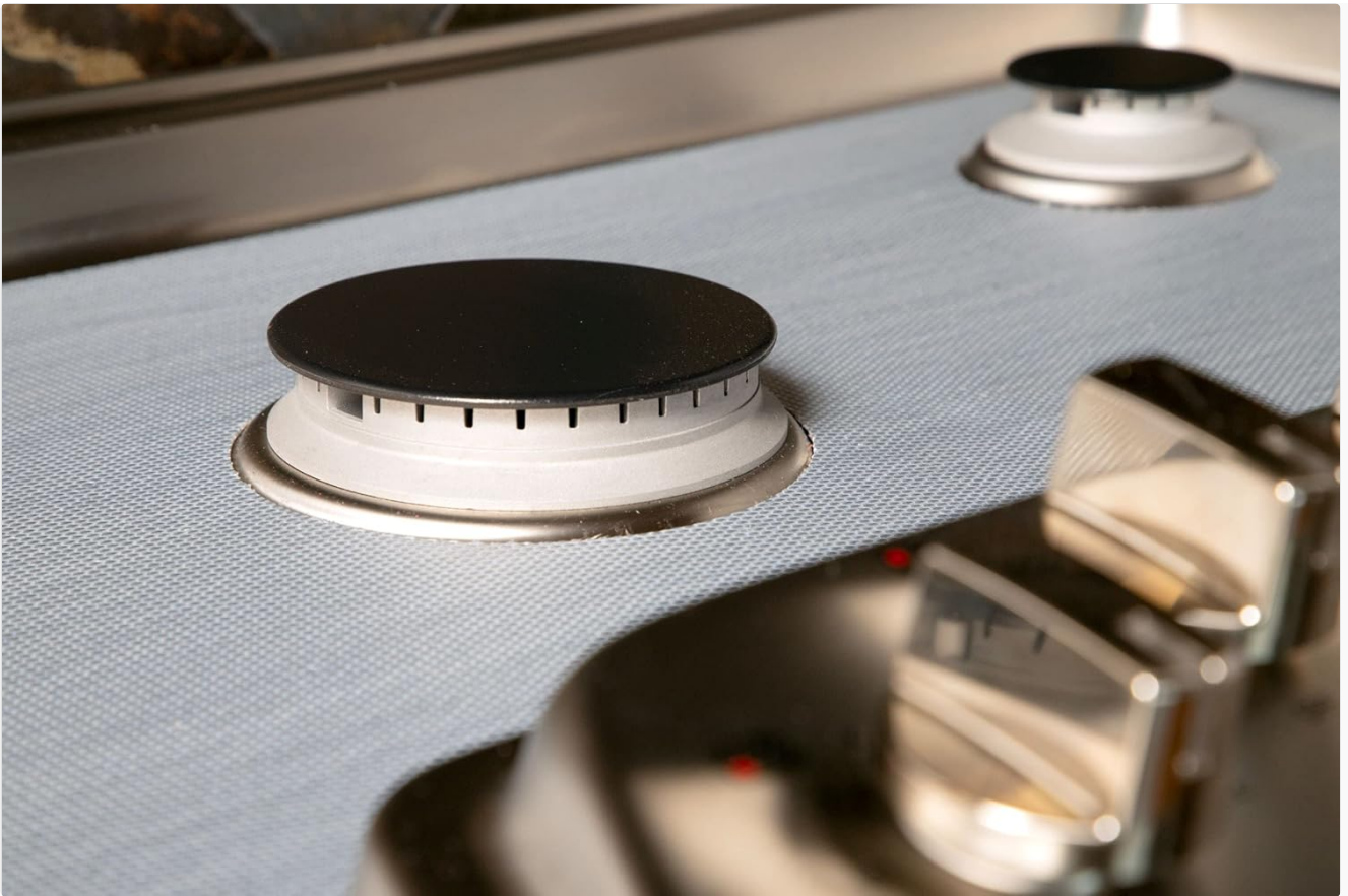
Image 2.1: StoveGuard cover installed on a gas range, providing a protective layer.