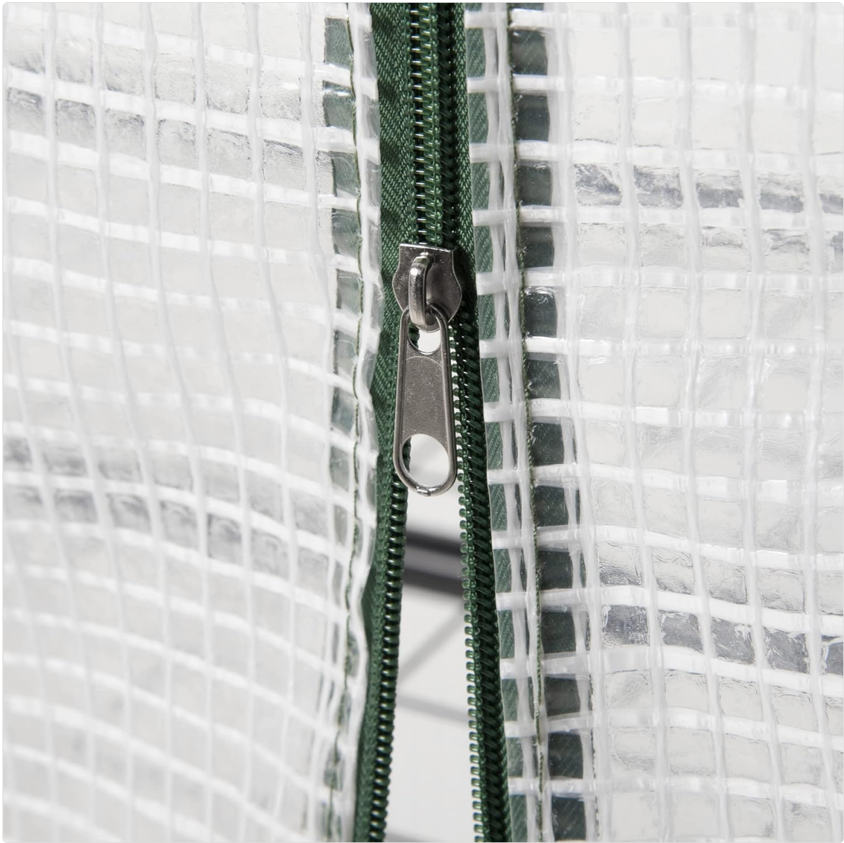
Image 6.1: A close-up view of the robust zipper mechanism on the greenhouse door.