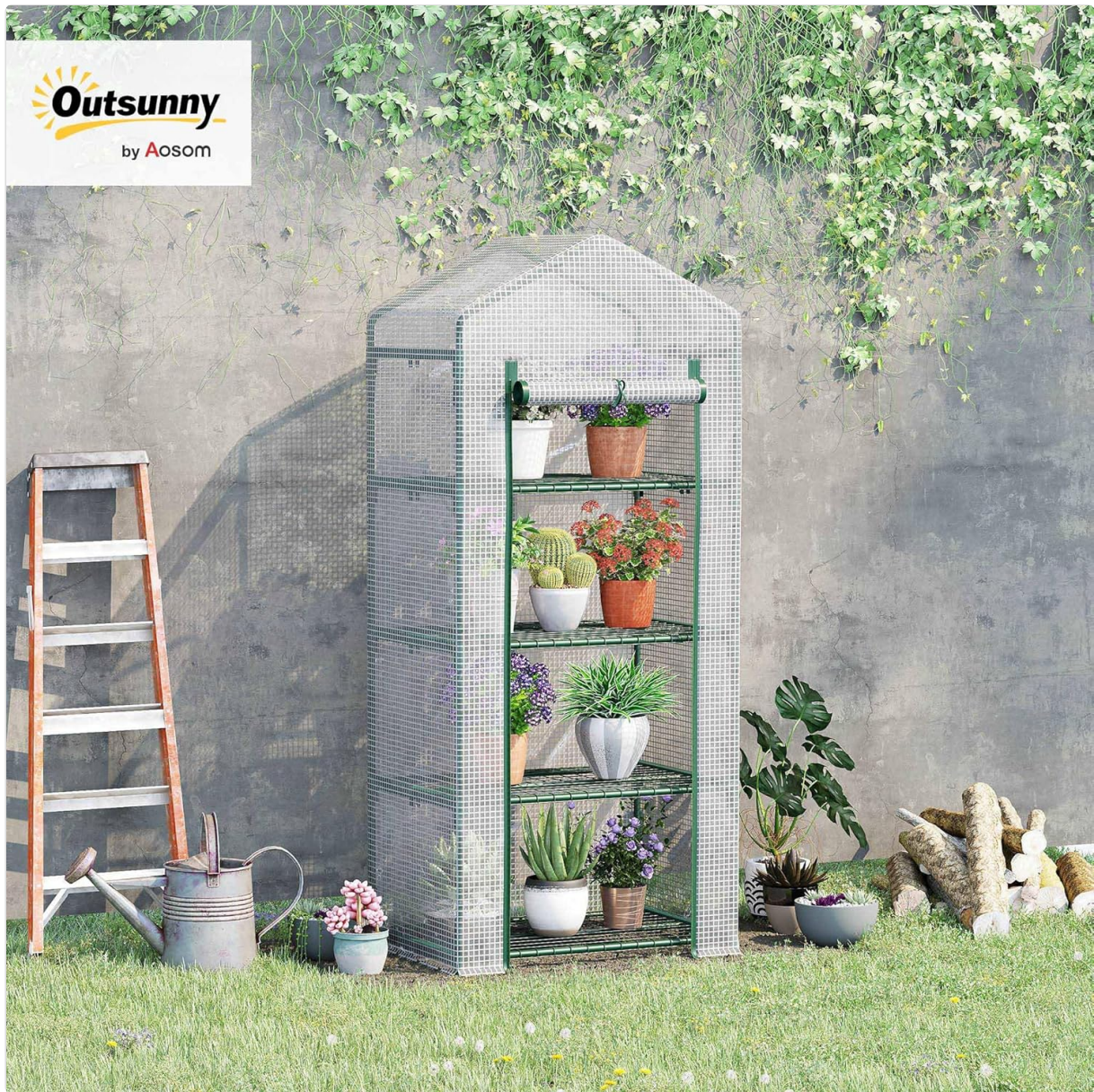
Image 1.1: The Outsunny Mini Greenhouse, showcasing its compact design and capacity for various plants.