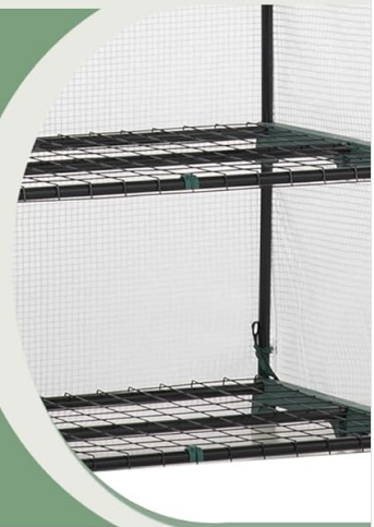
Image 5.2: Practical features such as the roll-up zippered door for easy access and removable shelves for flexible plant arrangement.

Fournit un grand espace de rangement pour vos plantes