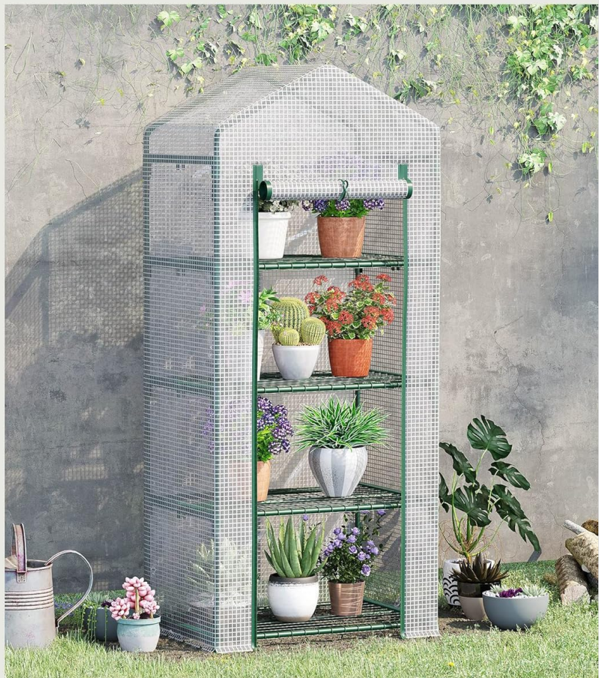
Image 5.1: Features of the PE cover, including anti-UV, tear-resistant properties, heat retention, and bird protection.