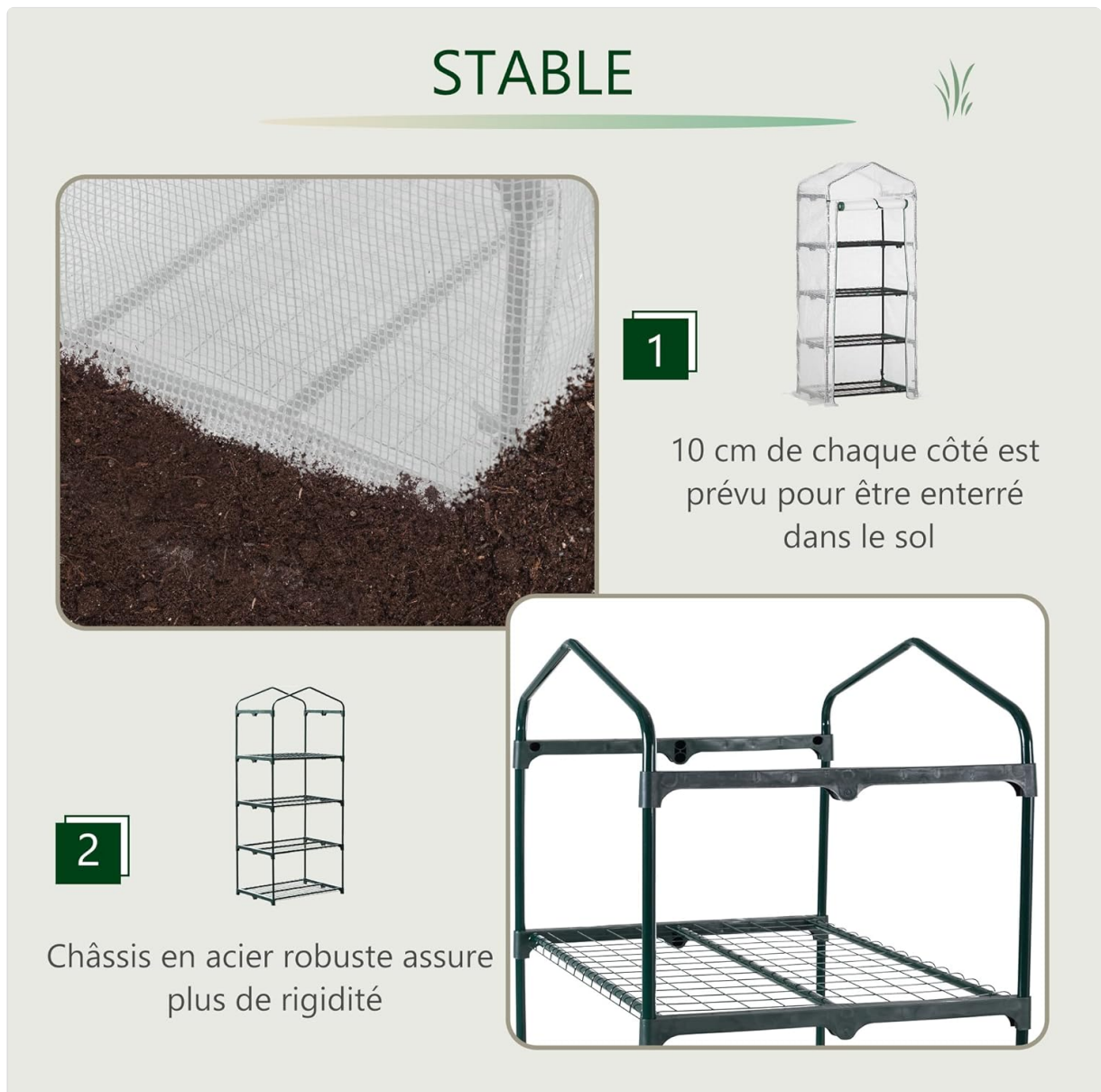
Image 4.1: Illustration of stability features, including burying the cover edge and the robust steel frame structure.