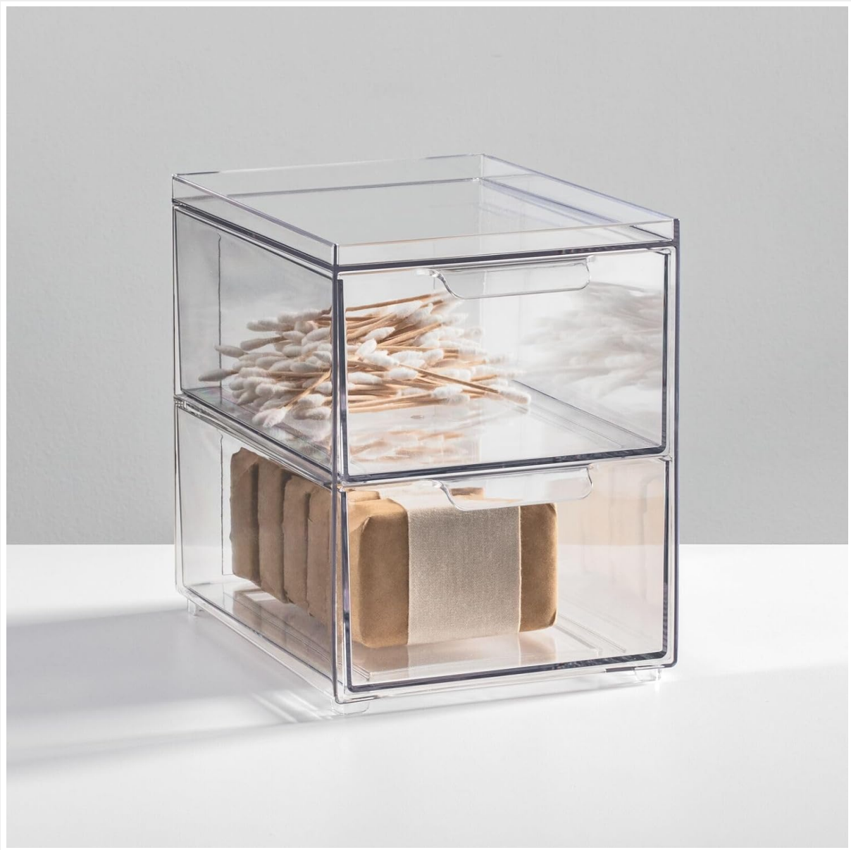
Figure 2.2: Detailed dimensions of the storage container.