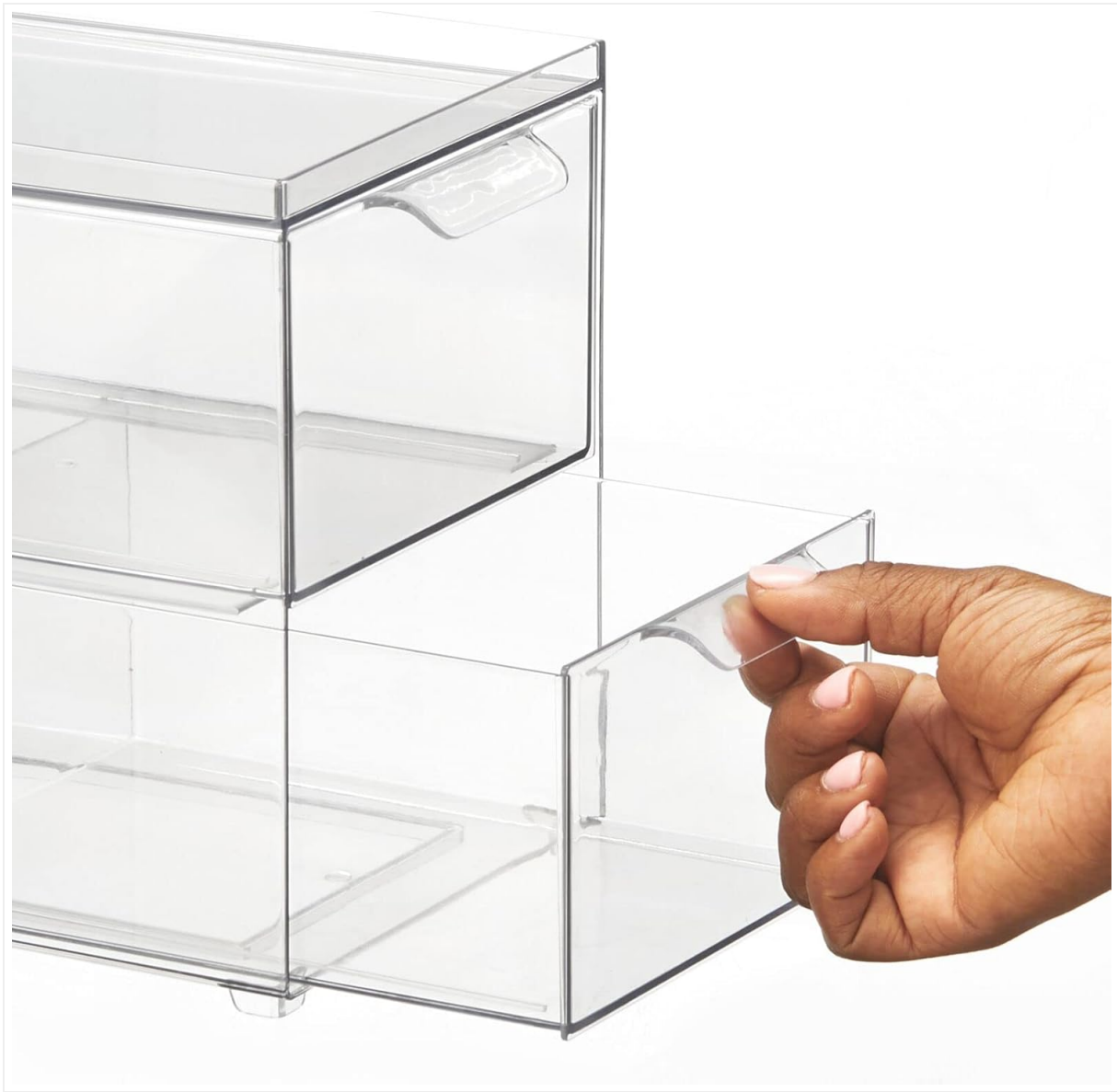
Figure 4.2: Operating a pull-out drawer.