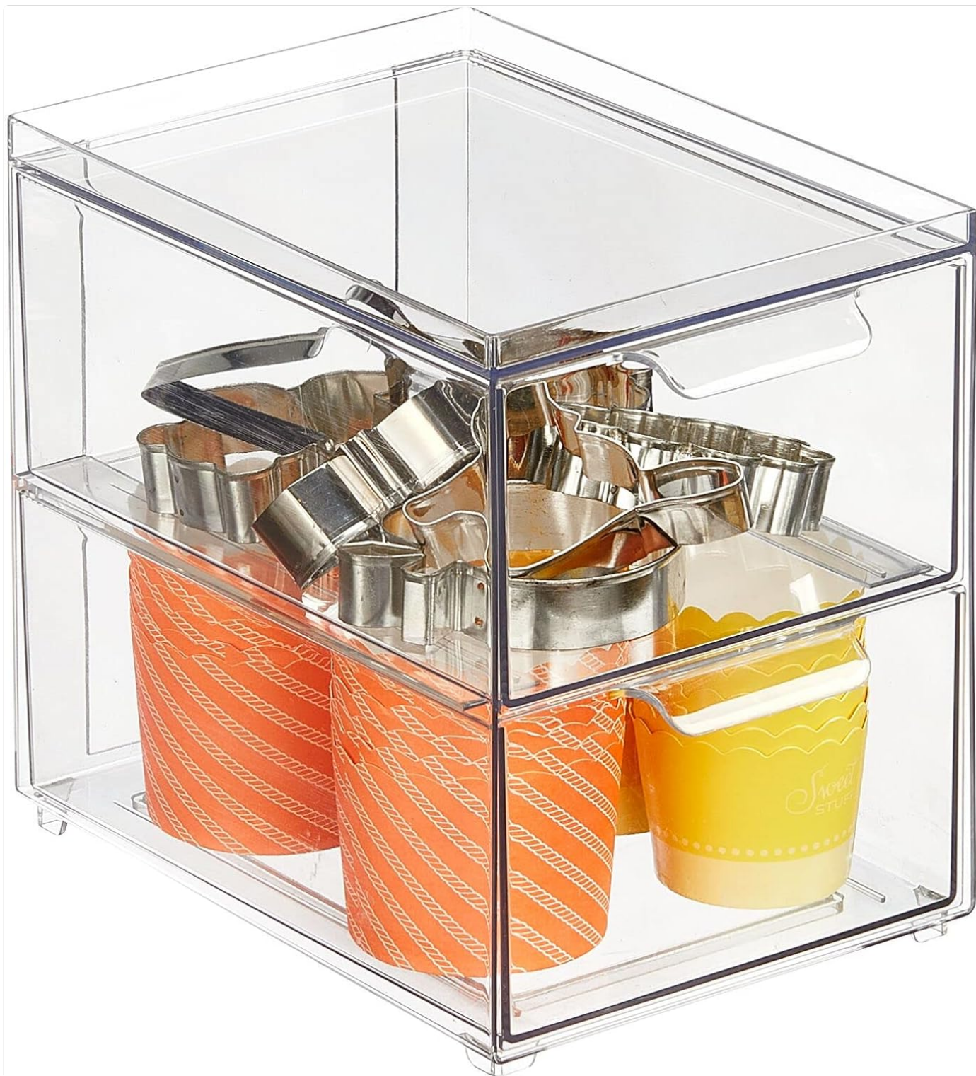
Image: The mDesign Stackable Storage Container, showcasing its two clear pull-out drawers filled with baking accessories like cookie cutters and cupcake liners, demonstrating its practical use for organizing small kitchen items.