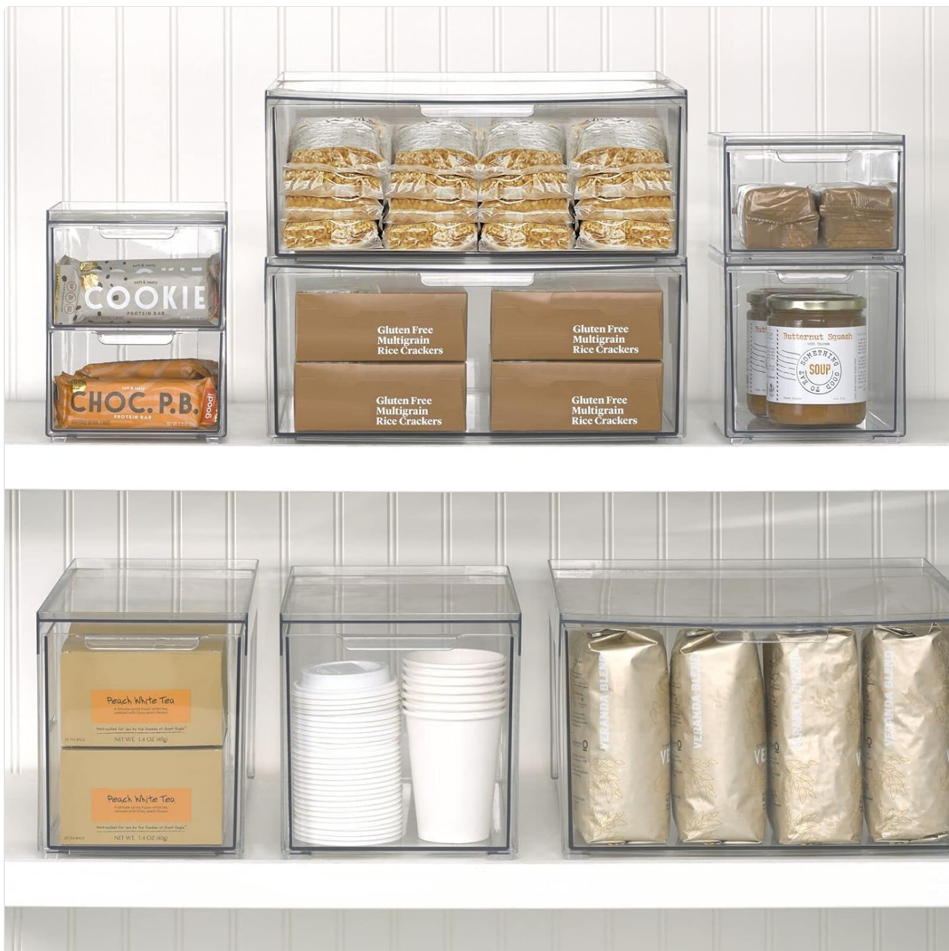
Image: Several mDesign storage containers arranged neatly on shelves, demonstrating their effectiveness in organizing a pantry with items such as packaged snacks, crackers, and jars.