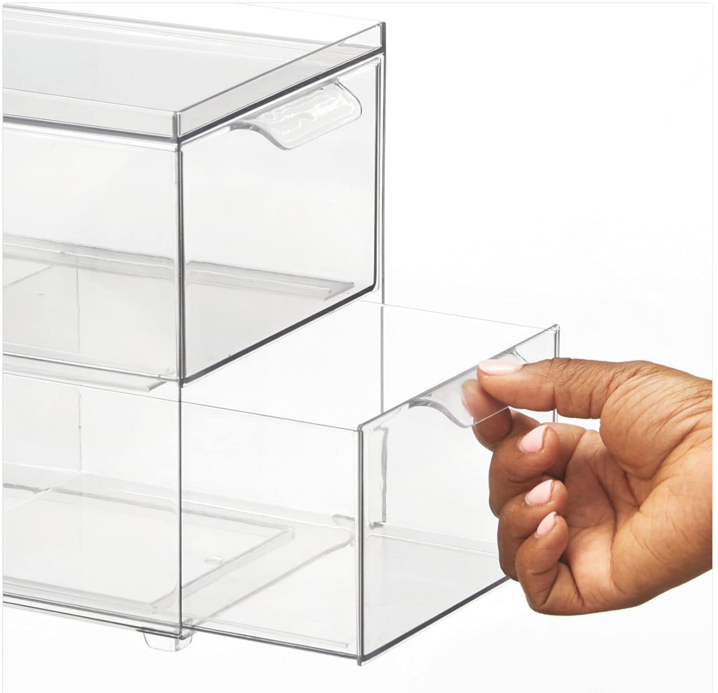
Image: A close-up of a hand demonstrating how to pull out one of the clear plastic drawers from the storage unit, highlighting the ease of access.