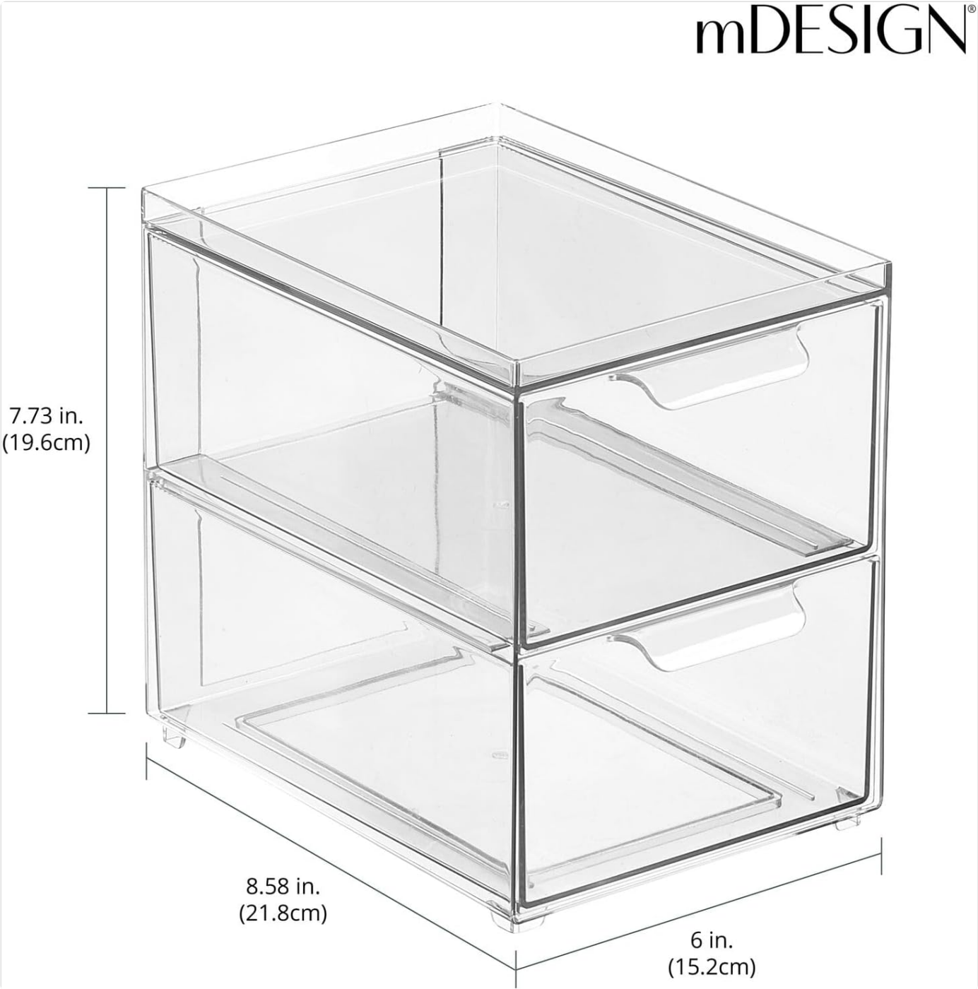
Image: A technical diagram illustrating the precise dimensions of the mDesign storage container, indicating a depth of 8.58 inches (21.8 cm), a width of 6 inches (15.2 cm), and a height of 7.73 inches (19.6 cm).

Detailed product specifications for the mDesign Stackable Storage Containers Box (Model 20487MDK):