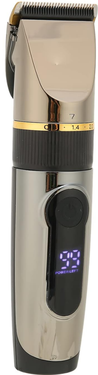
Image: Close-up of the hair clipper showing the fine-tuning pitch wheel, which allows adjustment of cutting length from 0.8mm to 2.0mm.