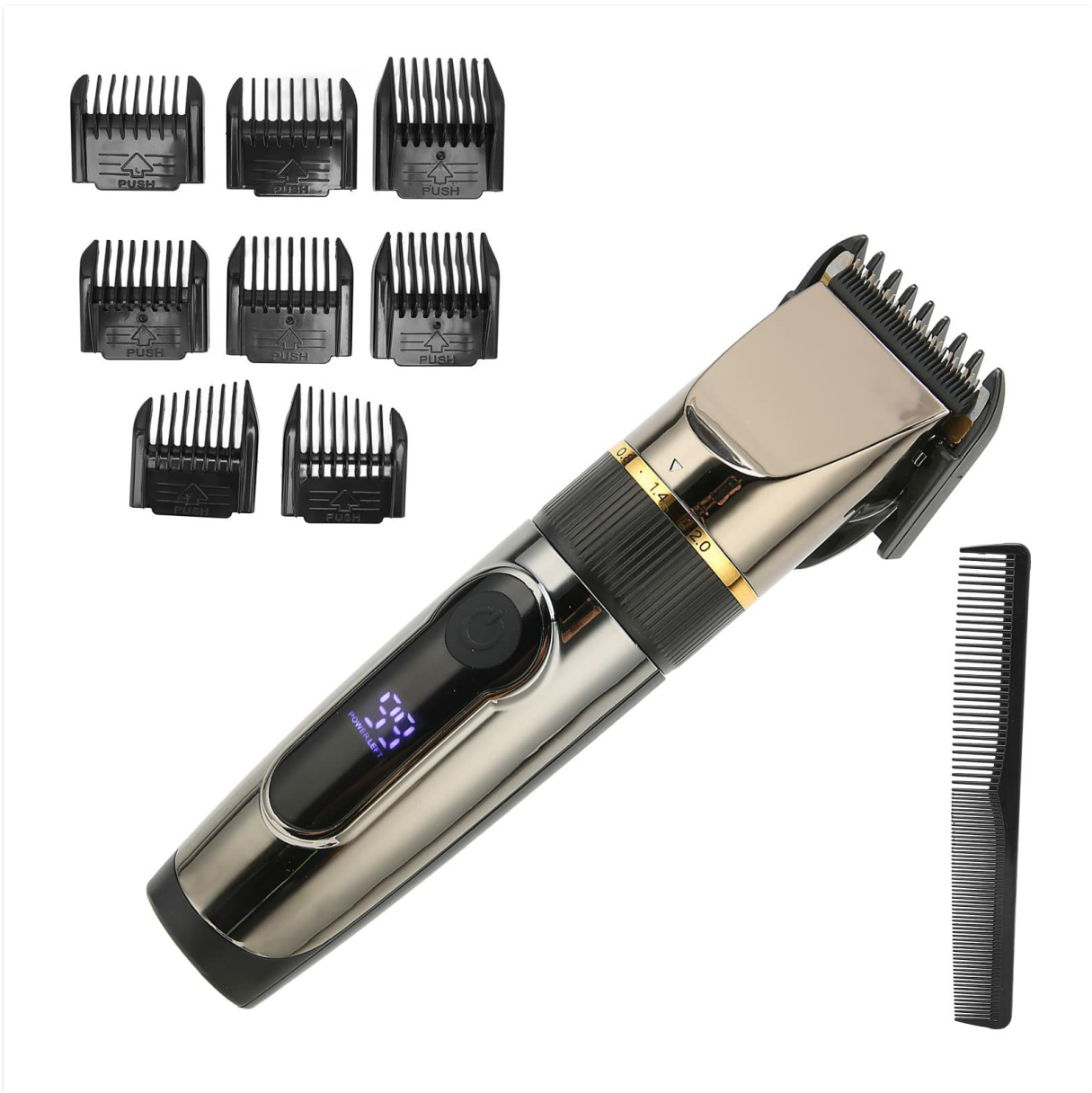
Image: The Brrnoo USB Rechargeable Waterproof Hair Clipper, showcasing its sleek design.