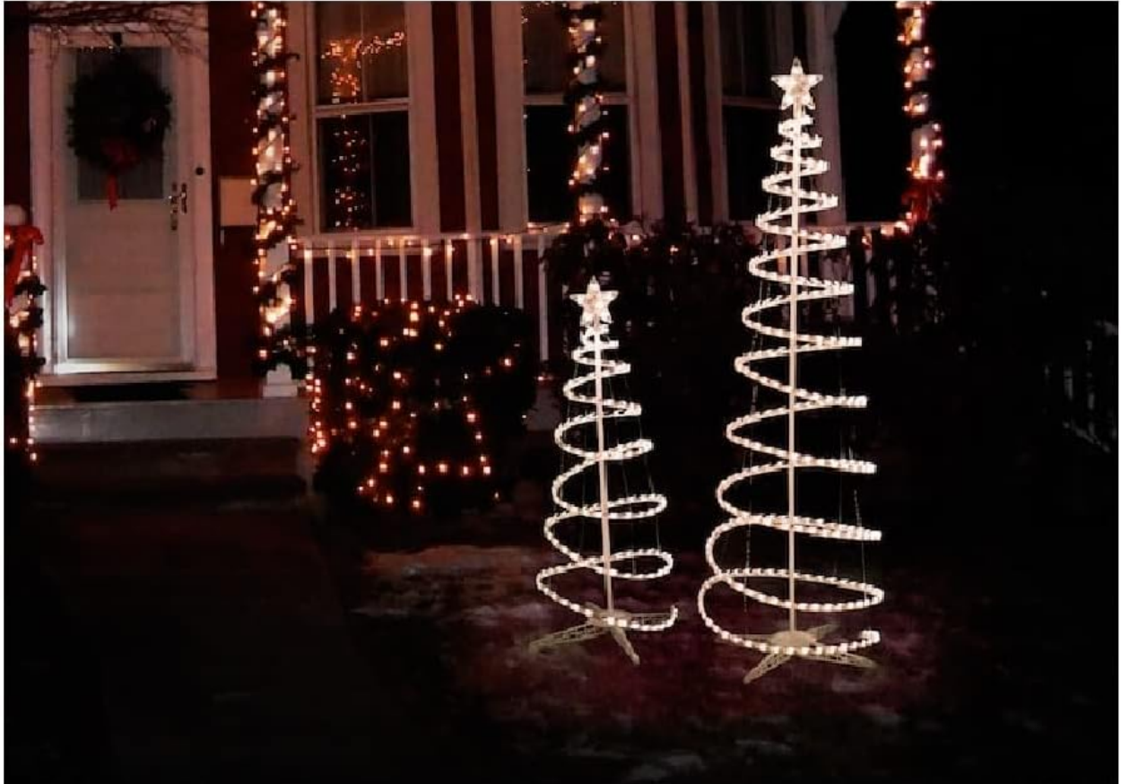
Image 2: The two spiral trees illuminated at night, positioned on an outdoor porch or pathway, demonstrating their festive glow. The taller tree is on the right, and the shorter tree is on the left, both casting a warm white light.