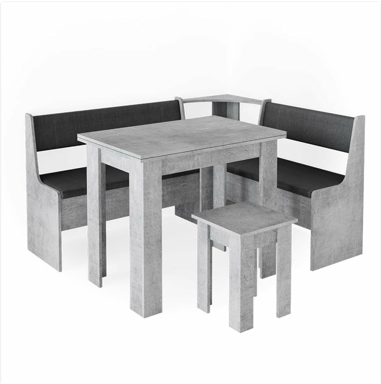
Image 1.1: The Vicco Roman Corner Dining Bench Set, featuring a corner bench, table, and stool in a concrete/anthracite finish.