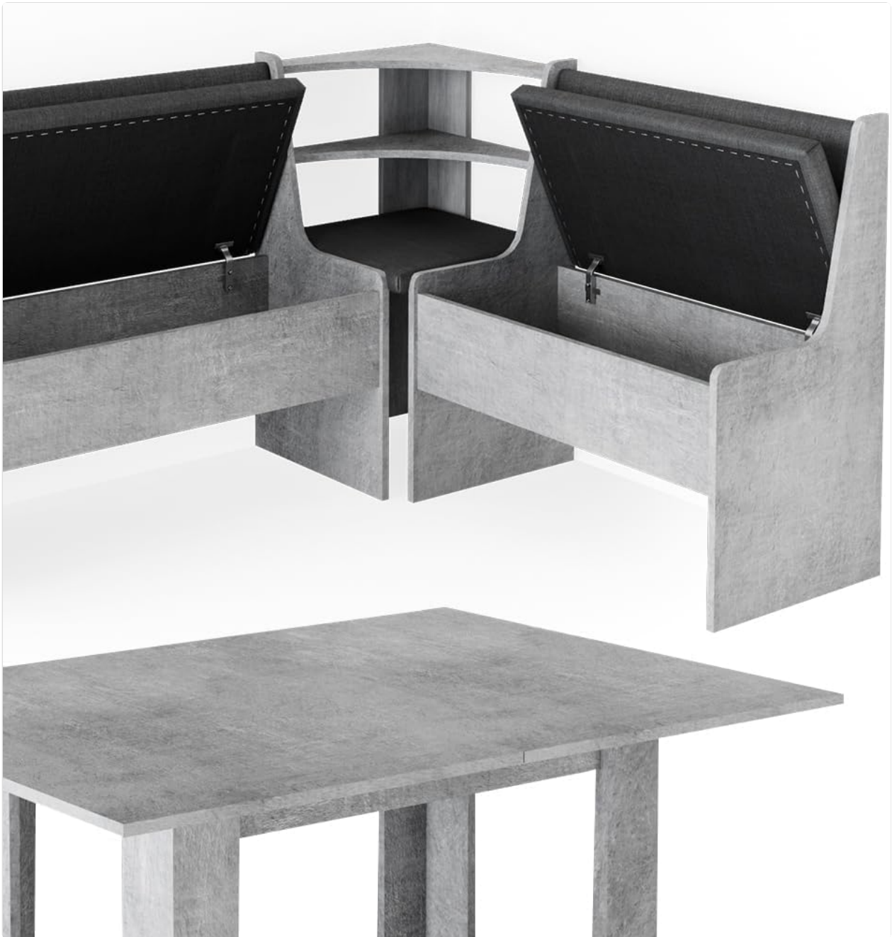
Image 4.2: Detail of the storage compartments under the bench seats, accessible by lifting the seat cushions.