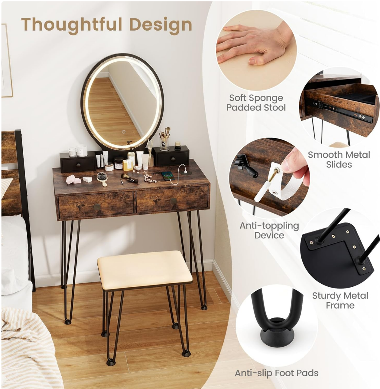
Image: Close-up view highlighting the thoughtful design elements: soft sponge padded stool, smooth metal slides for drawers, an anti-toppling device, sturdy metal frame, and anti-slip foot pads.