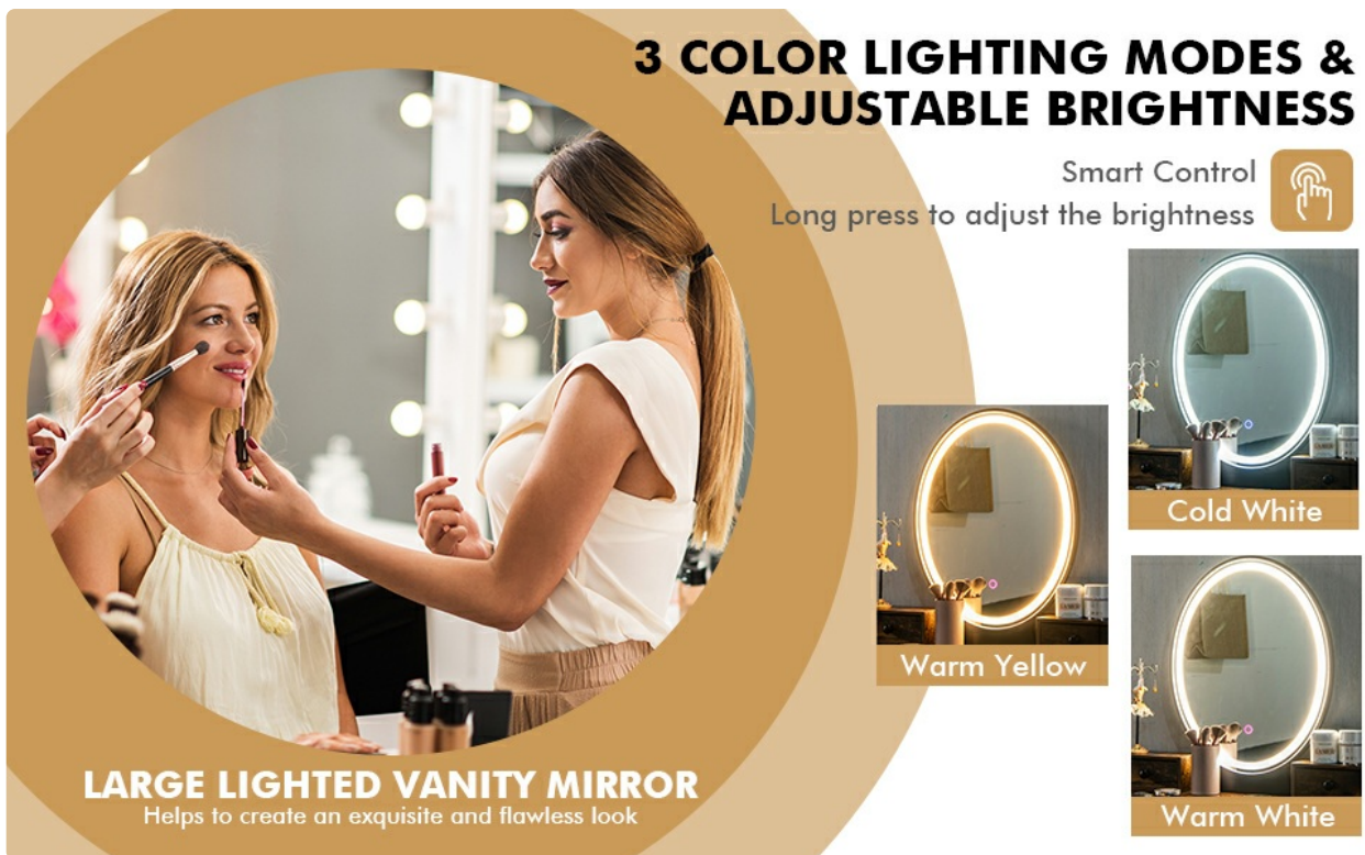
Image: Illustration of the mirror's three lighting modes (warm yellow, warm white, cool white) and smart touch control for changing colors and adjusting brightness.