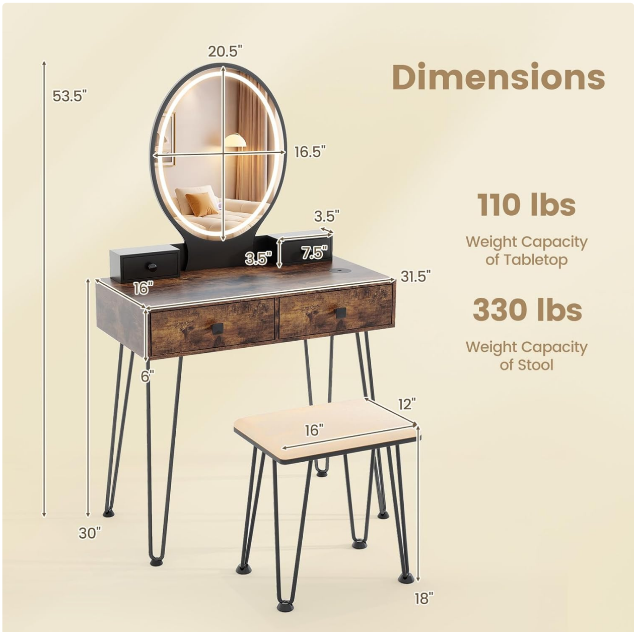
Image: Diagram illustrating the precise dimensions of the vanity desk and its accompanying stool, along with their respective weight