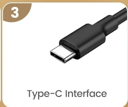
Image: Detailed view of the built-in charging station, showing the fast charging, USB, and Type-C interfaces.