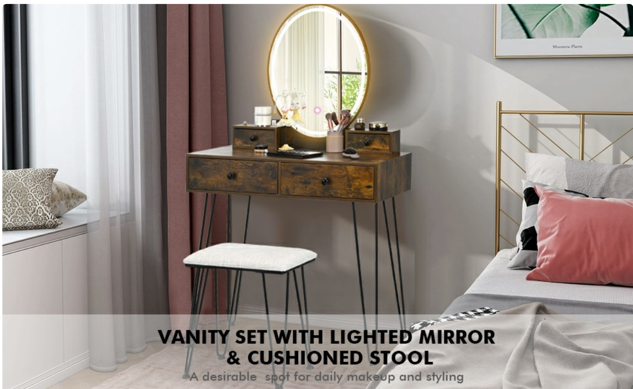
Image: The CHARMAID Vanity Set, featuring a rustic brown desk with a round lighted mirror and a cushioned stool, positioned in a bedroom.

Thank you for choosing the CHARMAID Vanity Desk. This elegant and functional vanity set is designed to enhance your daily beauty routine with its adjustable lighted mirror, integrated charging station, and ample storage. This manual provides detailed instructions to ensure a smooth assembly process and optimal use of your new vanity desk.