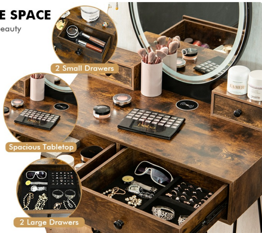
Image: Overhead view illustrating the vanity's storage capabilities, including the spacious desktop, two small drawers, two large drawers, and a dedicated jewelry organizer tray.