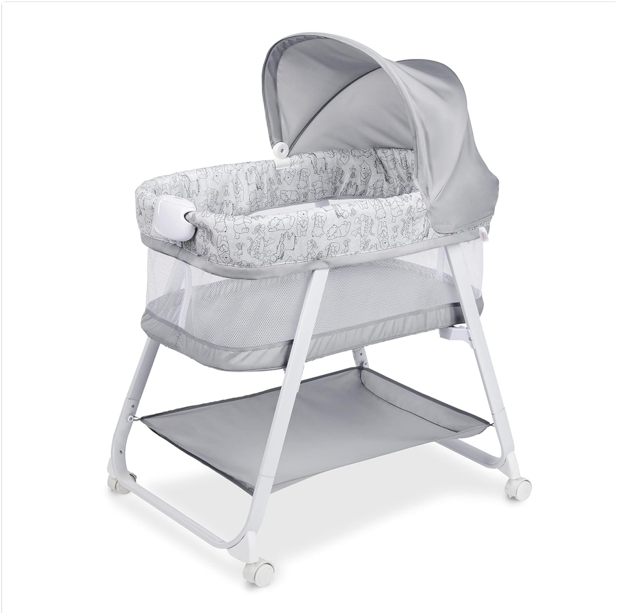
Image: The assembled bassinet positioned in a bedroom setting, demonstrating its compact size and integrated storage bin.