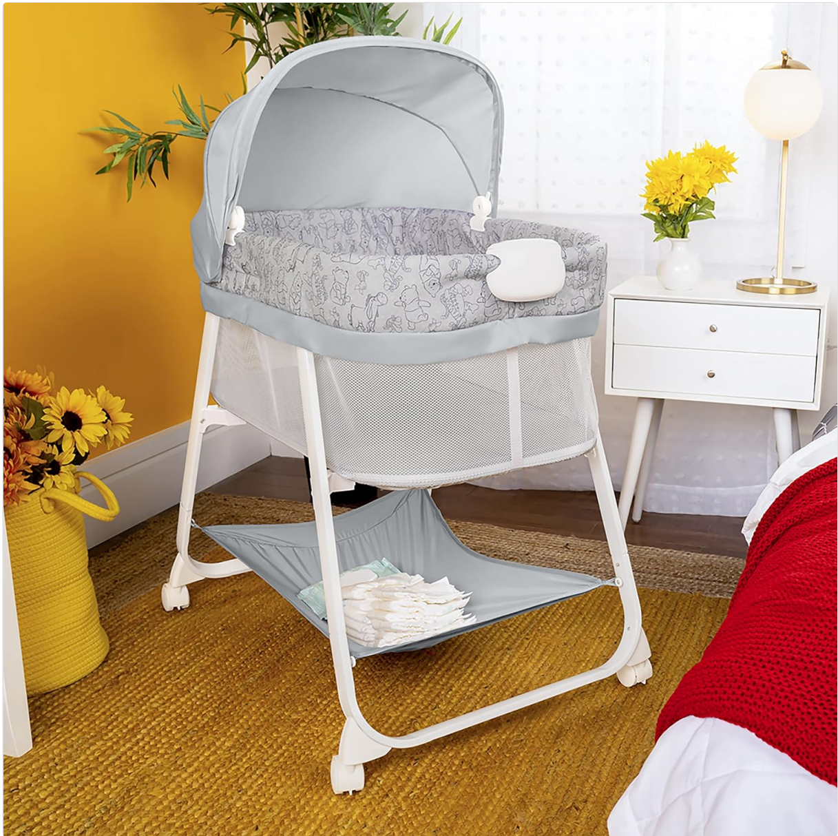
Image: The grey fabric storage bin located under the bassinet, shown holding a stack of diapers and a pack of wipes, demonstrating its utility.