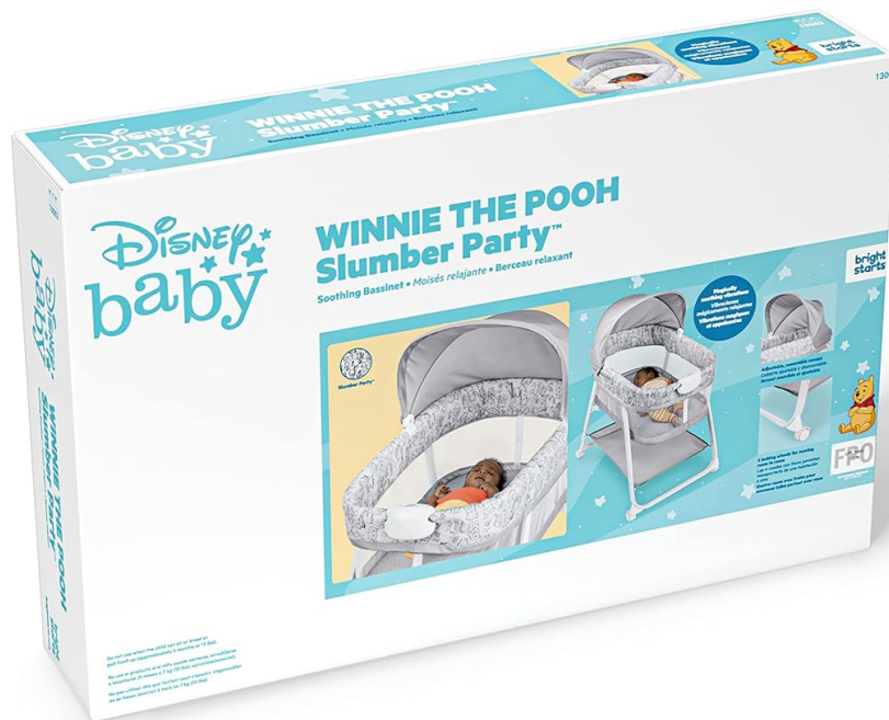
Image: The retail packaging for the Bright Starts Disney Baby Winnie The Pooh Soothing Vibrations Baby Bassinet, indicating the product name and key features.