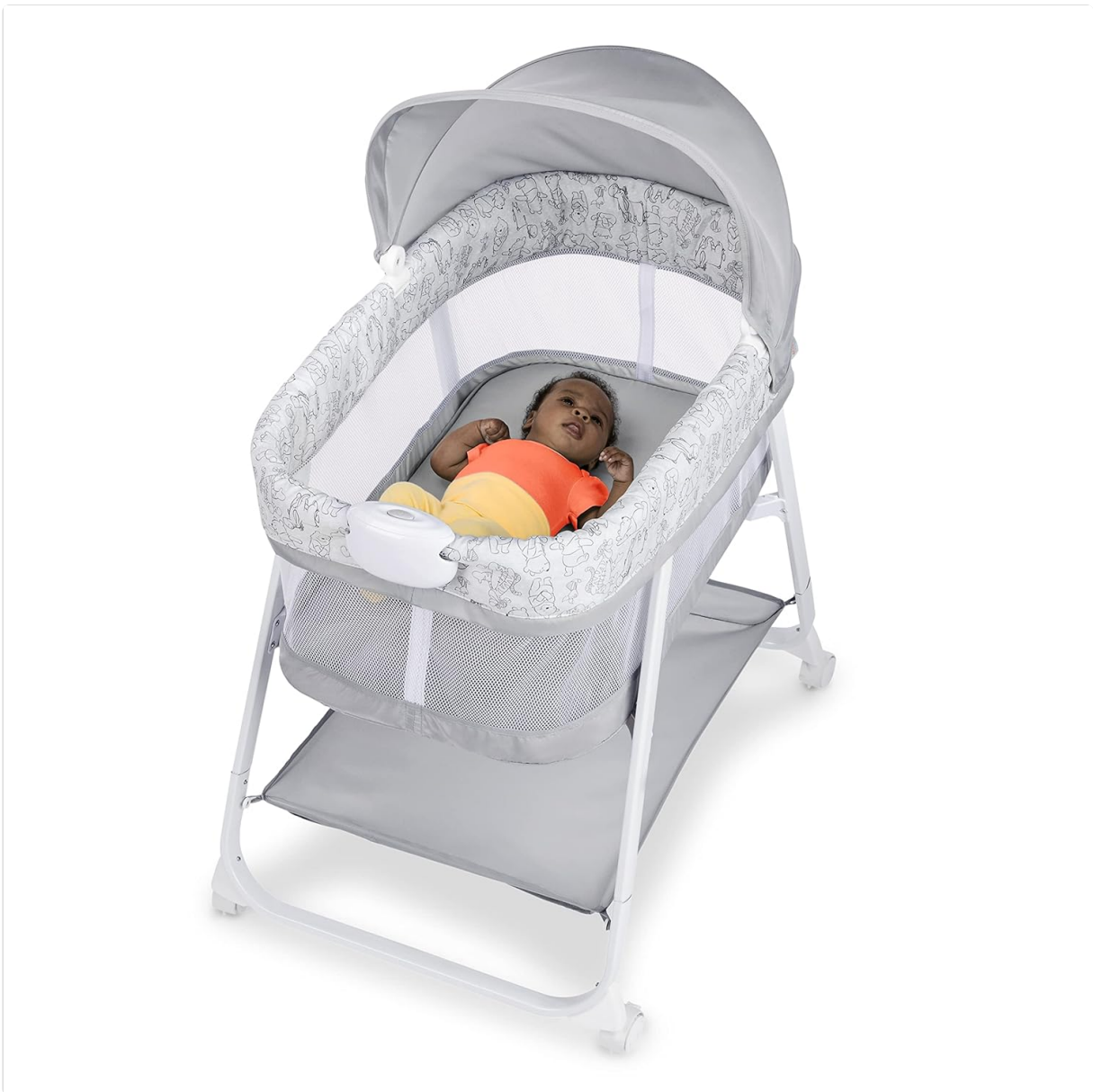
Image: The Bright Starts Disney Baby Winnie The Pooh Soothing Vibrations Baby Bassinet, shown with a baby resting comfortably inside. The bassinet features a grey fabric with Winnie the Pooh character outlines, mesh sides, a grey canopy, and a white frame with wheels.