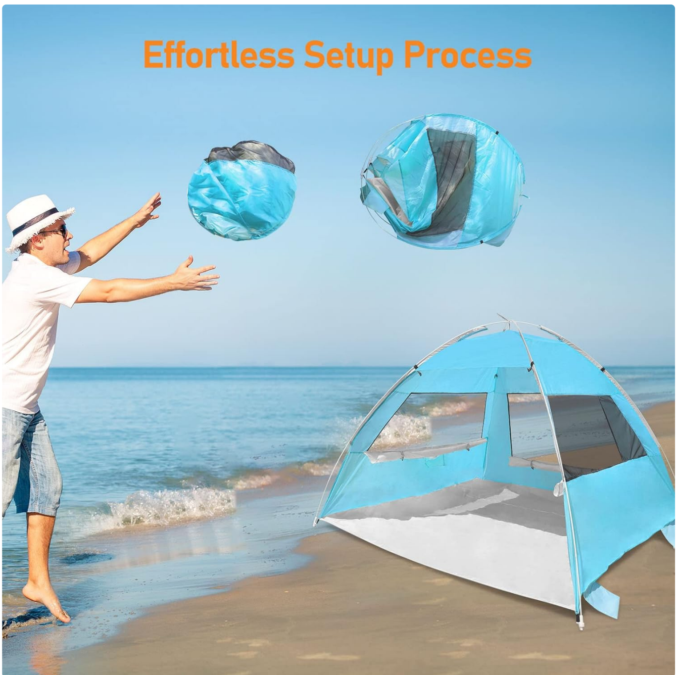
Figure 3.1: The effortless setup process, where the tent pops open automatically when released from its folded state.