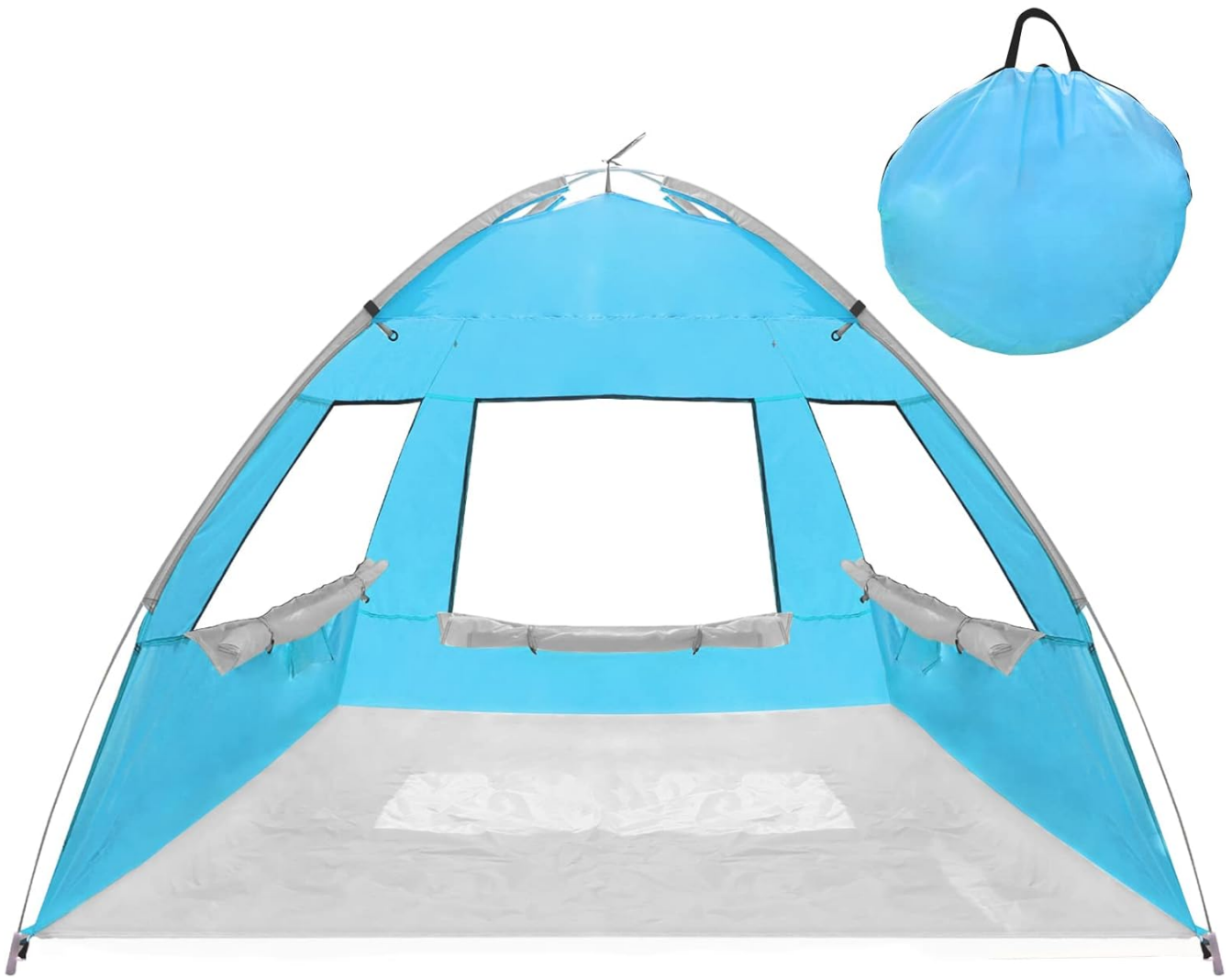
Figure 1.1: The Zyerch 2 Person Pop Up Beach Tent in light blue, shown with its compact carrying bag.