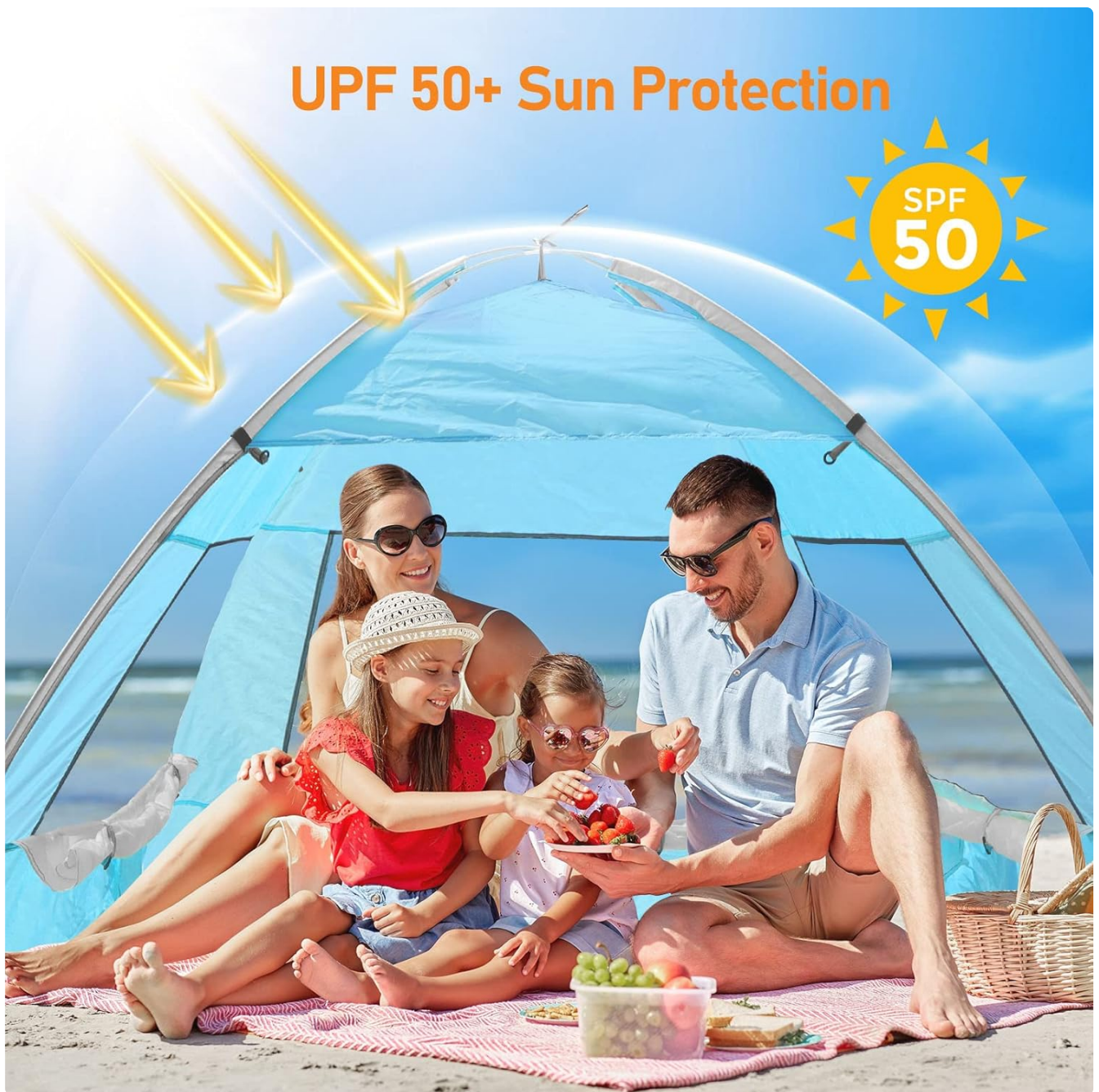
Figure 4.2: The tent providing UPF 50+ sun protection for a family enjoying the beach.