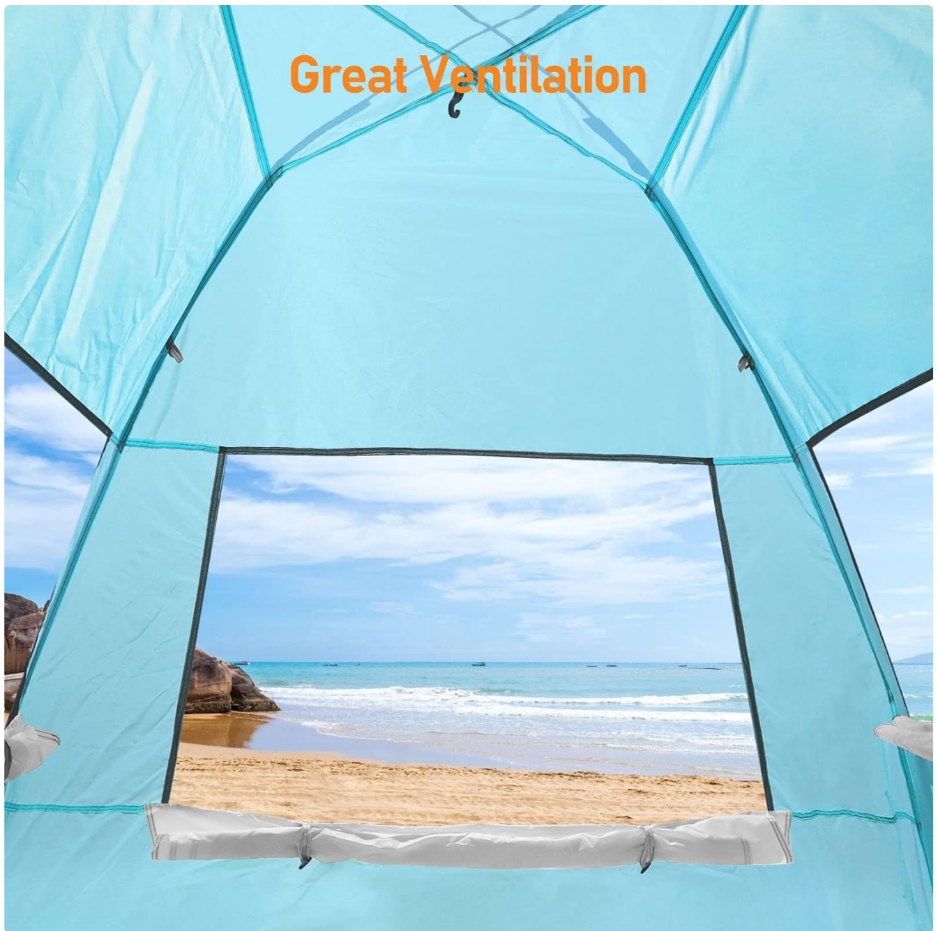
Figure 4.1: The tent's interior showcasing the large mesh windows for excellent ventilation and panoramic views.