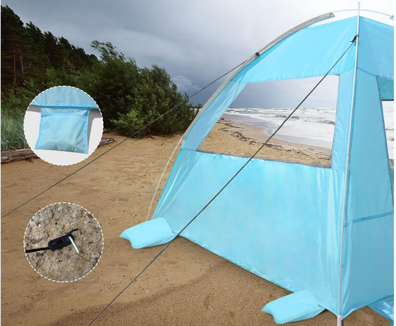
Figure 3.2: Detail of the windproof features, including sandbags and guy lines for securing the tent.