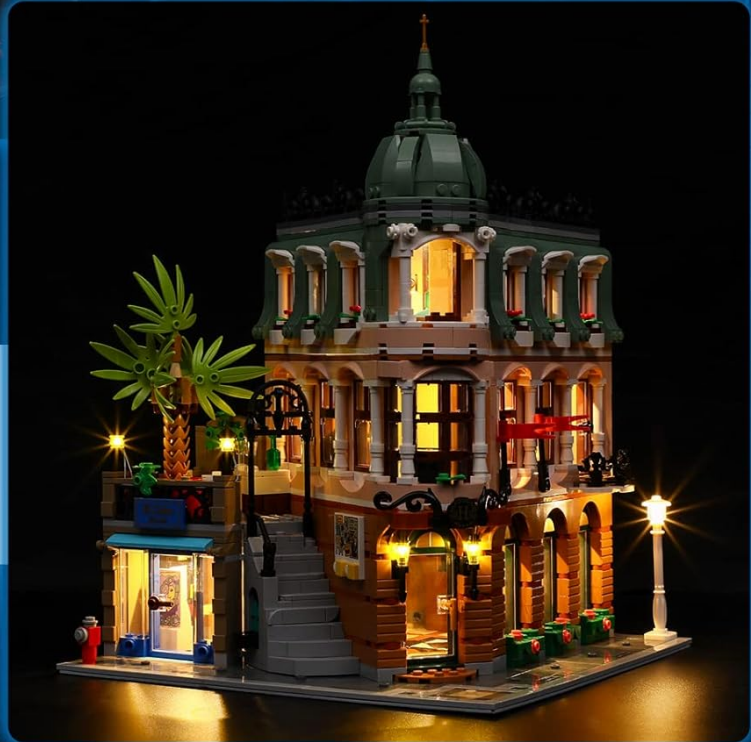
Image: A side-by-side comparison showing the LEGO Boutique Hotel model unlit and then illuminated by the YEABRICKS LED light kit, highlighting the transformative effect of the lighting.