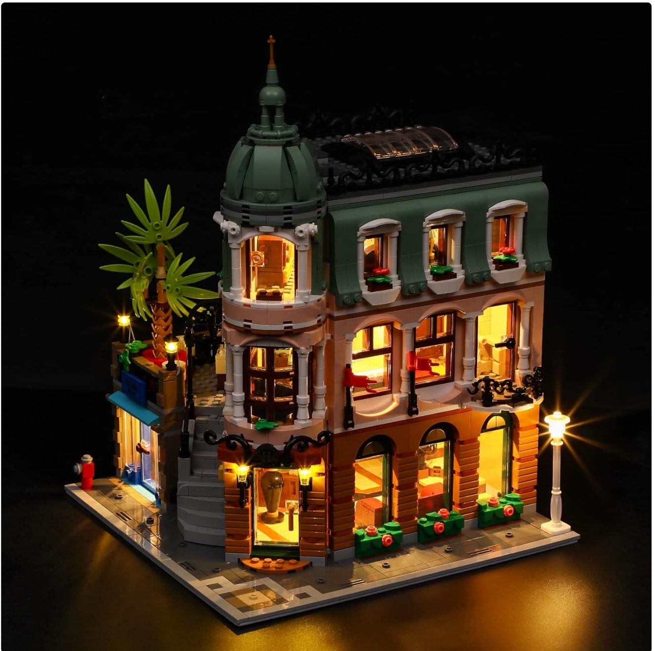
Image: The LEGO 10297 Boutique Hotel model fully illuminated by the YEABRICKS LED light kit, showcasing the detailed lighting effects on the building's exterior and interior.