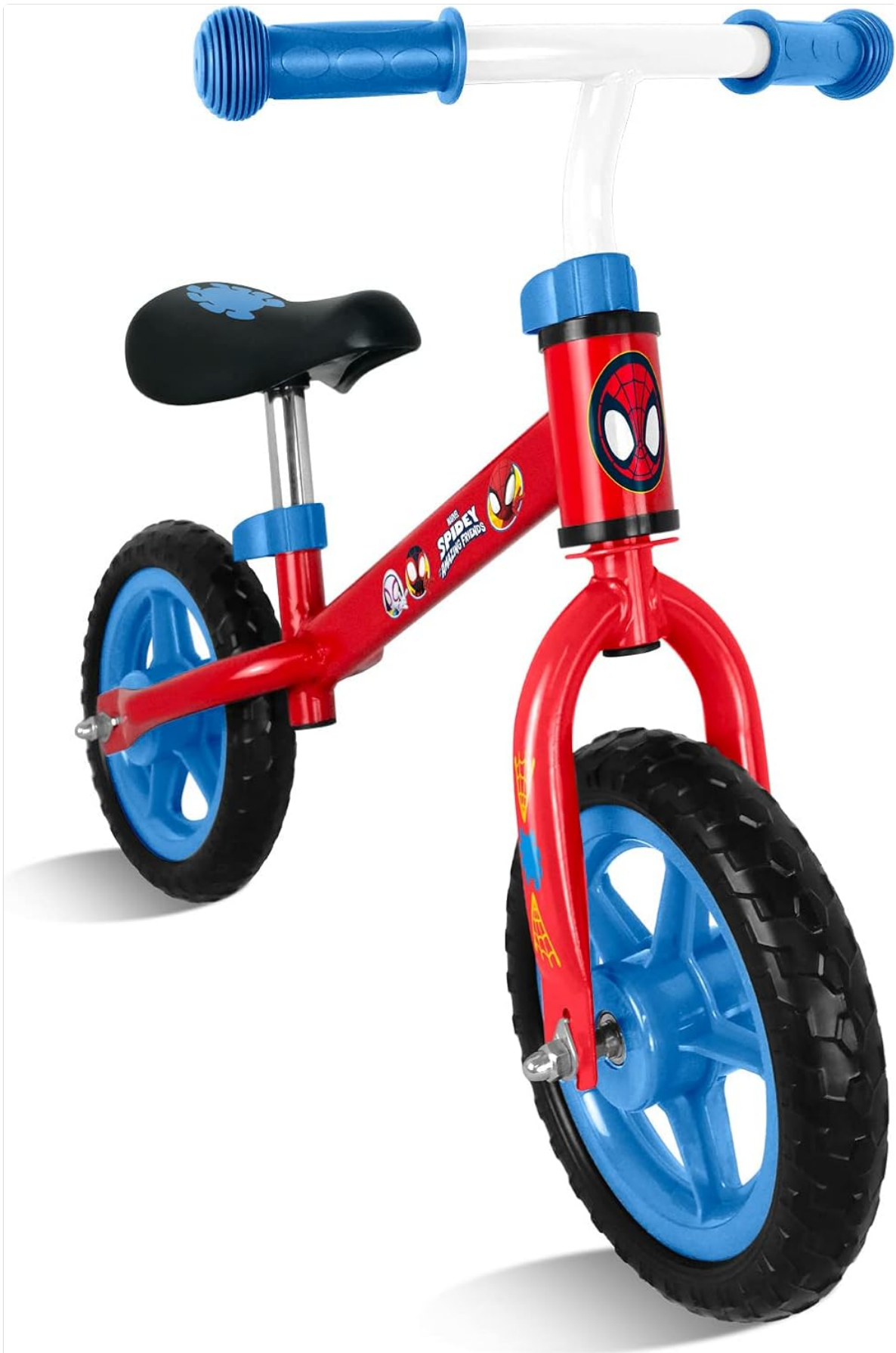
Image 3.1: Angled view of the running bike, highlighting the frame, wheels, and seat.