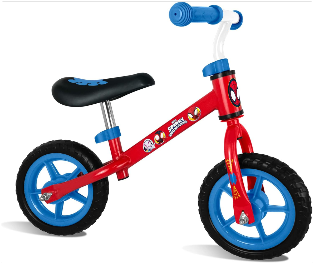
Image 1.1: The STAMP Spidey Running Bike, showcasing its red frame, blue wheels, and Spidey graphics.