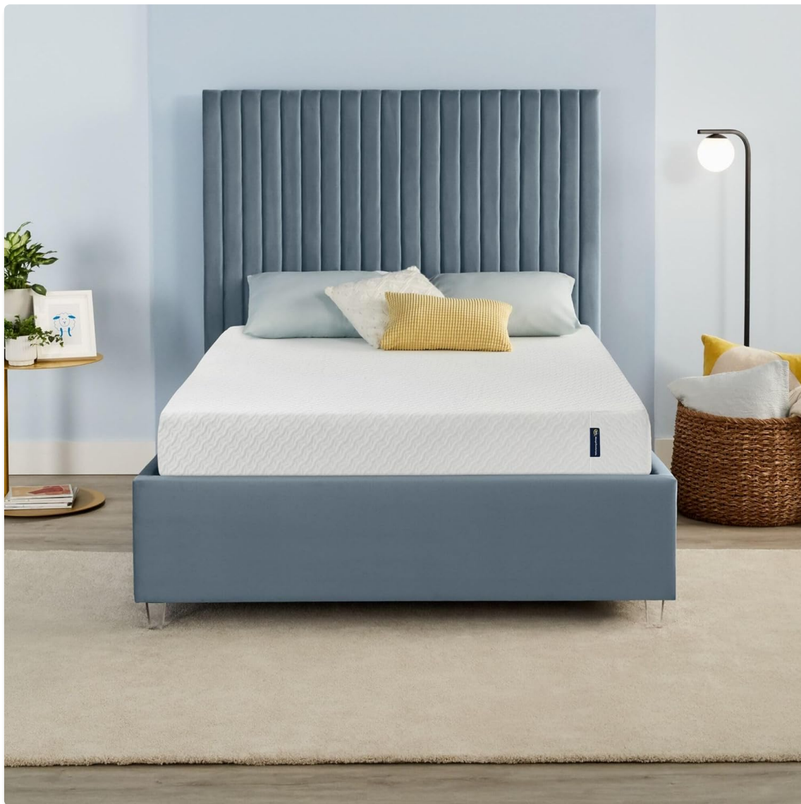
Image: The Serta 8-inch Cooling Gel Memory Foam Mattress, Twin Size, shown on a bed frame in a bedroom setting.