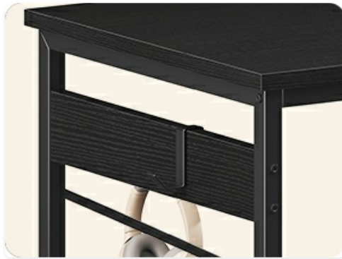
Image: Detail of the convenient iron hook for hanging accessories.