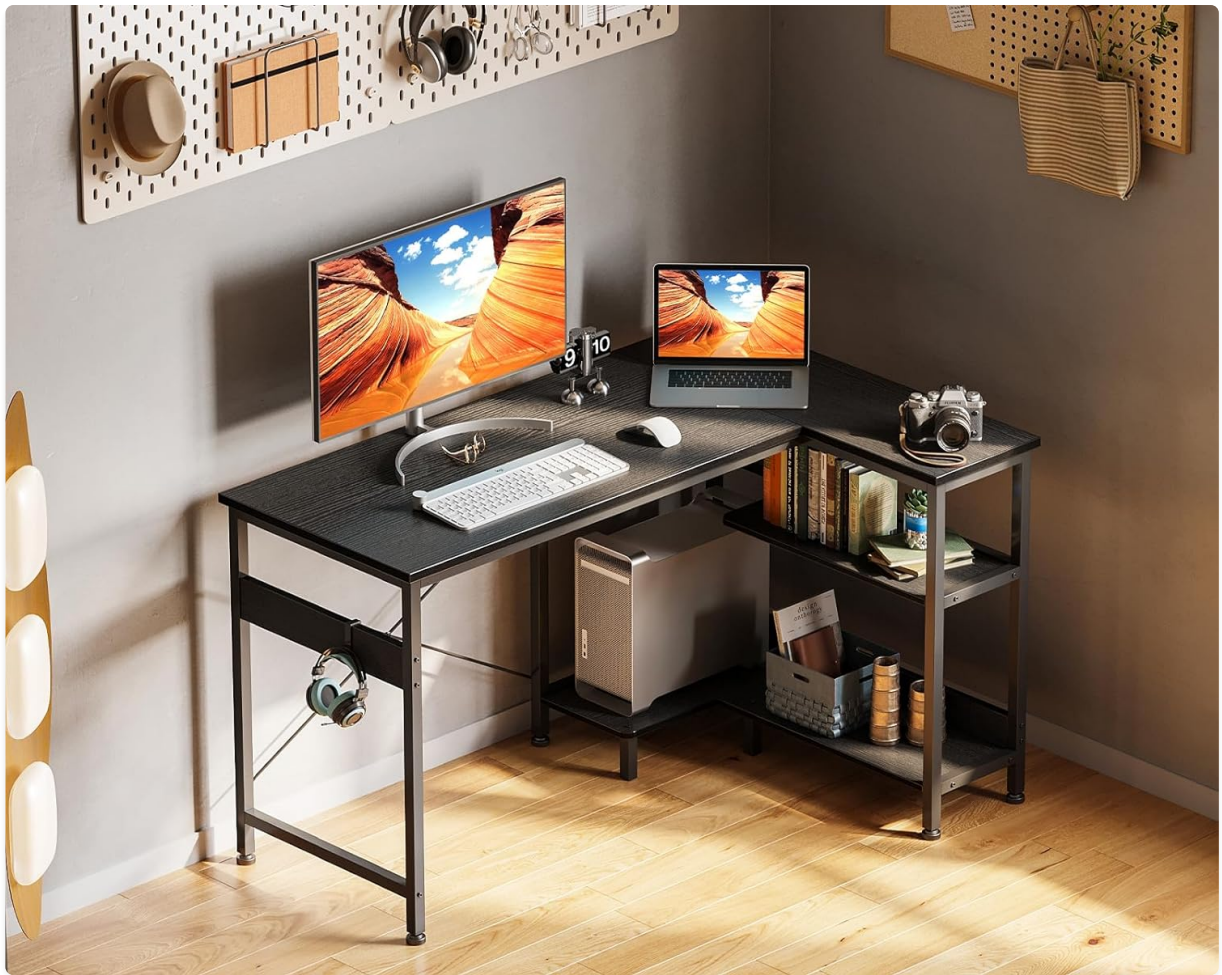
Image: The L-shaped desk positioned in a corner, demonstrating its space-saving design and how it accommodates a computer setup and storage.