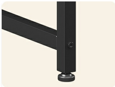
Image: Detail of the adjustable foot pad for leveling the desk on uneven surfaces.