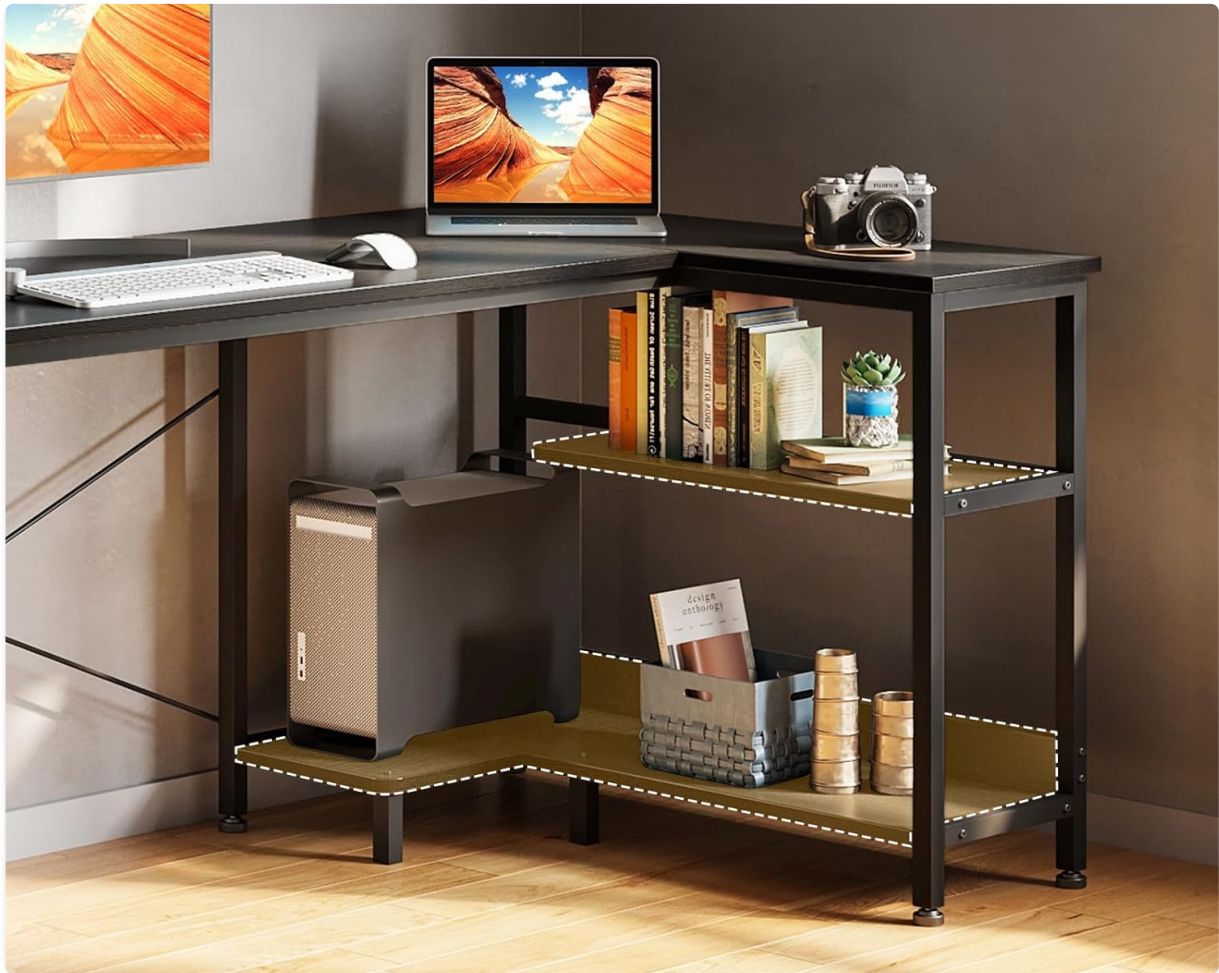
Image: A close-up showing the two-tier storage shelves, highlighting their capacity for books, files, and other items.