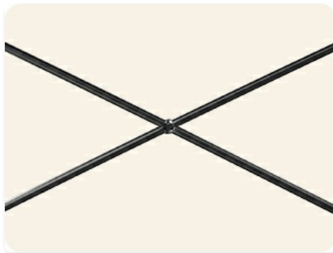
Image: Detail of the X-shaped metal brace, enhancing desk stability.