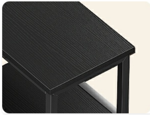
Image: Detail of the durable laminated engineered wood surface.

Image: An illustration of how two ODK L-shaped desks can be arranged side-by-side to create an extended workspace for multiple users.