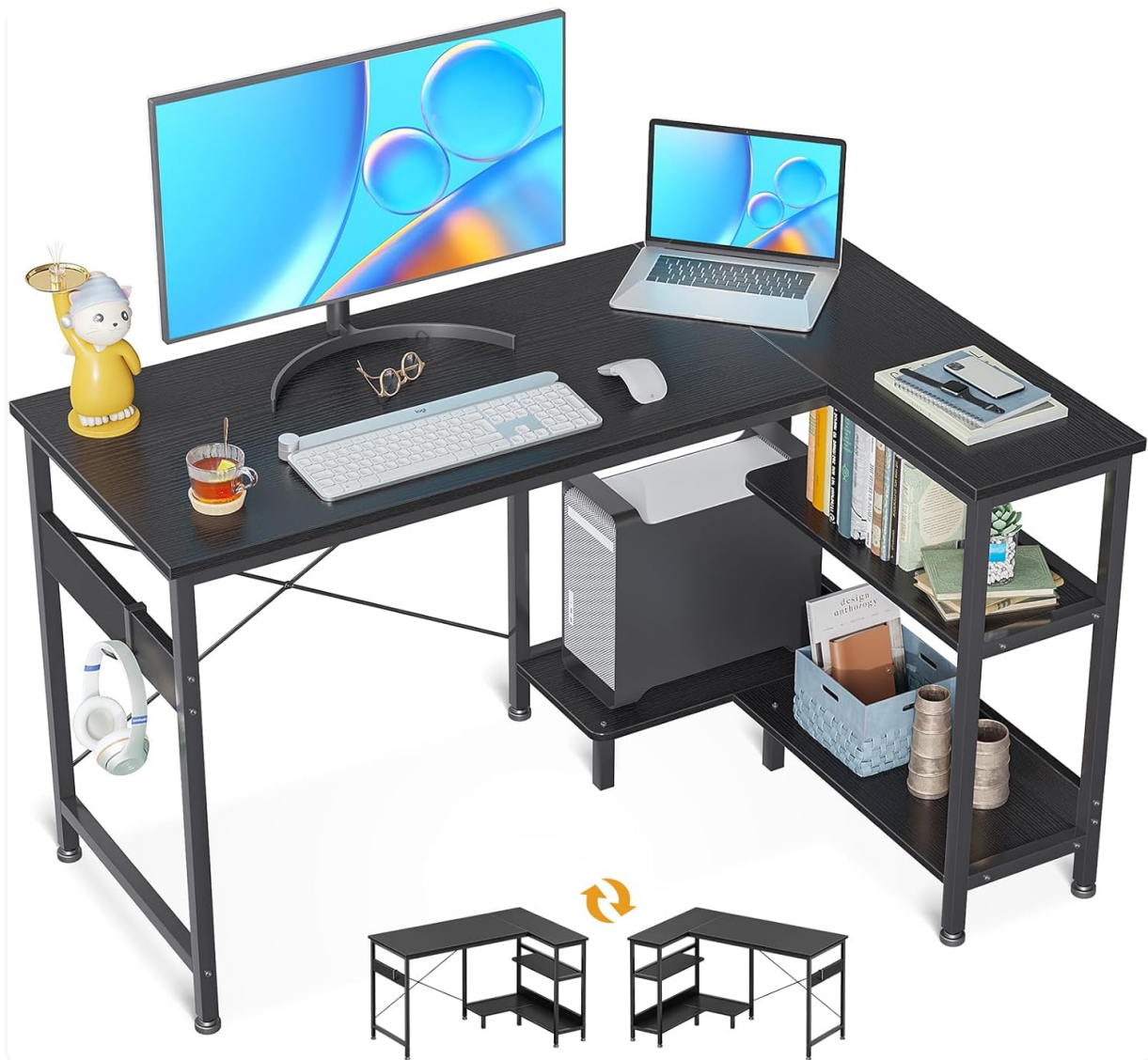
Image: The ODK L-shaped desk, black, with a computer monitor, laptop, and various office items, showcasing its compact design and functionality.