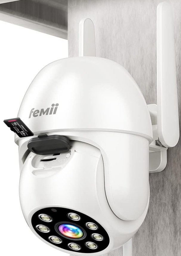
Figure 2: Location of the SD card slot for 24/7 recording.