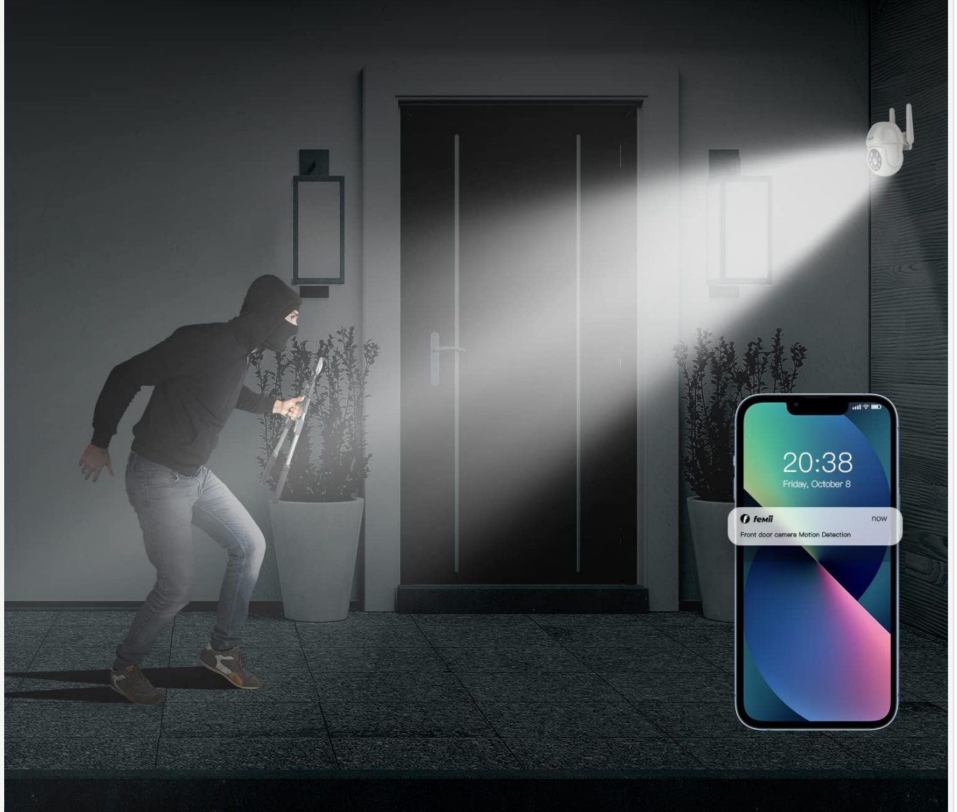
Figure 5: Motion-activated spotlight and alarm deter intruders and provide immediate alerts.