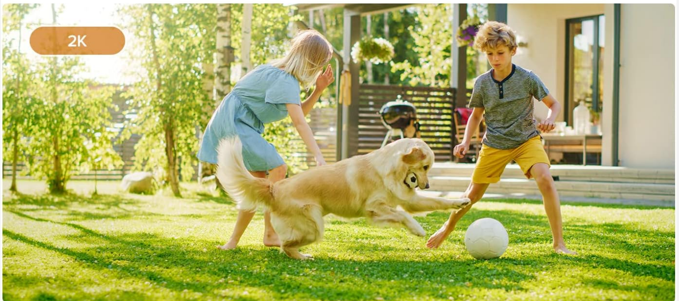
Figure 7: The 2K resolution provides significantly clearer and more detailed images compared to 1080P.