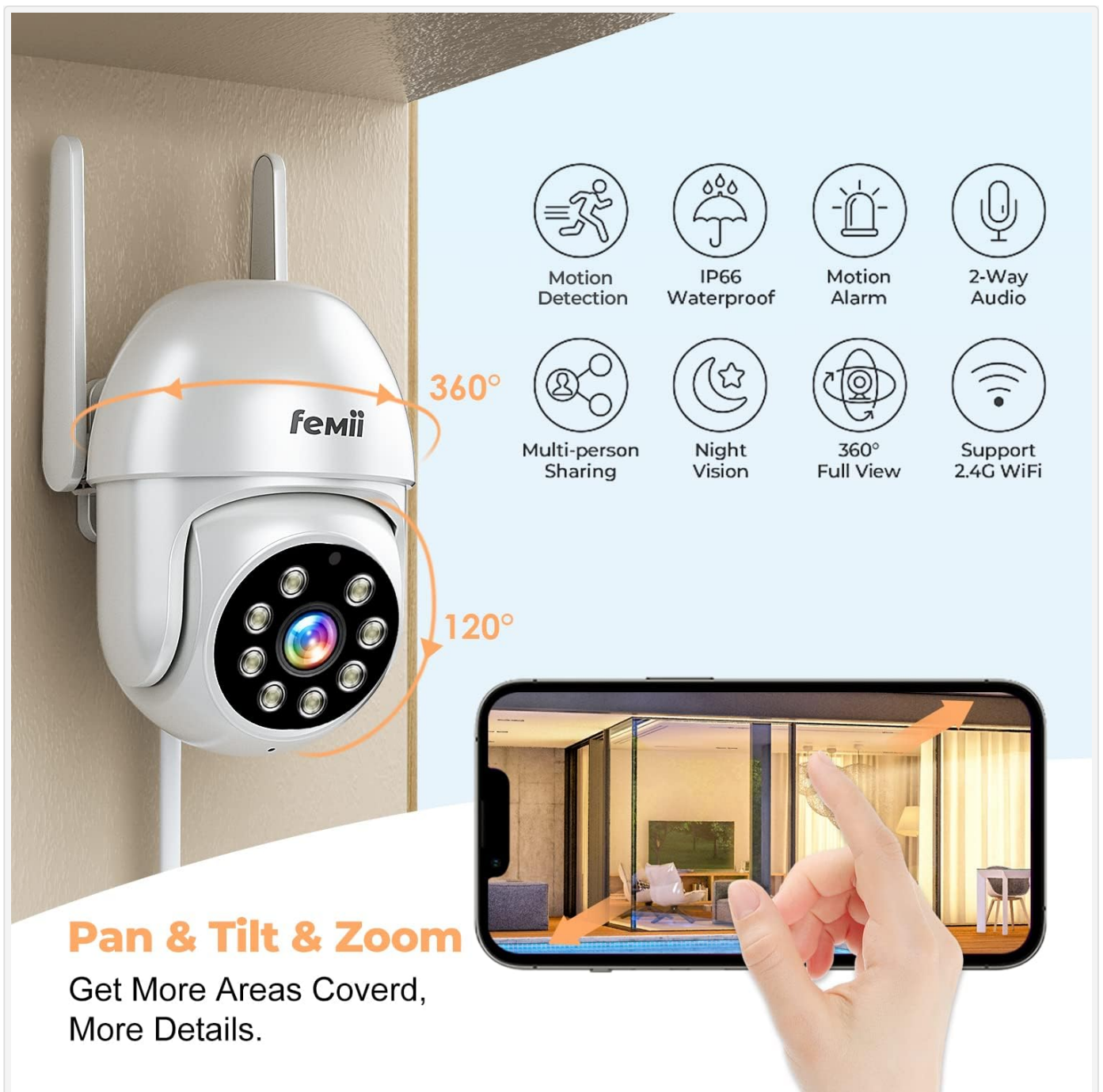
Figure 4: Pan and Tilt functionality provides extensive coverage, reducing blind spots.