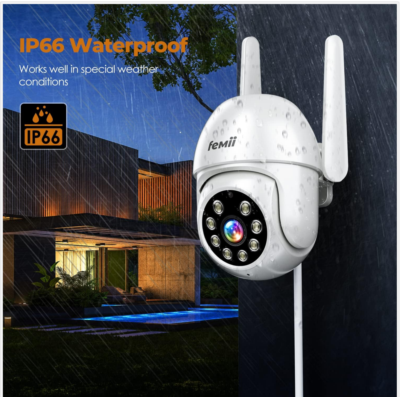
Figure 3: The camera's IP66 waterproof design allows it to function reliably in various weather conditions.