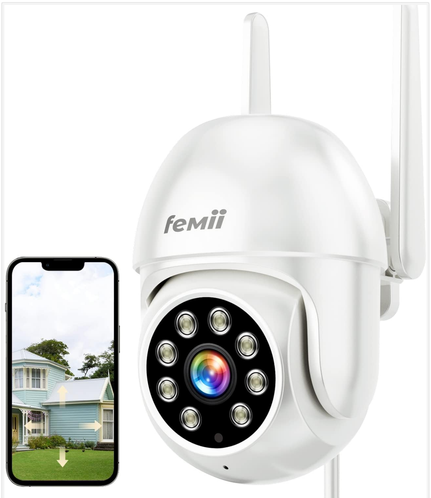
Figure 1: Femii 2K Outdoor Security Camera with live view on a smartphone.