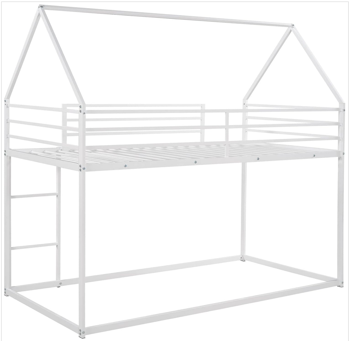
Image: A side view of the Bellemave Twin House Bunk Bed, emphasizing the metal slat support for the upper bunk.