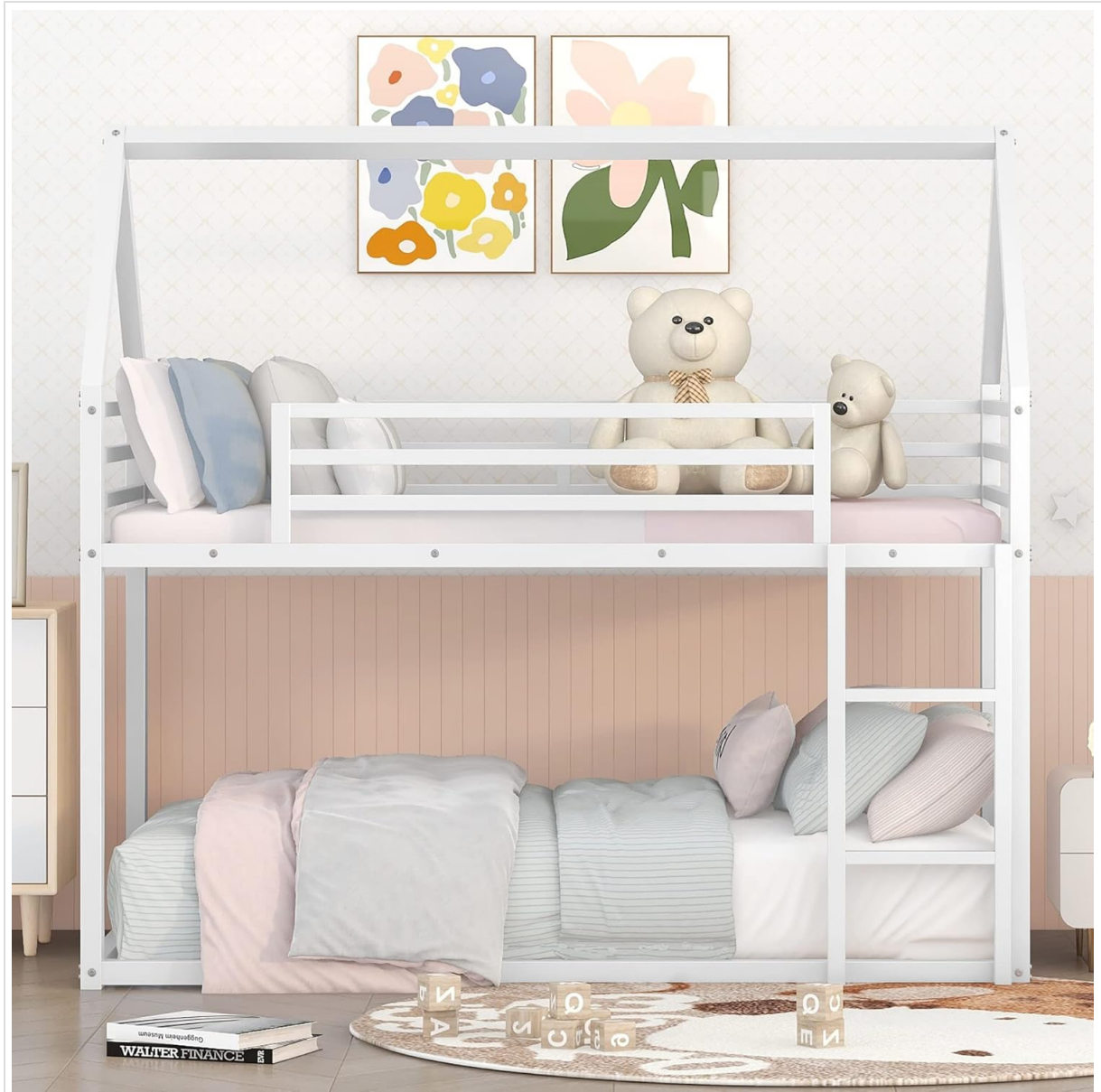
Image: The Bellemave Twin House Bunk Bed in a decorated child's room, showcasing its house-like structure and twin over twin configuration.