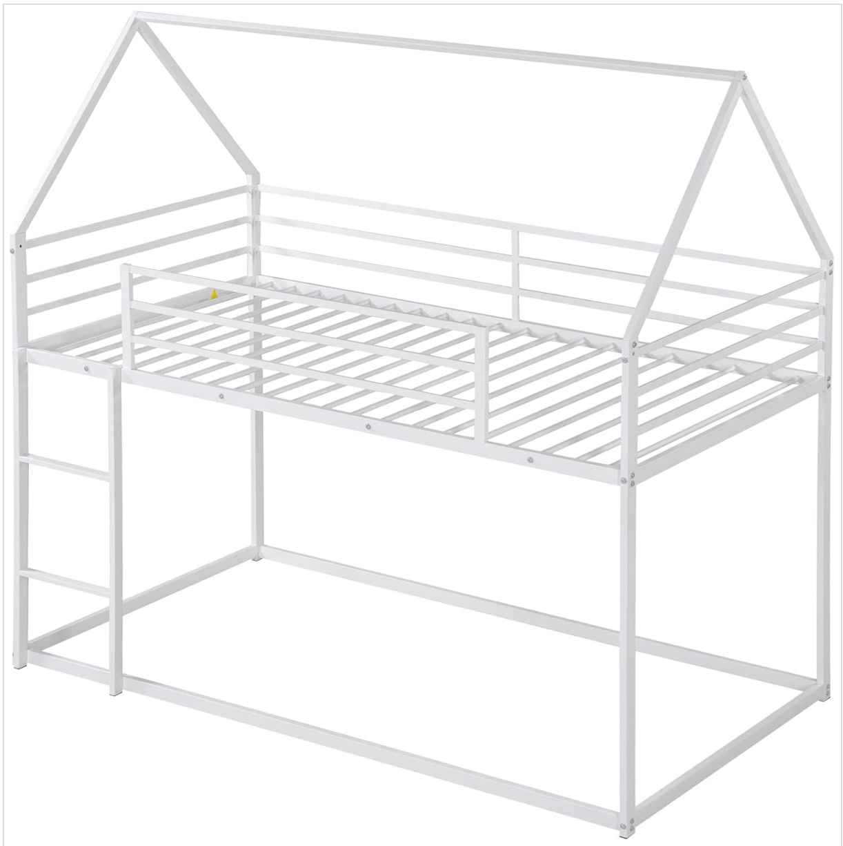
Image: An angled view of the Bellemave Twin House Bunk Bed, showing the integrated ladder and the open space for the lower bed.