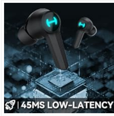
Image: An illustration depicting the low latency feature of the earbuds, highlighting the 45ms response time.

Your browser does not support the video tag.