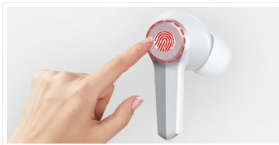
Image: A finger is shown touching the outer surface of an earbud, indicating the smart touch control area.

The Edifier Hecate GT4 earbuds feature touch-sensitive controls on each earbud. Refer to the diagram below for touch panel location.