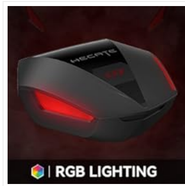
Image: The Edifier Hecate GT4 charging case is shown with its red RGB lighting illuminated, indicating its gaming aesthetic.

The charging case and earbuds feature RGB lighting. The lighting indicates various statuses such as charging, pairing, and game mode activation. The specific patterns and colors are pre-set and provide visual feedback on the earbuds' operational status.