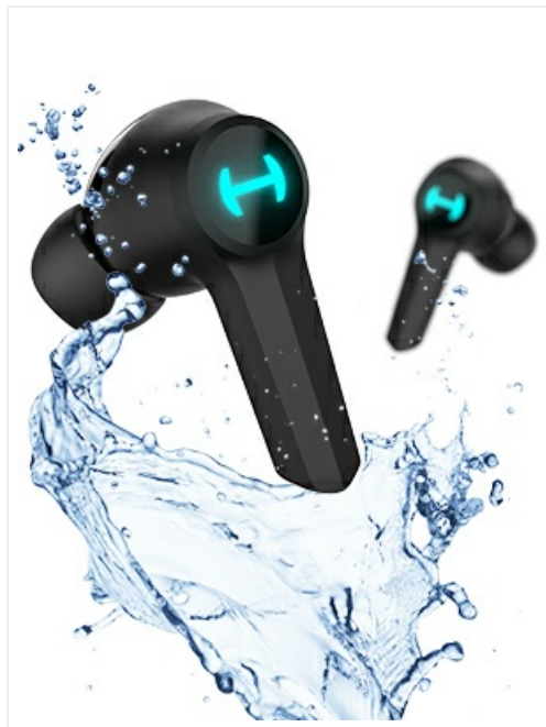
Image: An Edifier Hecate GT4 earbud is shown with water splashing around it, illustrating its water-resistant feature.