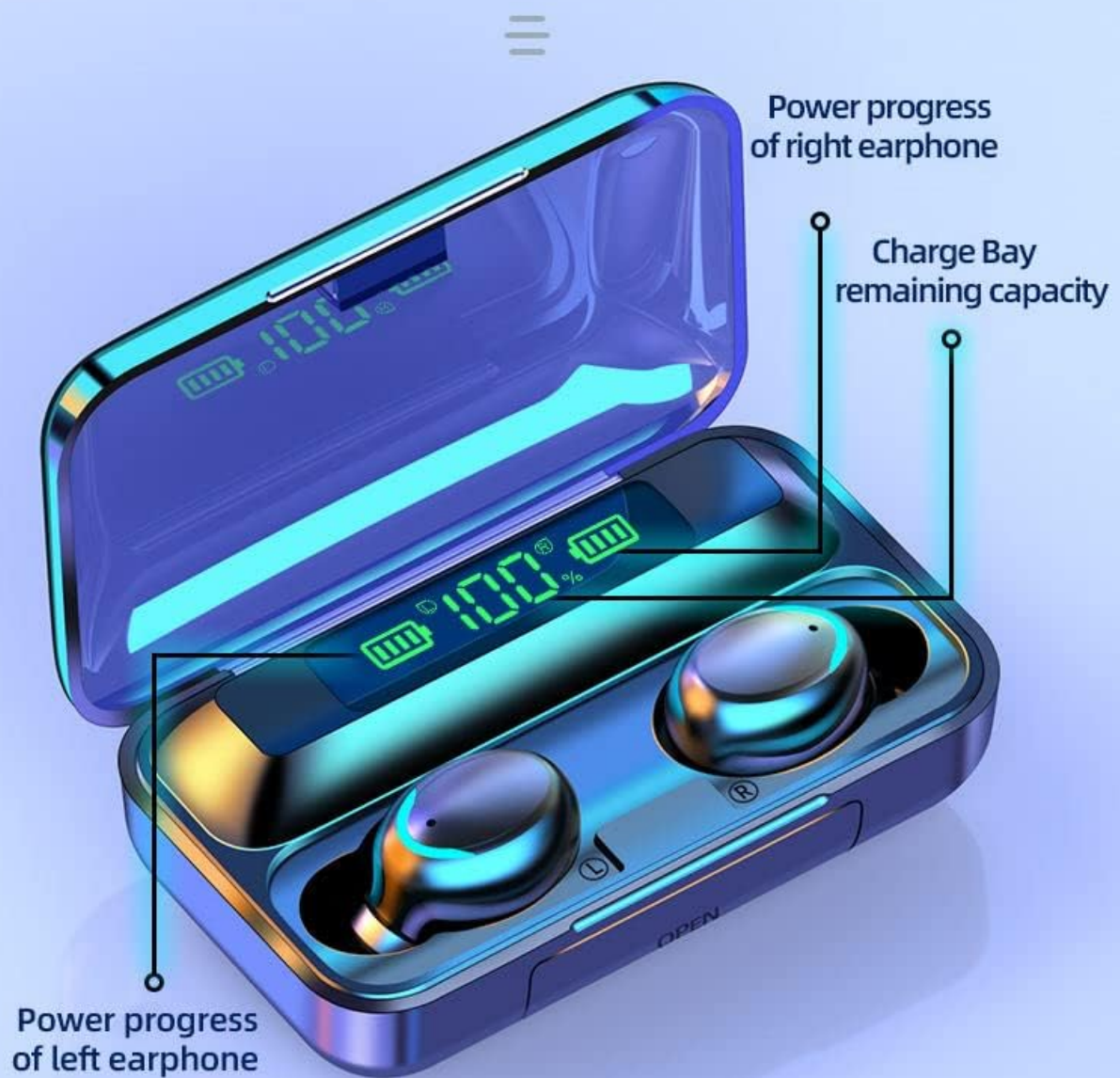
Image: Earbuds in use for music and gaming, highlighting their long endurance capabilities.

Real-time knowledge of the charge chamber remaining power, about the charging progress of the headset