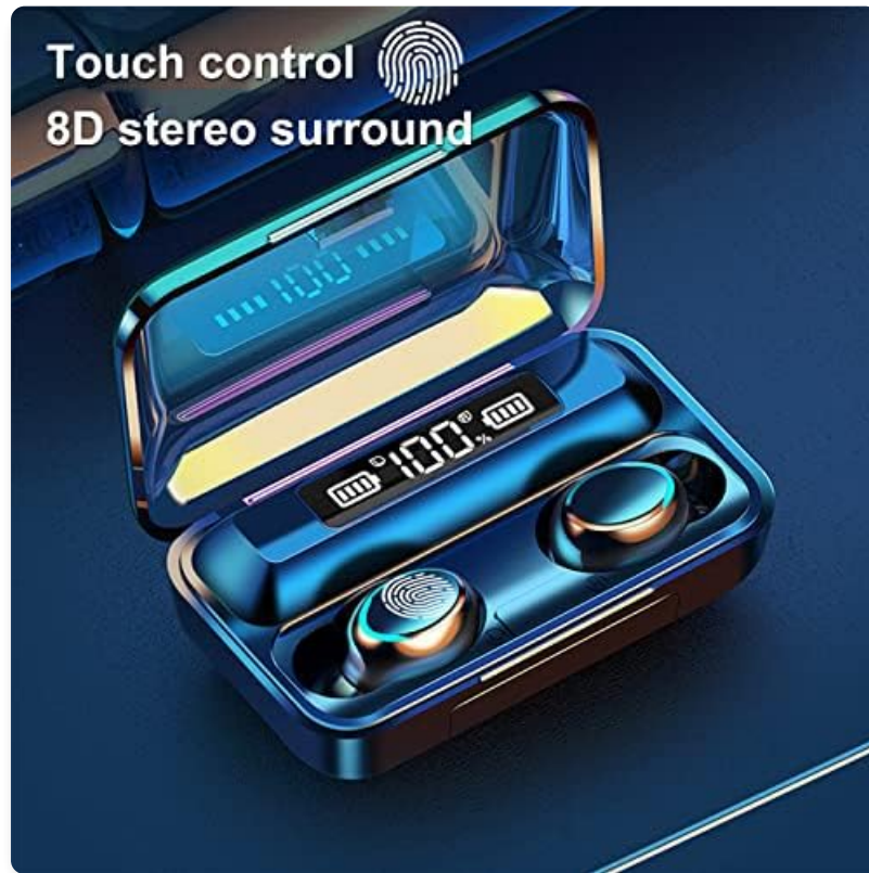
Image: Earbuds in case, illustrating touch control and digital display.