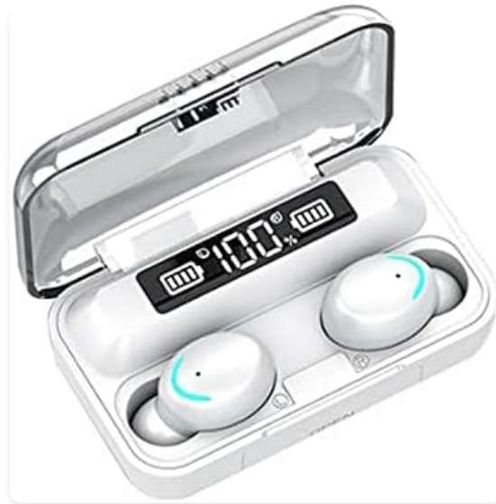
Image: White DB LLC Wireless Earbuds in their charging case, displaying battery levels.

Thank you for choosing the DB LLC Wireless Earbuds. These earbuds are designed to provide a premium audio experience with advanced features such as touch control, waterproof design, and long battery life. This manual will guide you through the setup, operation, and maintenance of your new earbuds to ensure optimal performance and longevity.