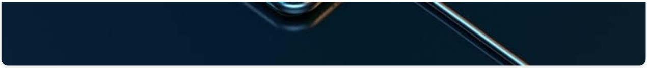
Image: The charging case doubles as a portable charger for your phone.