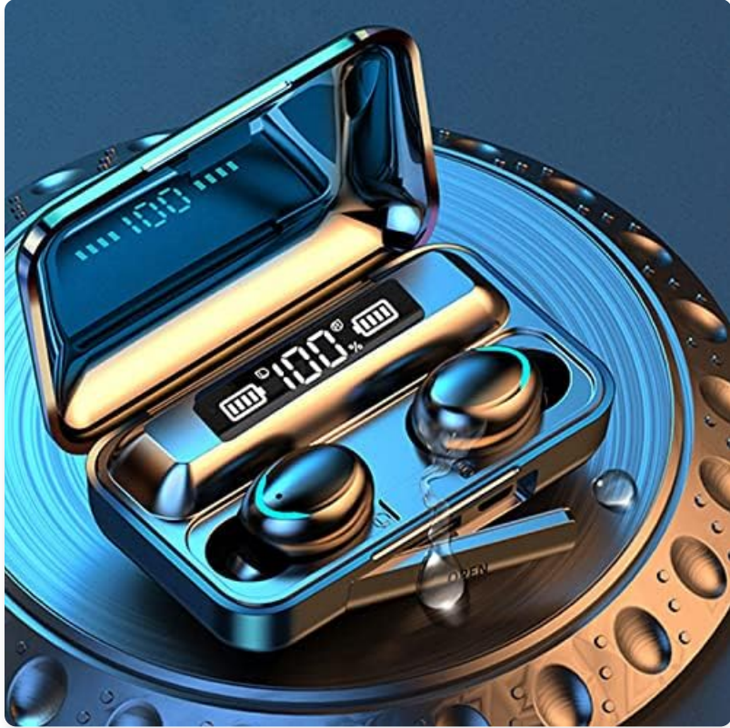
Image: Gold-colored earbuds in their charging case, highlighting the design.

The DB LLC Wireless Earbuds feature an in-ear style for comfortable and secure fit. Constructed from durable ABS and PVB materials, they are designed for longevity. With an IPX7 waterproof rating, these earbuds are protected against water immersion up to 1 meter for 30 minutes, making them suitable for various activities.