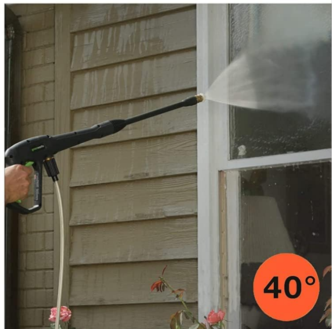
Image: Visual representation of the different spray patterns and recommended uses for the 0°, 15°, 25°, and 40° quick-connect nozzles.