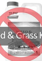
Weed & Grass Killer