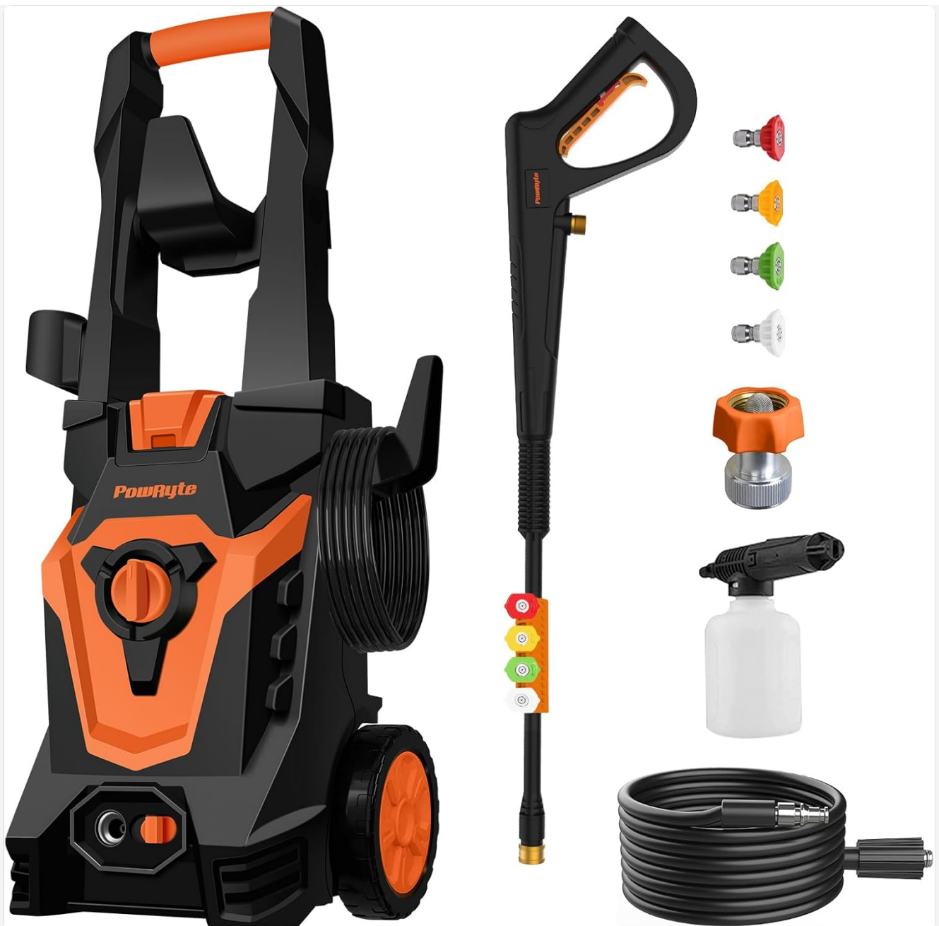
Image: The PowRyte Pressure Washer unit shown with its various accessories, including the spray gun, different nozzles, and foam cannon.

The PowRyte Pressure Washer is a powerful electric-powered cleaning tool designed for various outdoor cleaning tasks. It features a robust motor, multiple nozzle options, and a Total Stop System for enhanced safety and efficiency.