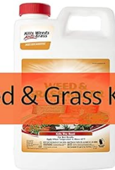
Weed & Grass Killer