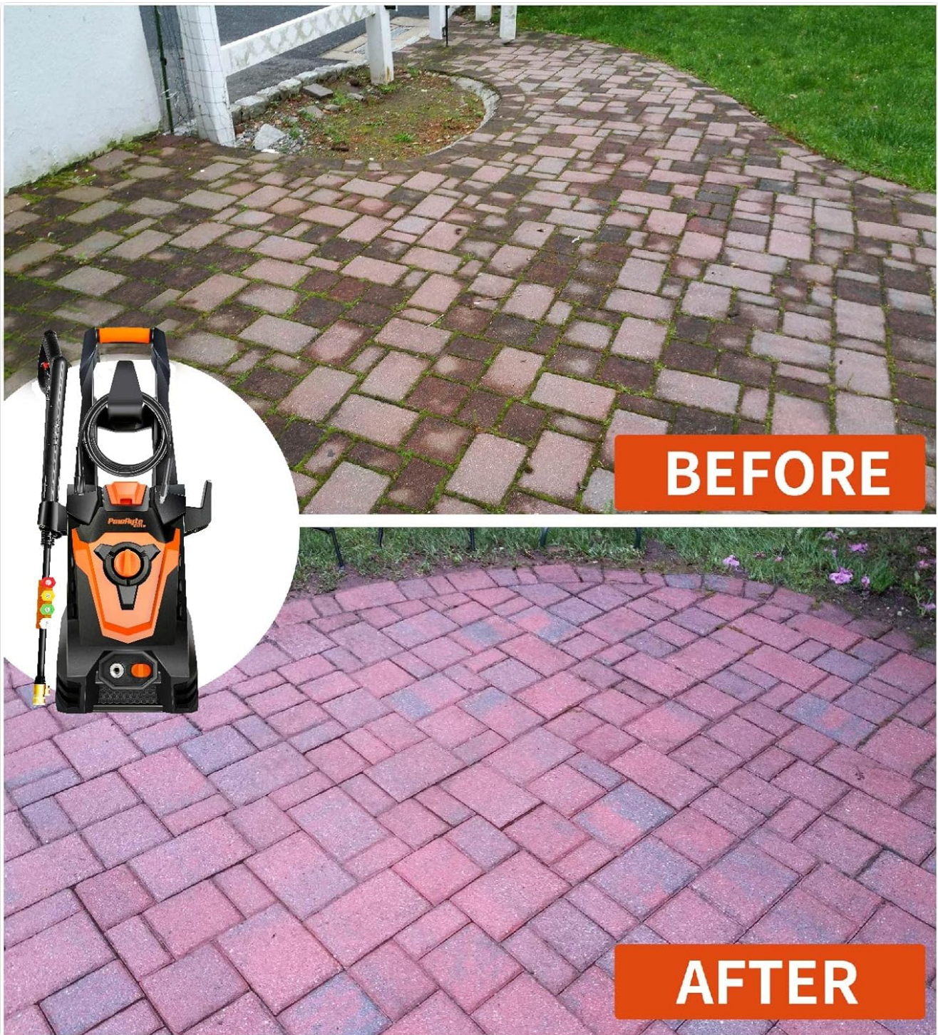
Image: A side-by-side comparison showing a dirty patio before pressure washing and the same patio after cleaning, highlighting the cleaning power of the unit.