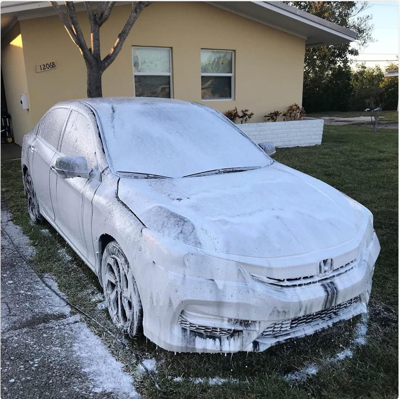
Image: A car covered in cleaning foam, demonstrating the effectiveness of the foam cannon accessory.