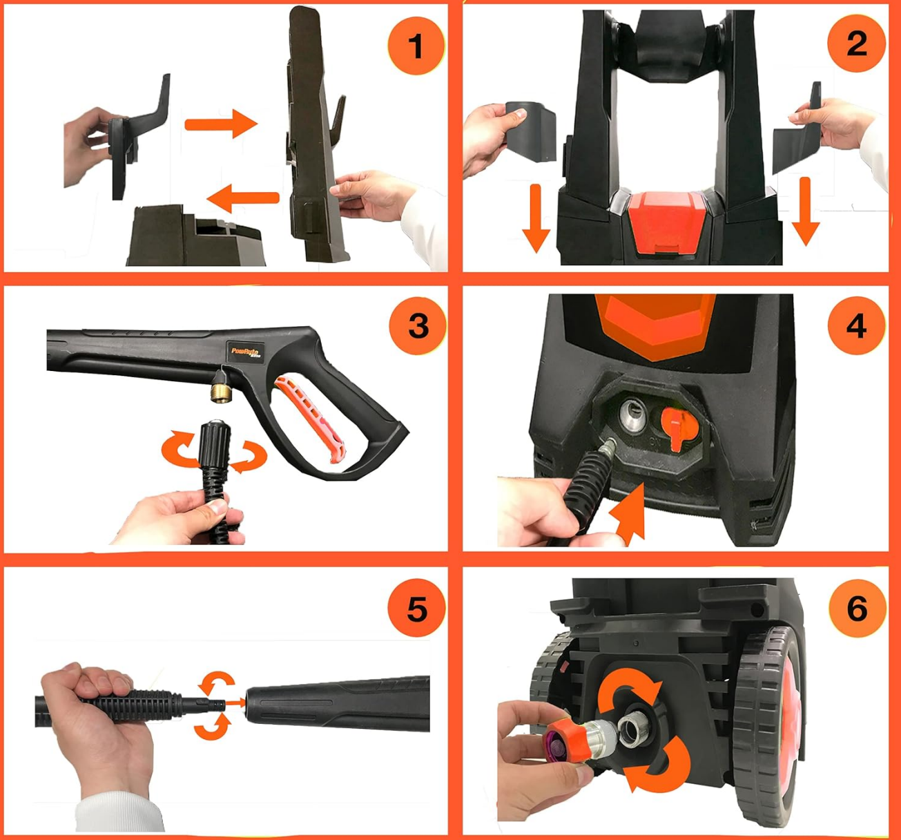
Image: Step-by-step visual guide demonstrating the assembly process, including attaching the handle, connecting the spray gun, hose, and nozzles.