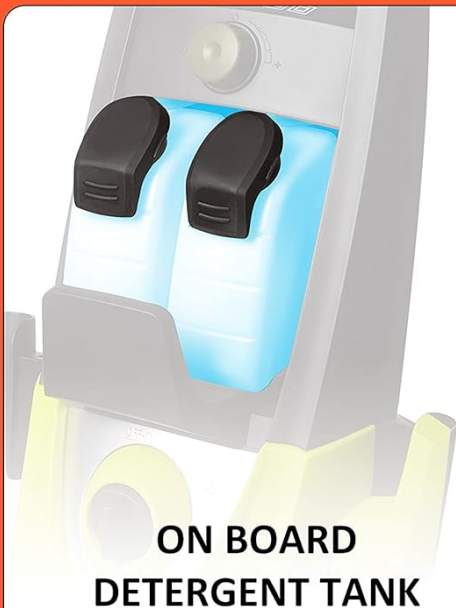
ON BOARD DETERGENT TANK