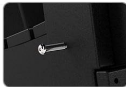
Pull the bolt