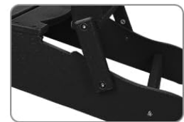
Raise the seat